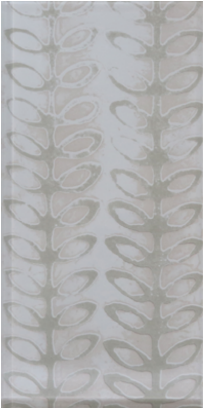
6x12 FLORA HEMP