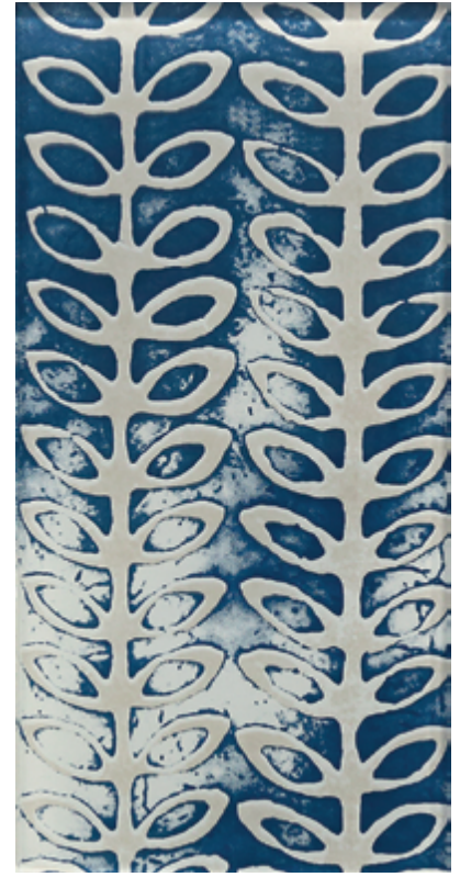
6x12 FLORA INDIGO