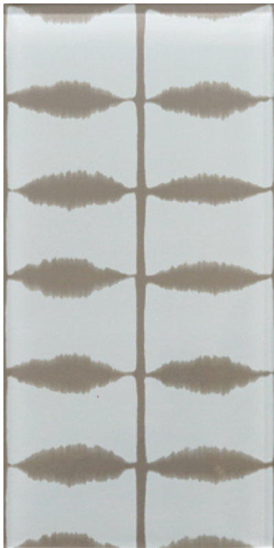
6x12 TRIBE JAVA