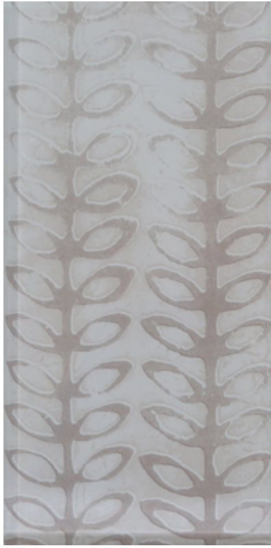
6x12 FLORA JAVA