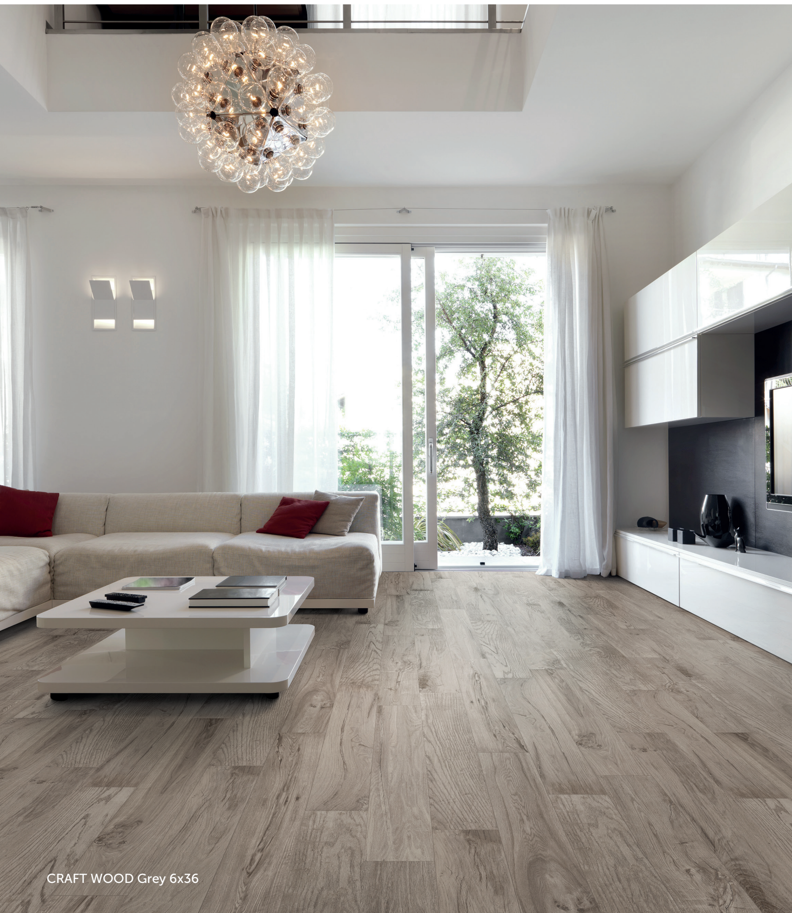
CRAFT WOOD Grey 6x36