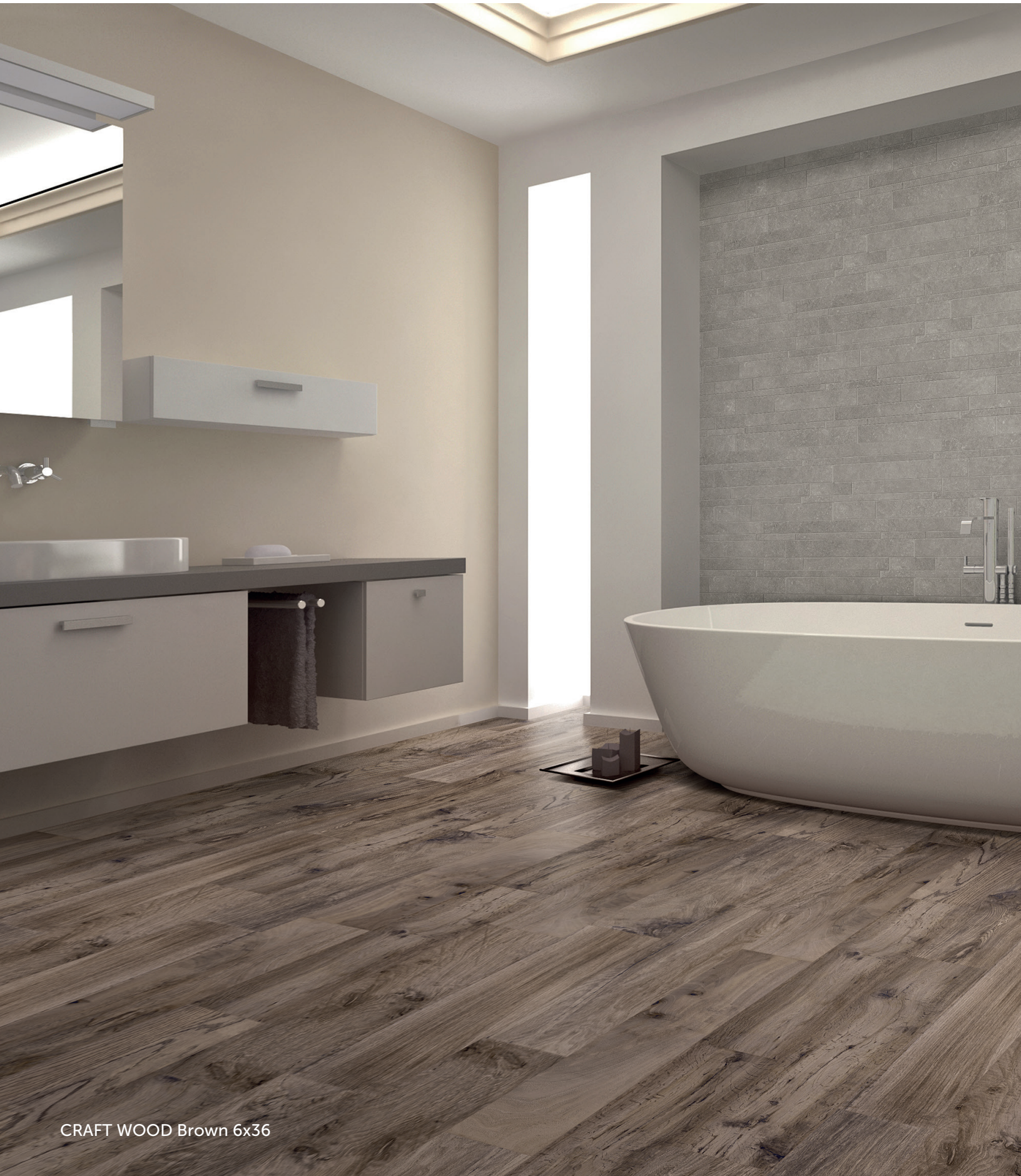
CRAFT WOOD Brown 6x36