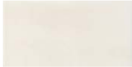
3x6 - Biscuit Glossy