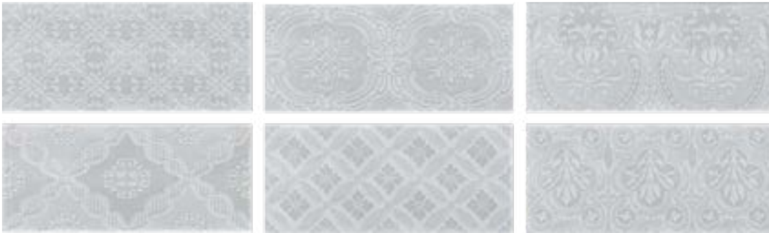
4x10 - Tender Gray Decor Mix