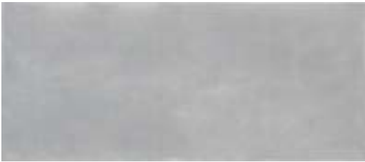
4x10 - Tender Gray