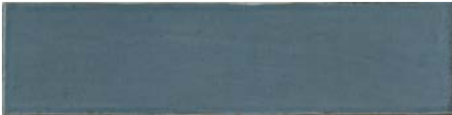
3x12 - Blue Steel Glossy Crackled