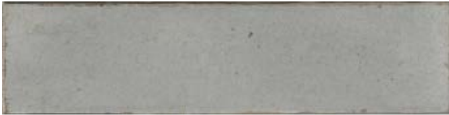
3x12 - Tender Gray Glossy Crackled