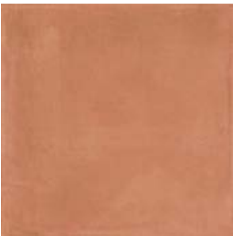
8x8 - Coto