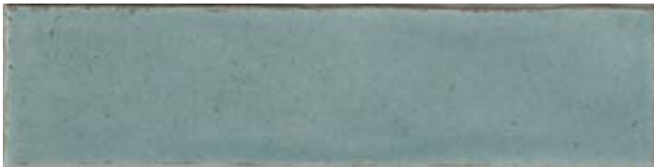
3x12 - Aqua Glossy Crackled