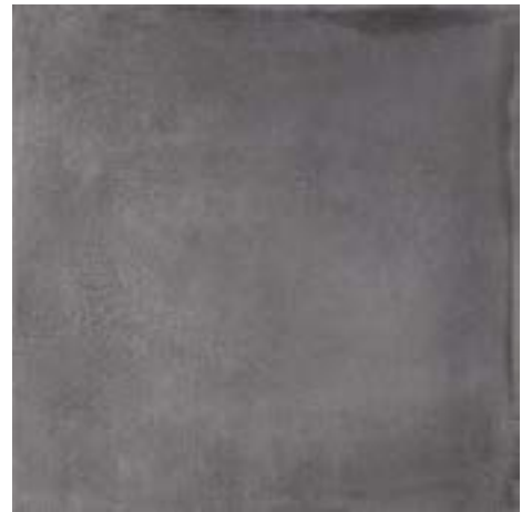
8x8 - Taupe Matte