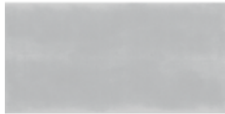
3x6 - Tender Gray Glossy