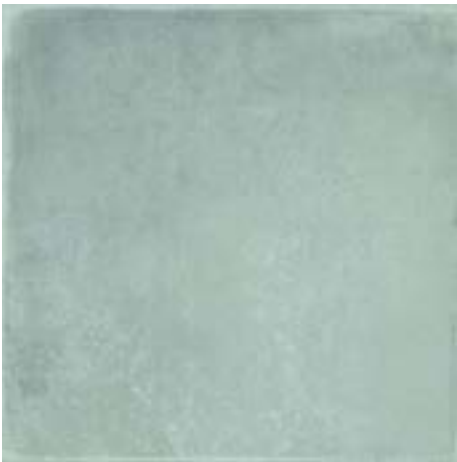
8x8 - Aqua Matte