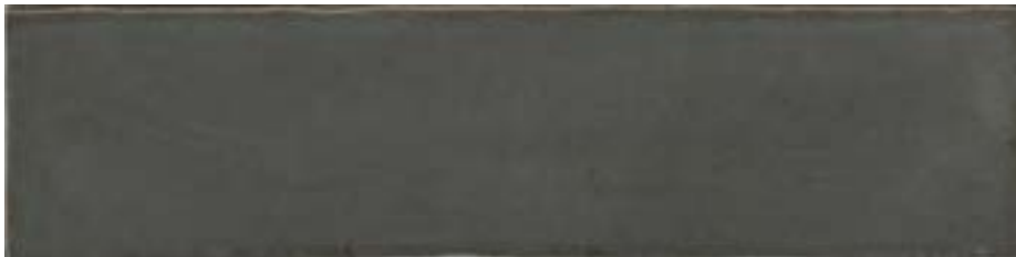
3x12 - Taupe Glossy Crackled