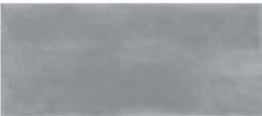
4x10 - Taupe