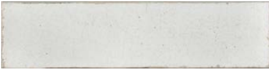
3x12 - White Glossy Crackled