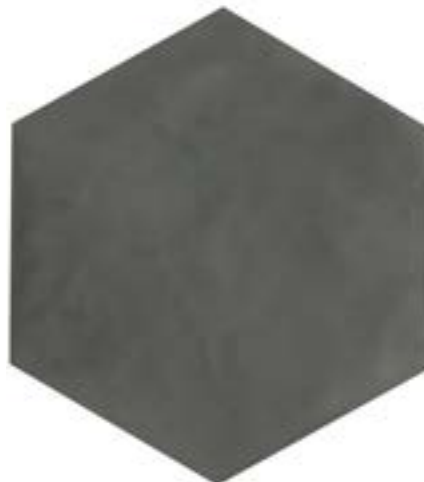
7x8 - Taupe Glossy Hex