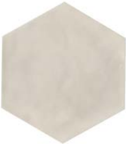
7x8 - Biscuit Glossy Hex