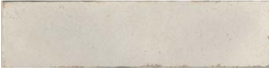
3x12 - Biscuit Glossy Crackled