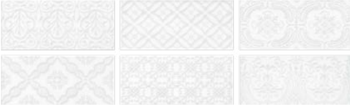
4x10 - White Decor Mix