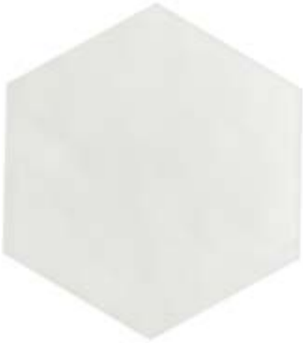
7x8 - White Glossy Hex*