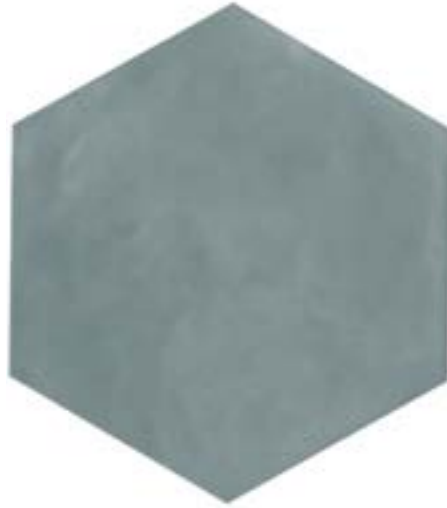
7x8 - Aqua Glossy Hex