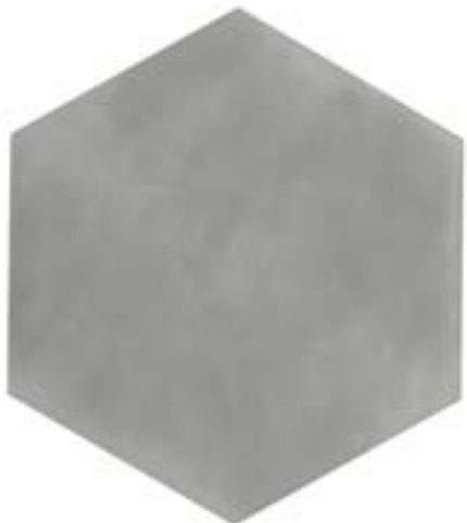
7x8 - Tender Gray Glossy Hex