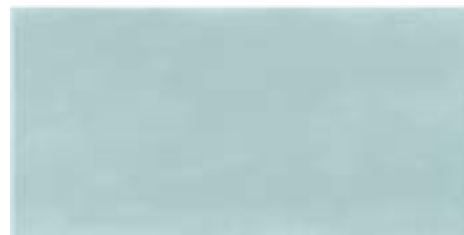
3x6 - Aqua Glossy