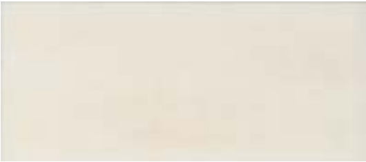
4x10 - Biscuit