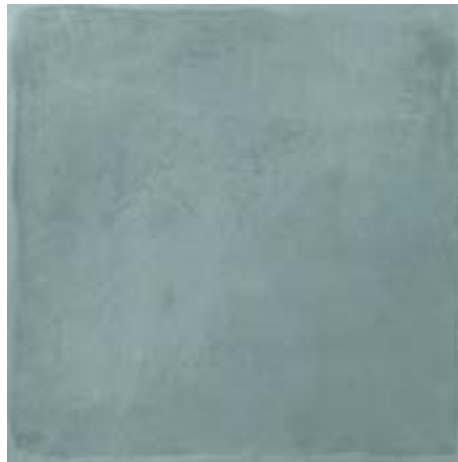
8x8 - Blue Steel Matte