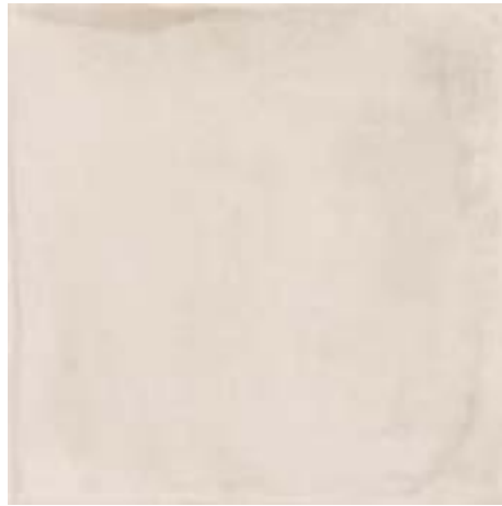
8x8 - Biscuit Matte