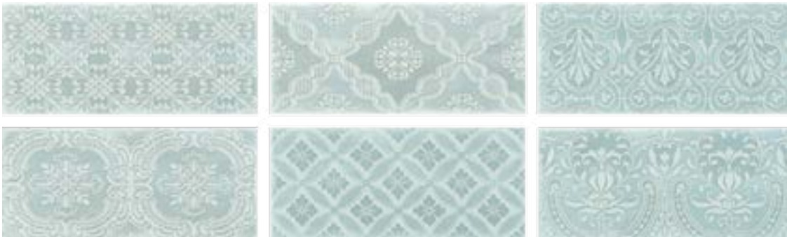
4x10 - Aqua Decor Mix