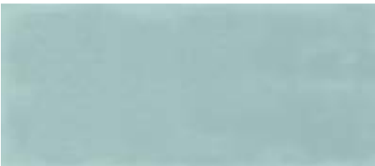
4x10 - Aqua