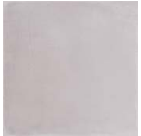
8x8 - Tender Gray Matte