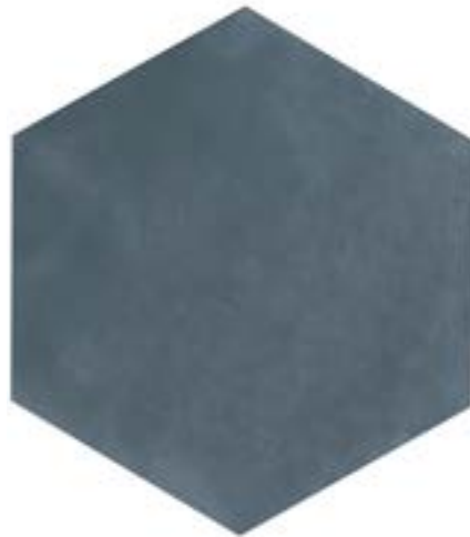
7x8 - Blue Steel Glossy Hex