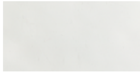
3x6 - White Glossy*