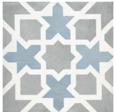
8x8 - Pattern T. Gray