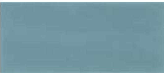
4x10 - Blue Steel