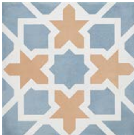
8x8 - Pattern Coto