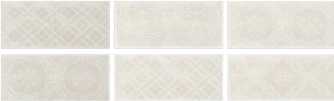
4x10 - Biscuit Decor Mix