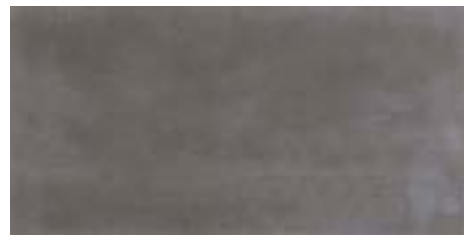
3x6 - Taupe Glossy