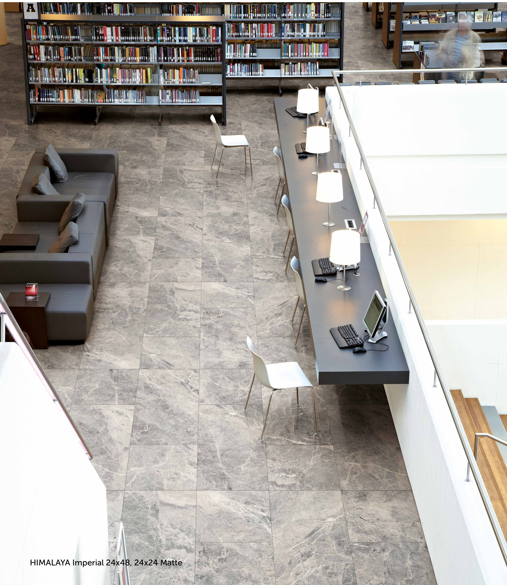
HIMALAYA Imperial 24x48, 24x24 Matte