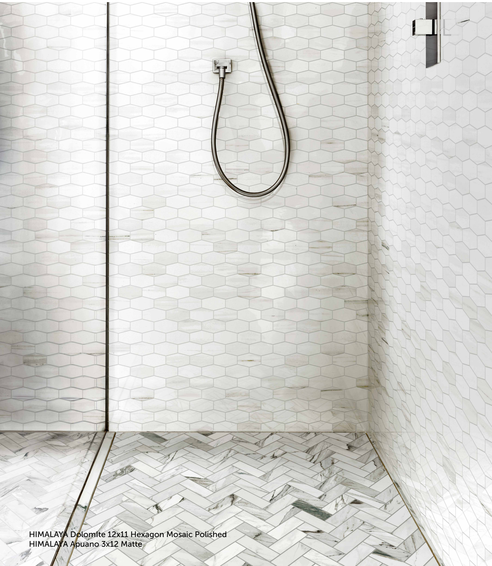
HIMALAYA Dolomite 12x11 Hexagon Mosaic Polished HIMALAYA Apuano 3x12 Matte