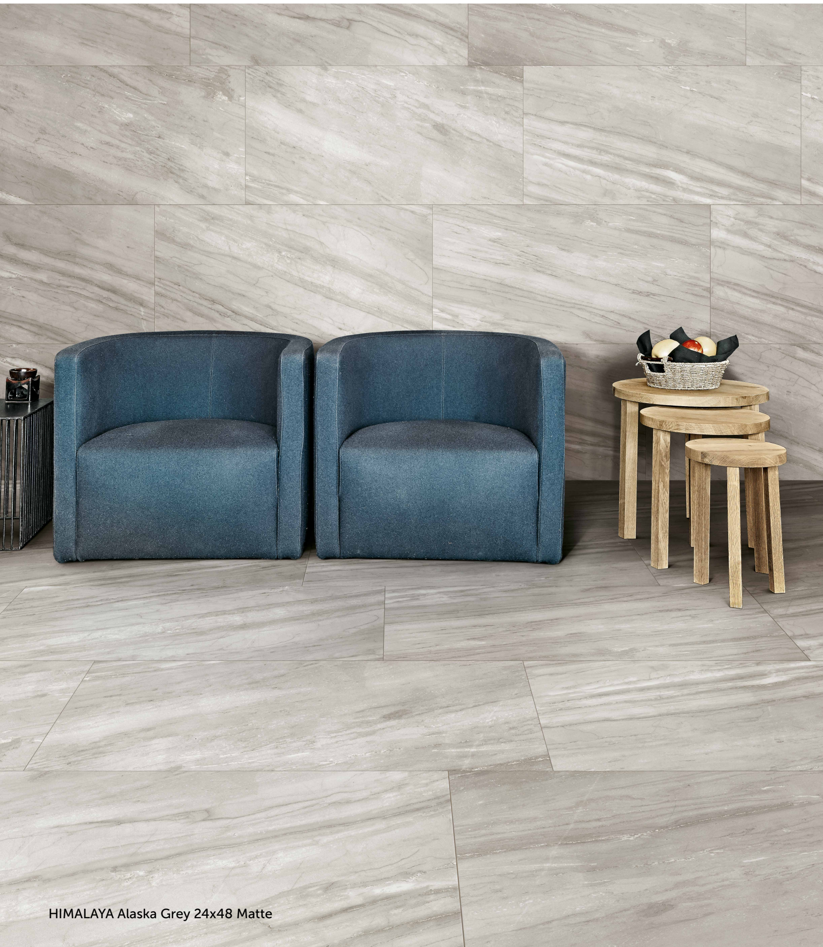
HIMALAYA Alaska Grey 24x48 Matte