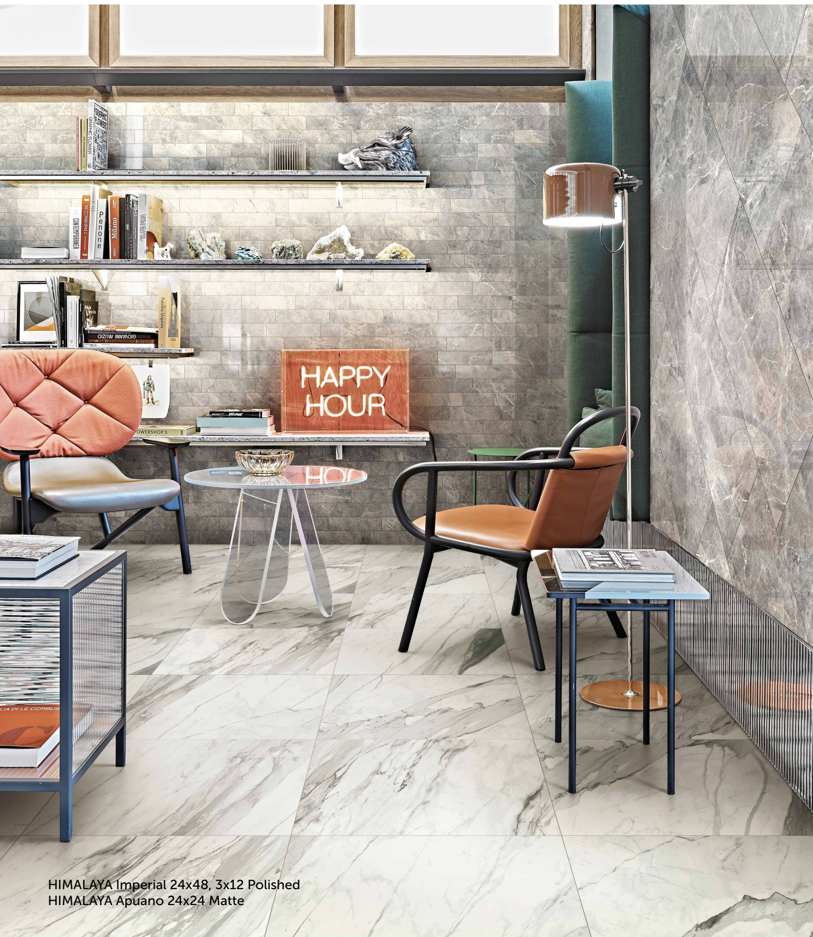
HIMALAYA Imperial 24x48, 3x12 Polished HIMALAYA Apuano 24x24 Matte