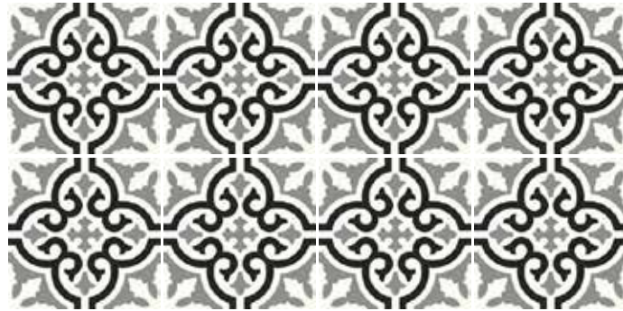
Pattern: 8 pieces