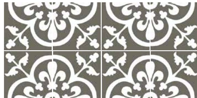
Pattern: 8 pieces