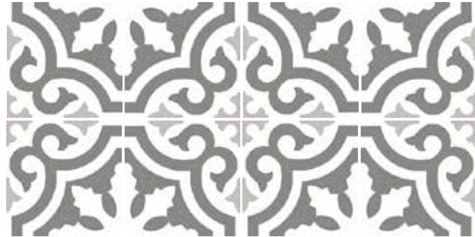
Pattern: 8 pieces