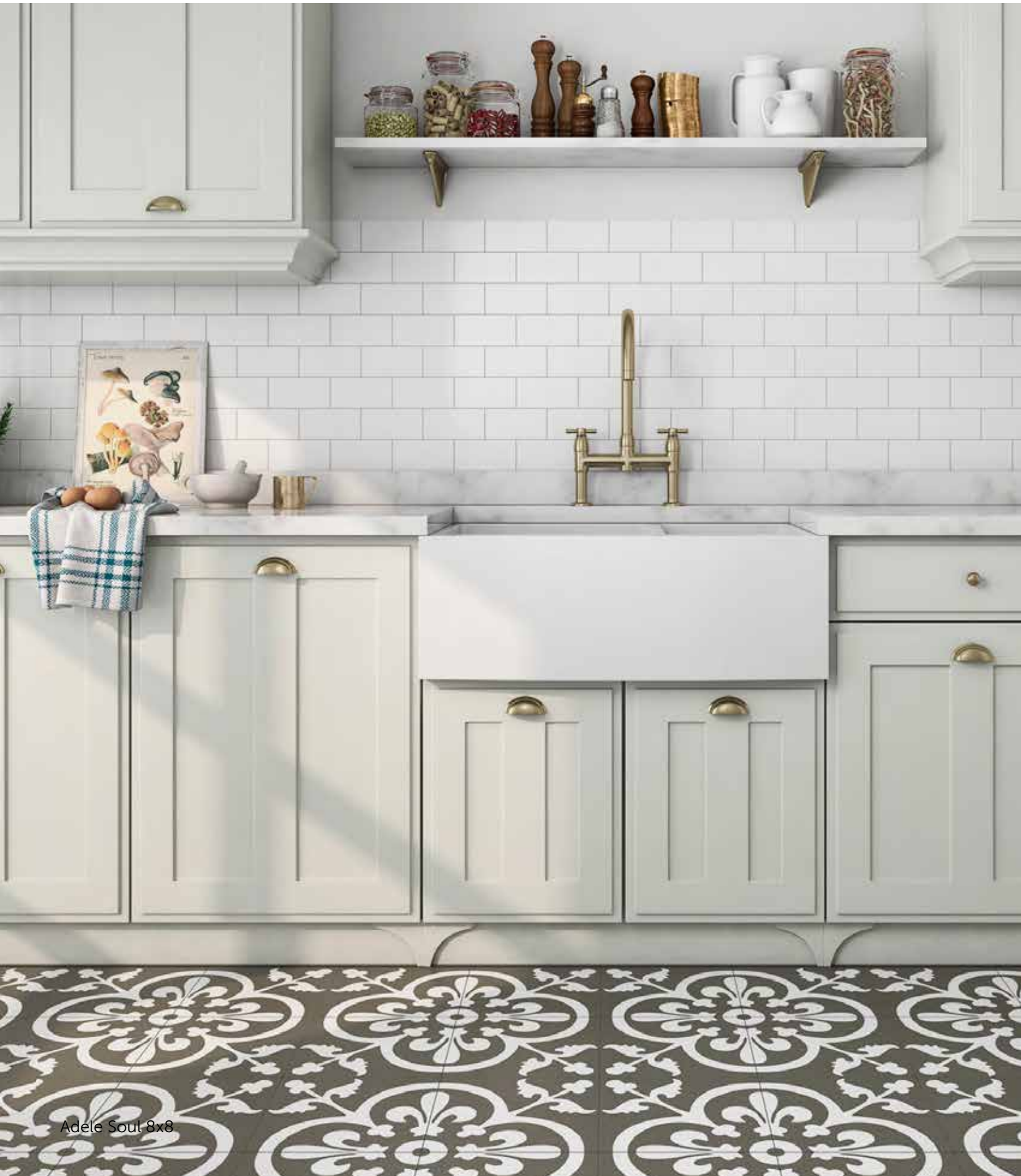
Adele Sout 8x8