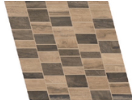
12"X12" BEIGE / BROWN DYAGO MOSAIC