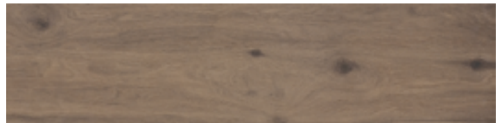
9x36 Brown Flax