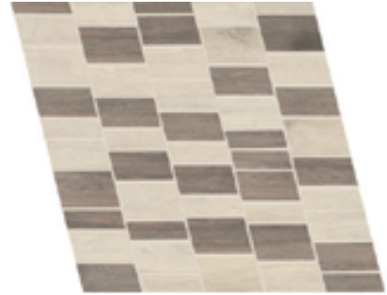
12"X12" WHITE/GREY DYAGO MOSAIC