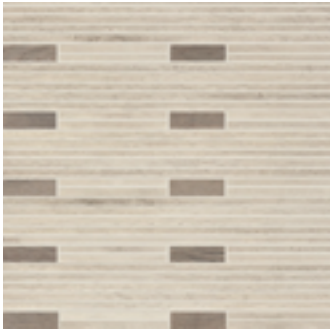
12"X12" WHITE/GREY TALK MOSAIC