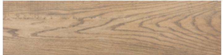
9x36 Beige Digue