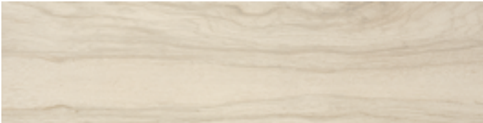
9x36 White Smoke