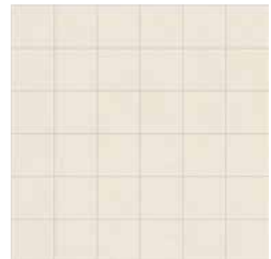
2x2 Mosaic AVAILABLE IN ALL COLORS