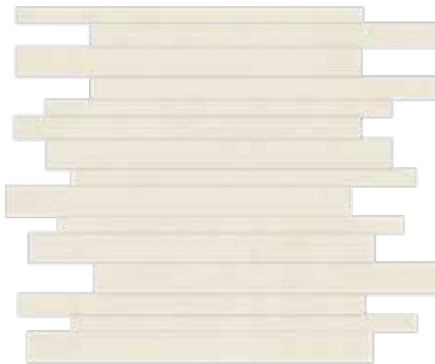
11x14 Random Linear Mosaic AVAILABLE IN ALL COLORS