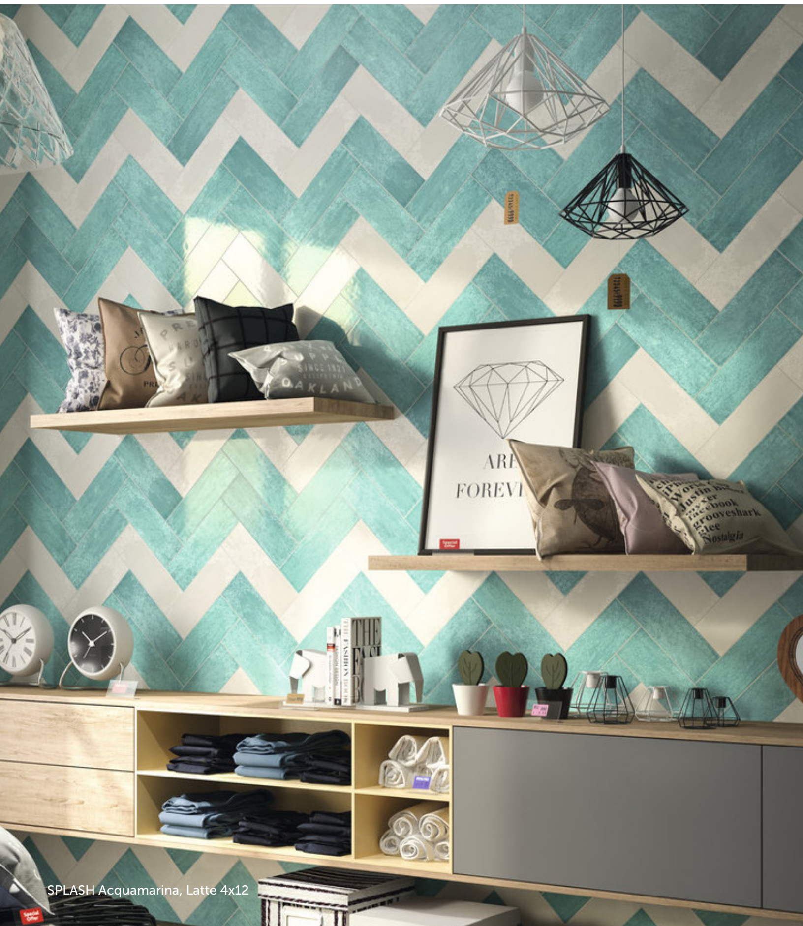
SPLASH Acquamarina, Latte 4x12