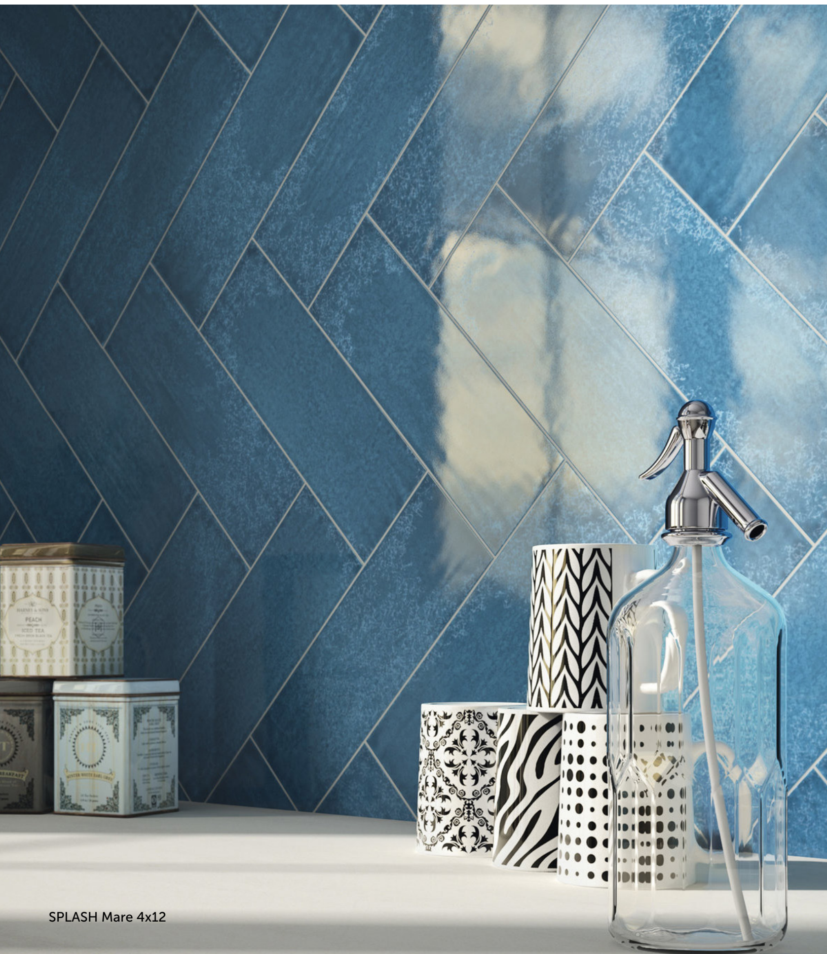
SPLASH Mare 4x12