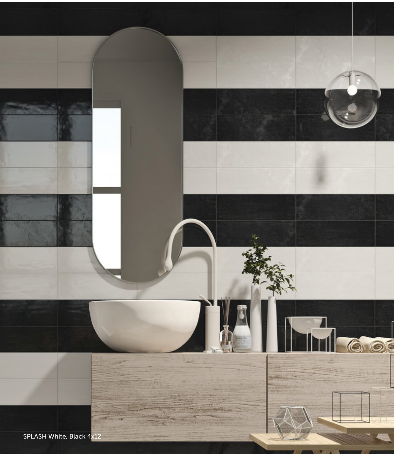
SPLASH White, Black 4x12