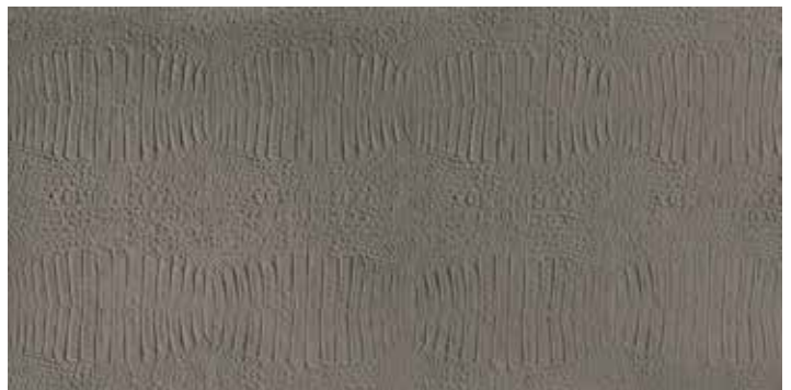
FANGO - Cocco