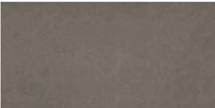
FANGO - Martellata