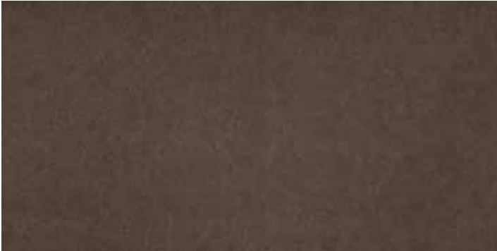
CUOIO - Martellata