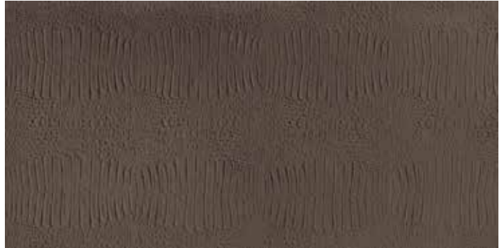
CUOIO - Cocco