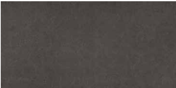
NERO - Martellata