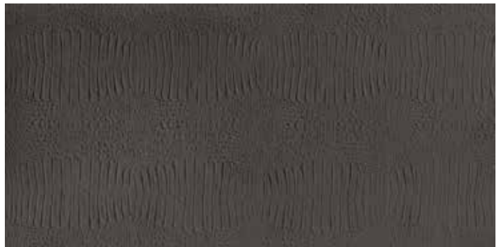
NERO - Cocco