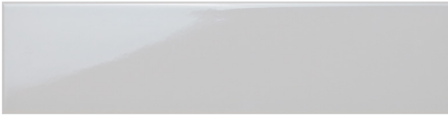
4x16 Grey Glossy*