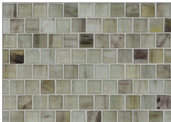
Light Walnut Silk