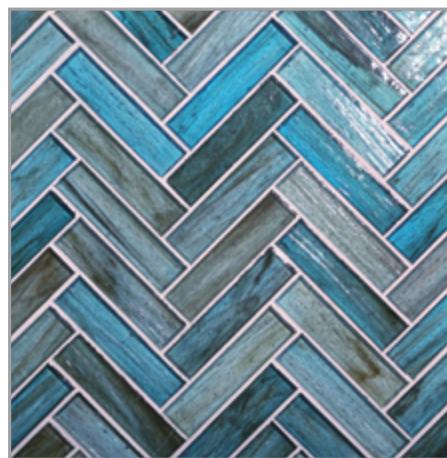
1 x 4 Herringbone