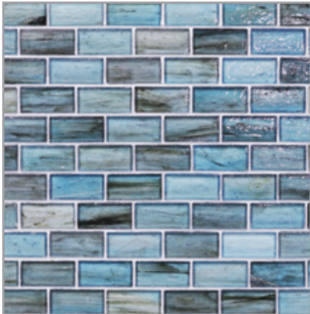
1 x 2 Brick