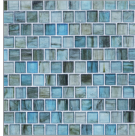
1 x 1 Offset