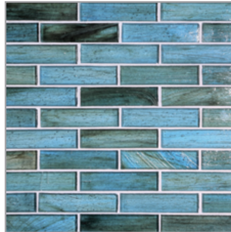
1 x 4 Brick