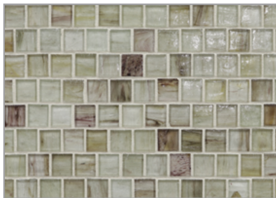
Light Walnut Natural