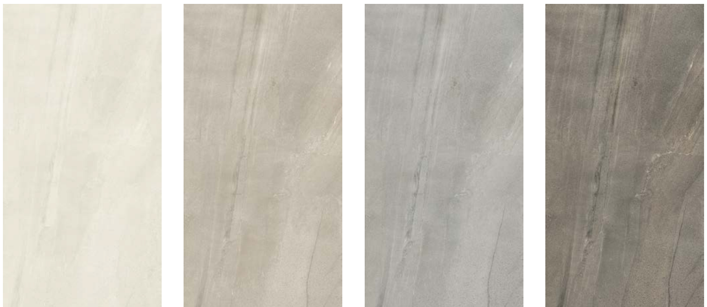
LAVICA PEARL FACE A*