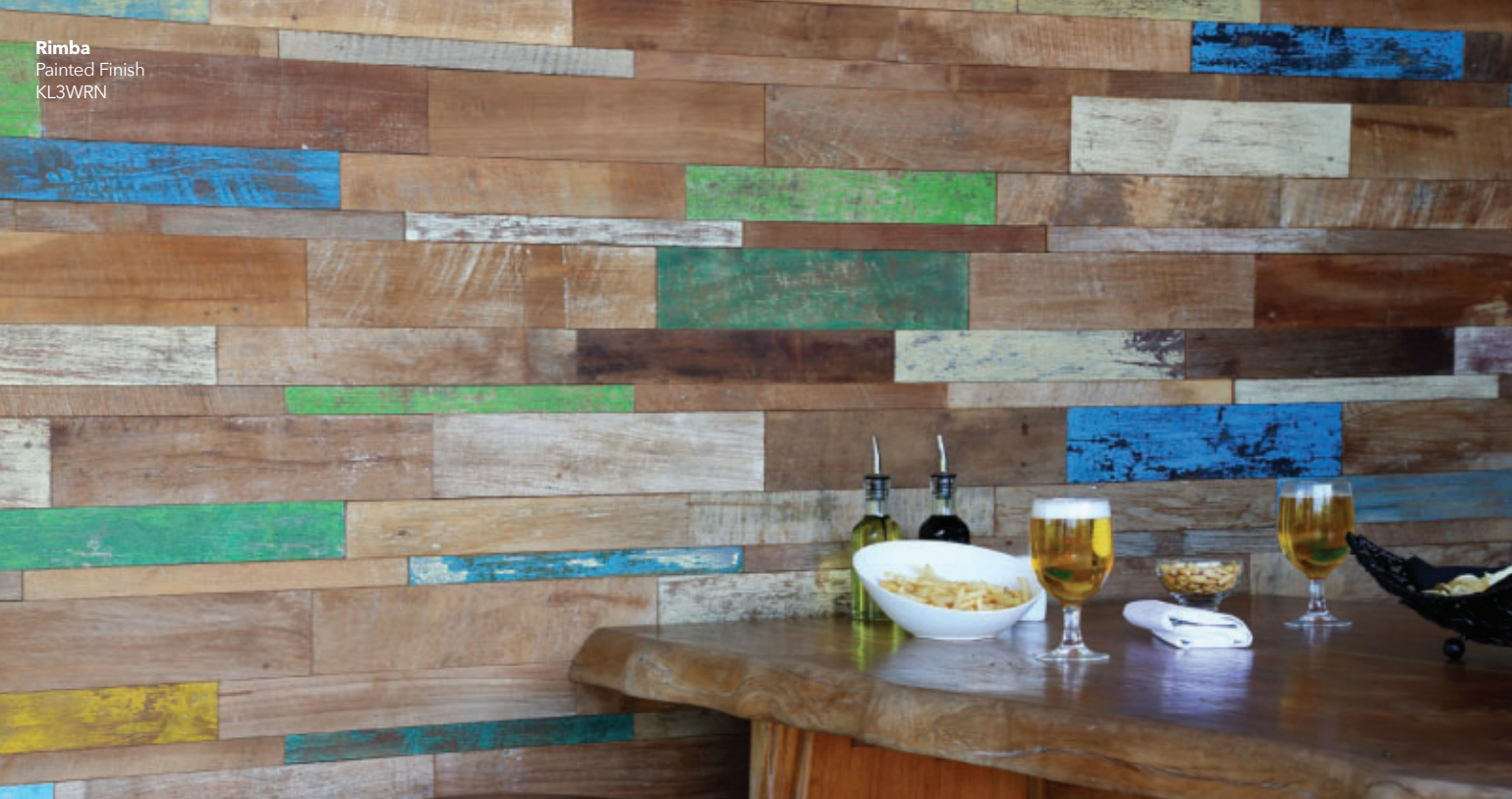
Rimba Painted Finish KL3WRN