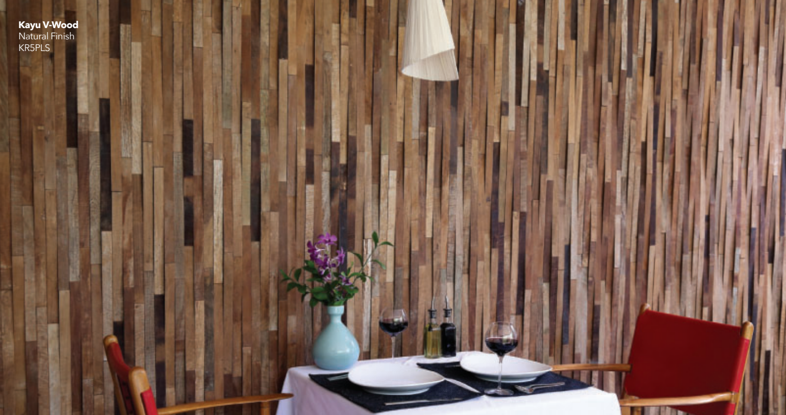
Kayu V-Wood Natural Finish KR5PLS