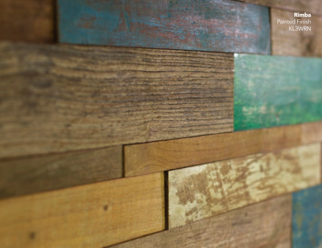
Rimba Painted Finish KL3WRN