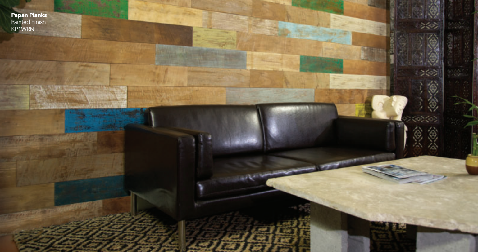
Papan Planks Painted Finish KP1WRN