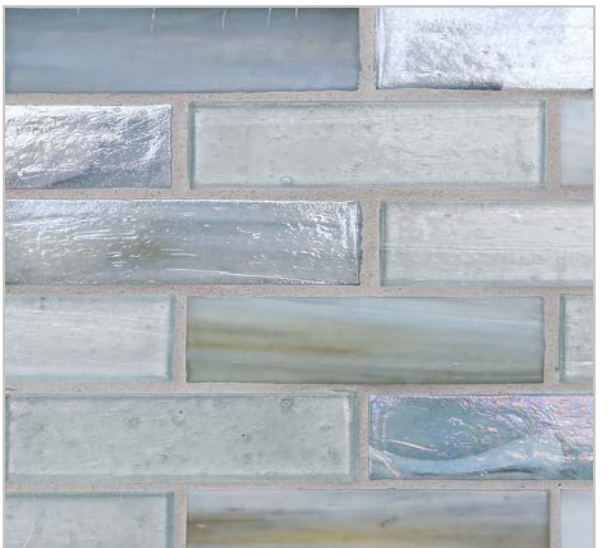
1 x 4 BRICK (25mm x 100mm)