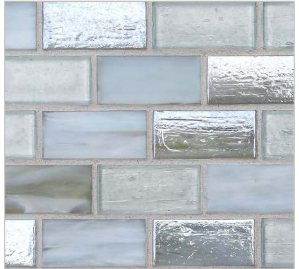
1 x 2 BRICK (25mm x 50mm)