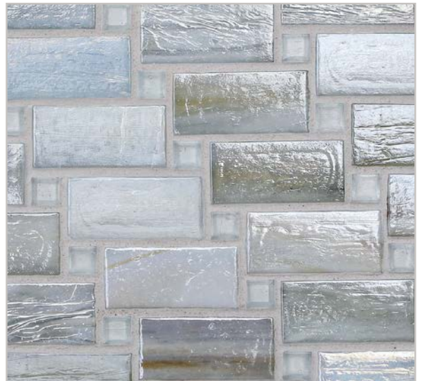
VINEYARD ( \frac{1}{2} x \frac{1}{2} , 1 x 2) (11.5mm x 11.5mm, 25mm x 50mm)