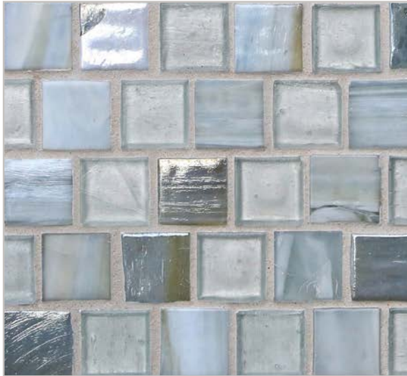
1 x 1 OFFSET (25mm x 25mm)