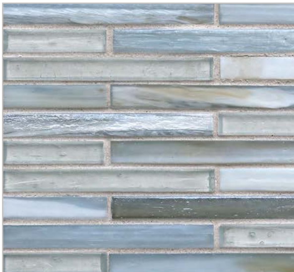
\frac{1}{2} x 4 BRICK (11.5mm x 100mm)