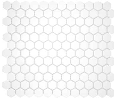
White Matte - 1x1 Hex Mosaic