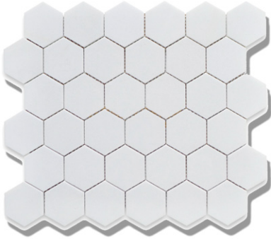
White Matte - 2x2 Hex Mosaic