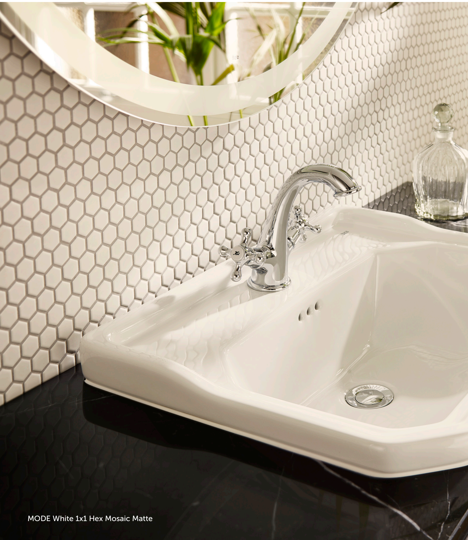
MODE White 1x1 Hex Mosaic Matte