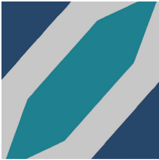
Woollahra Opal - 8x8