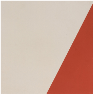
Narrabeen Reef Clay - 8x8