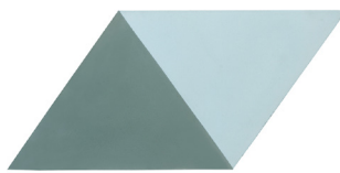
Neenish River Mint