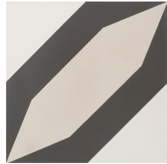
Woollahra Pepperberry - 8x8