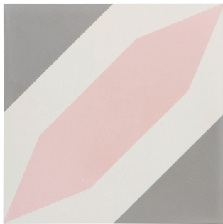
Woollahra Lilly Pilly - 8x8