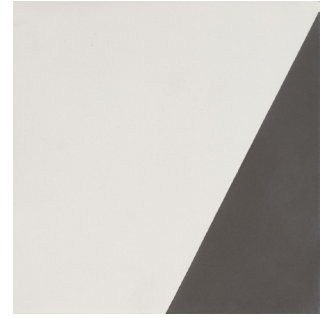
Narrabeen Pepperberry - 8x8