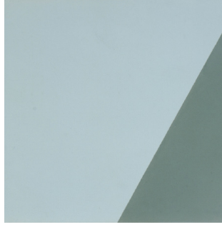
Narrabeen River Mint - 8x8