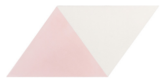
Neenish Lilly Pilly