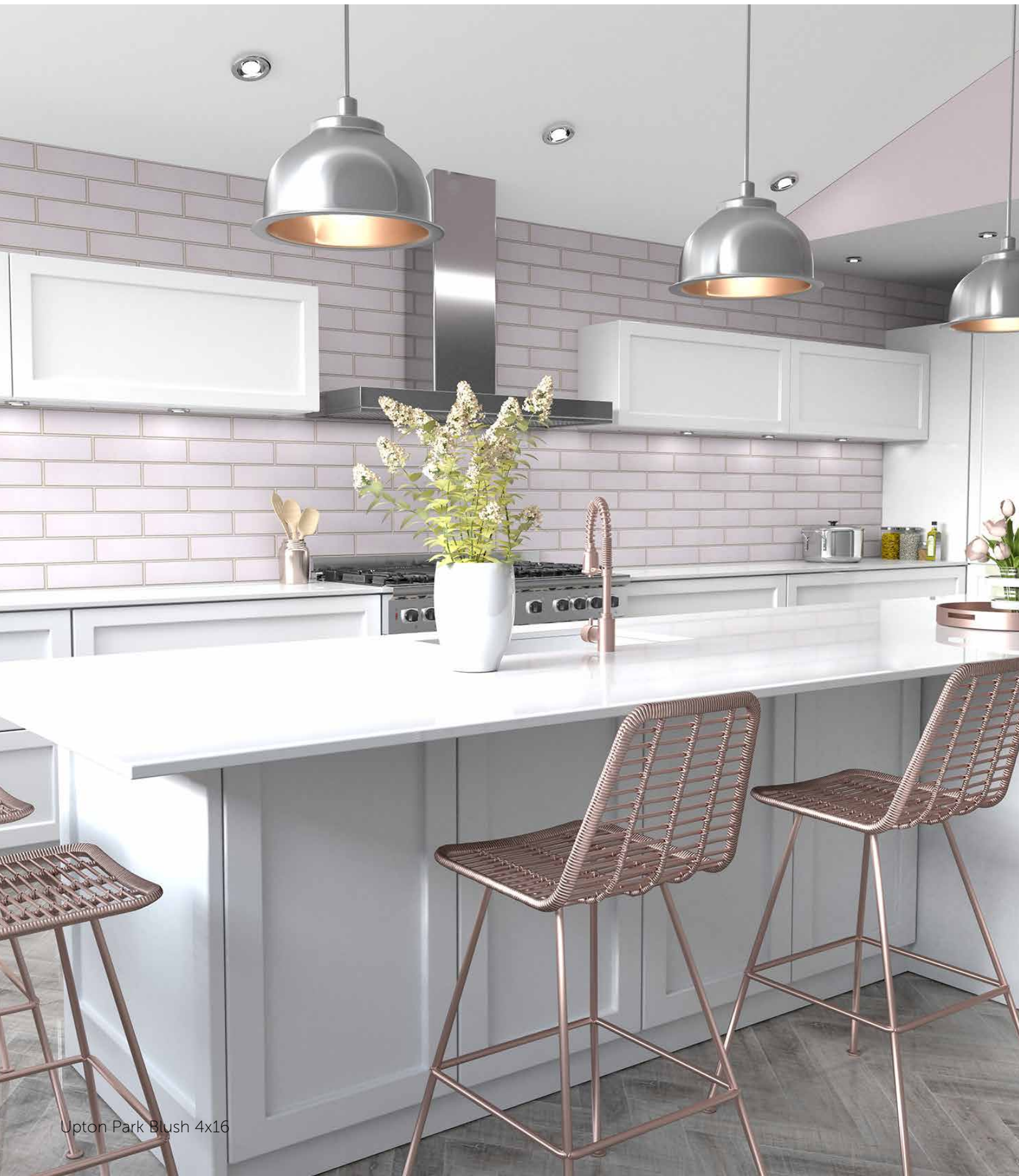
Upton Park Blush 4x16