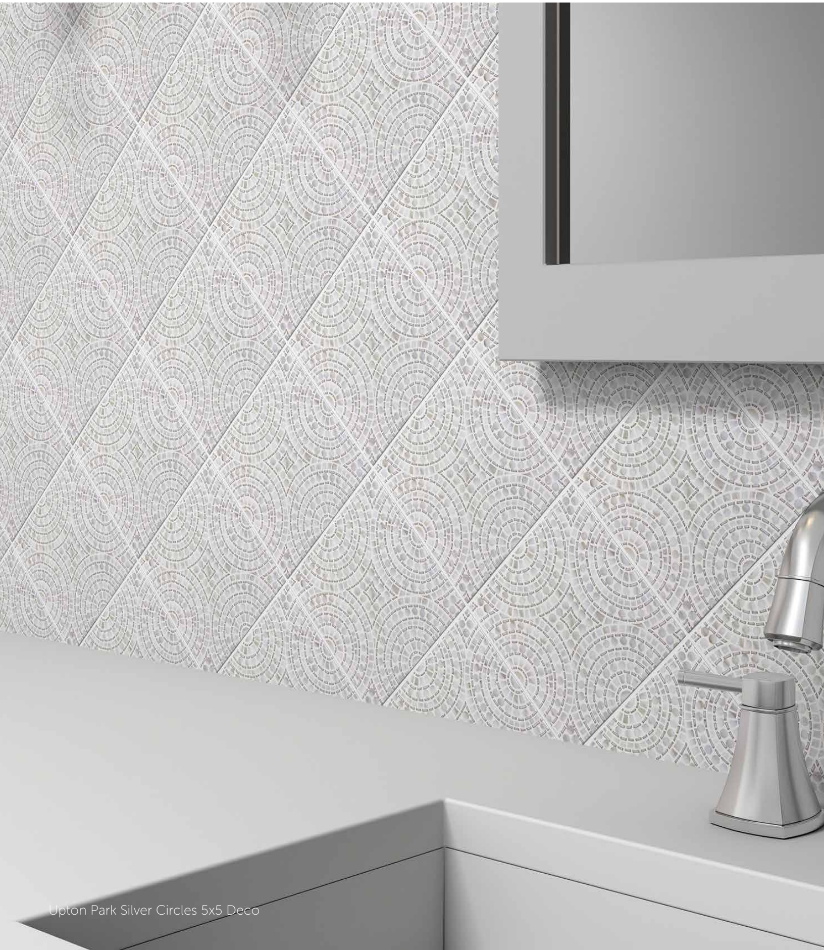
Upton Park Silver Circles 5x5 Deco