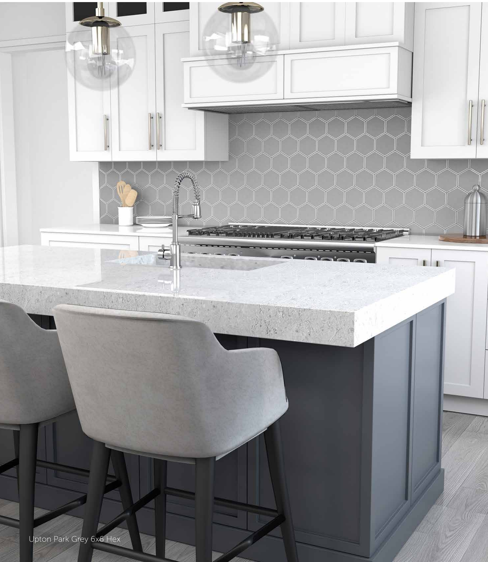
Upton Park Grey 6x6 Hex