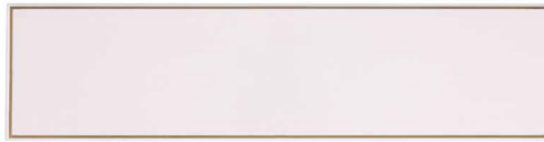
Blush - 4x16