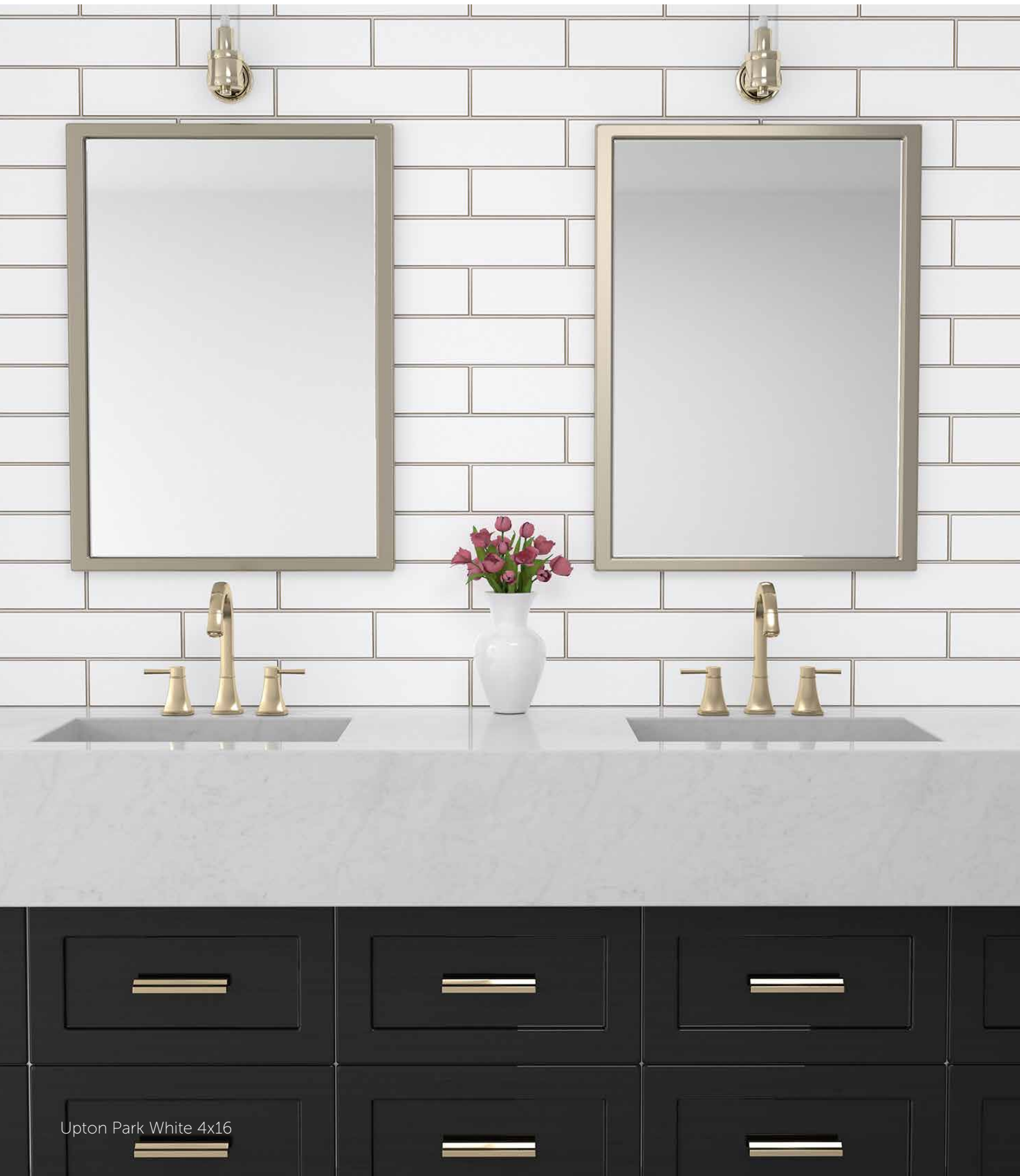
Upton Park White 4x16