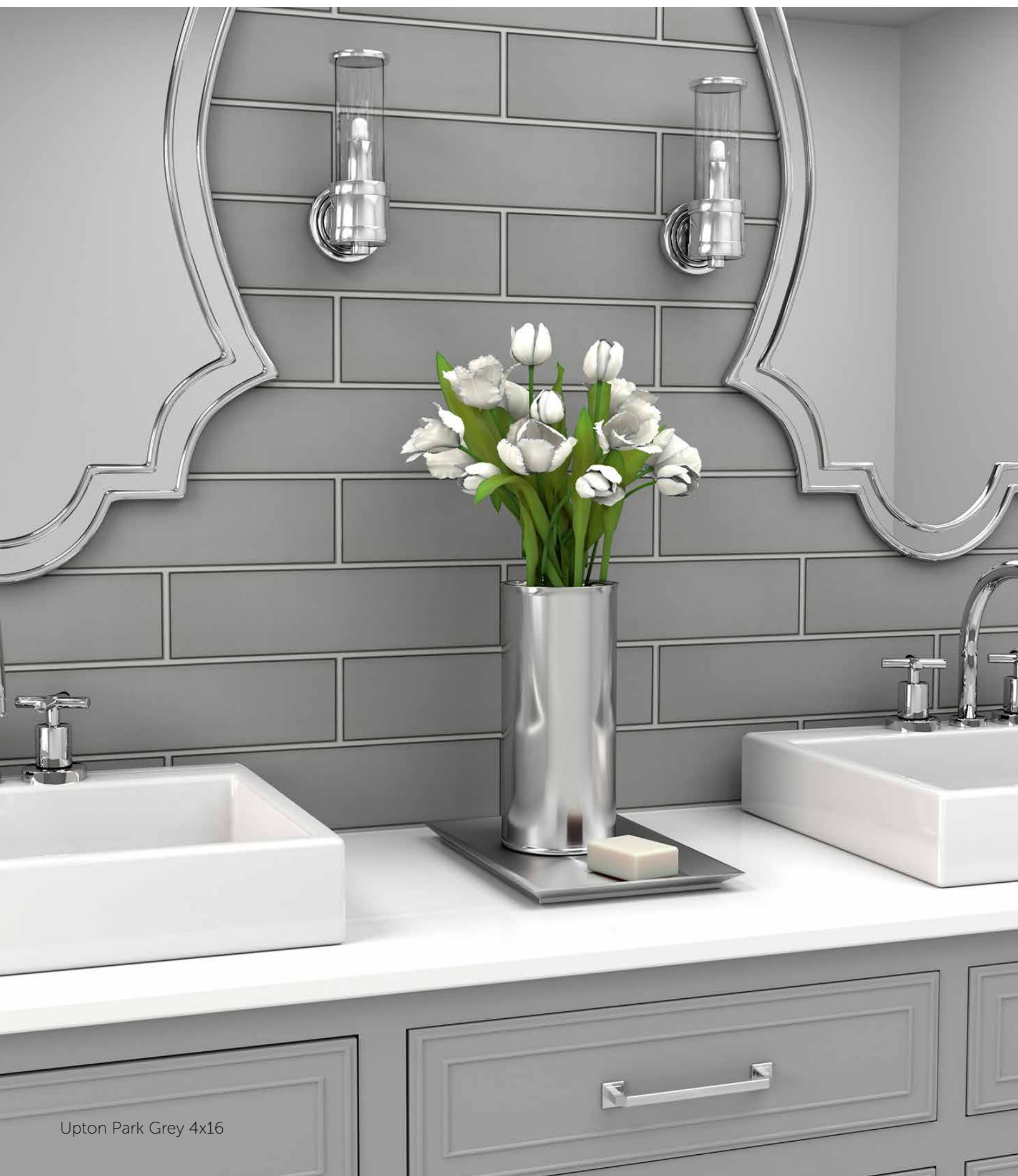
Upton Park Grey 4x16