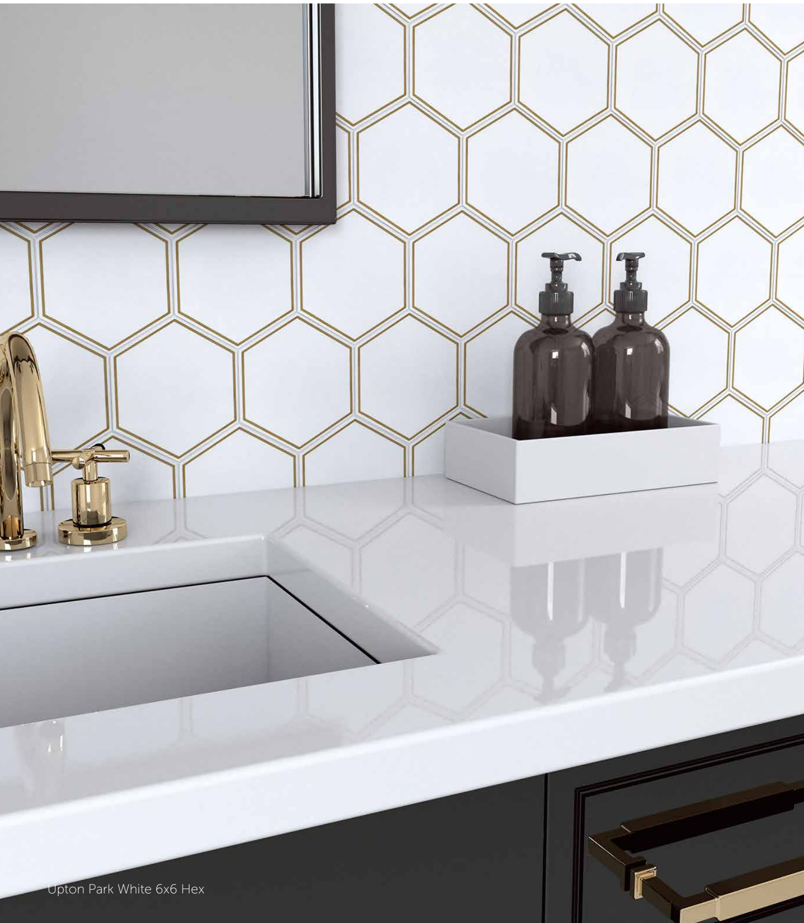
Upton Park White 6x6 Hex