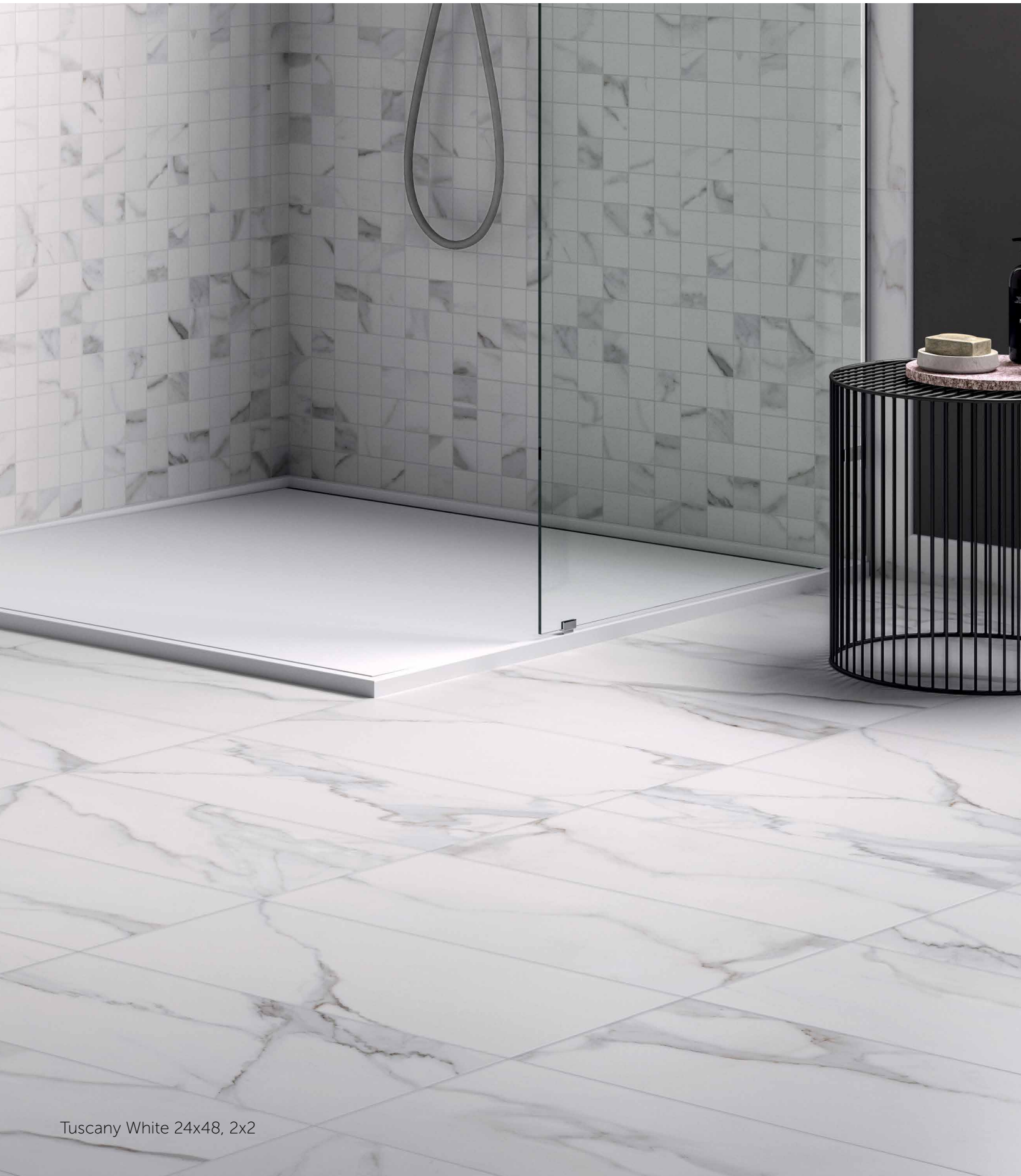
Tuscany White 24x48, 2x2