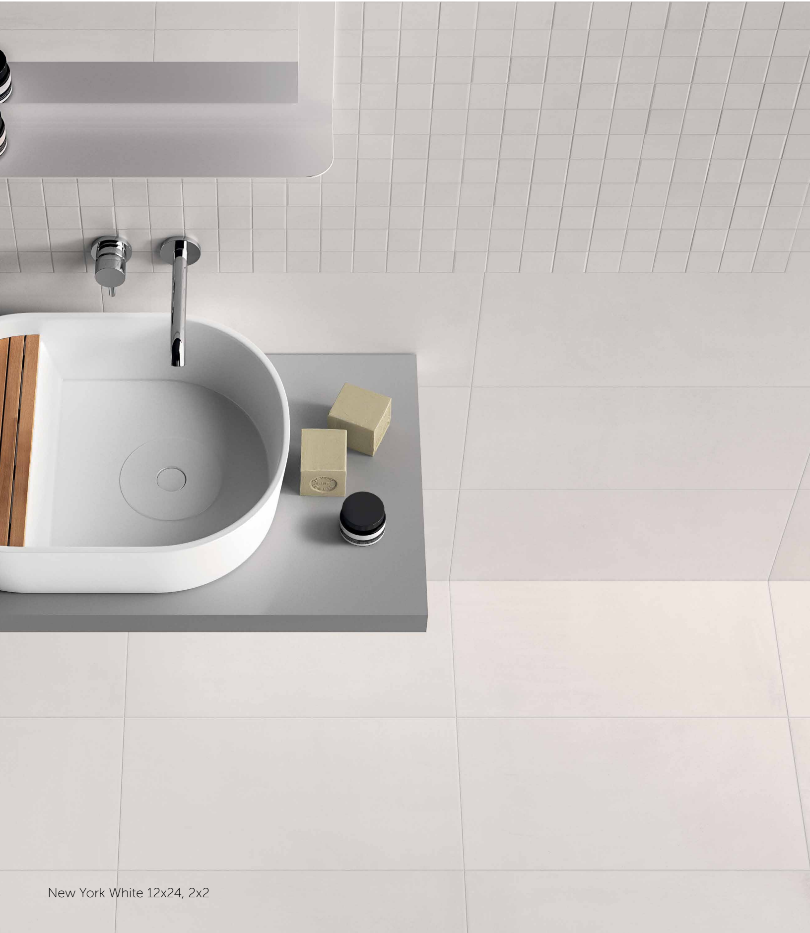
New York White 12x24, 2x2