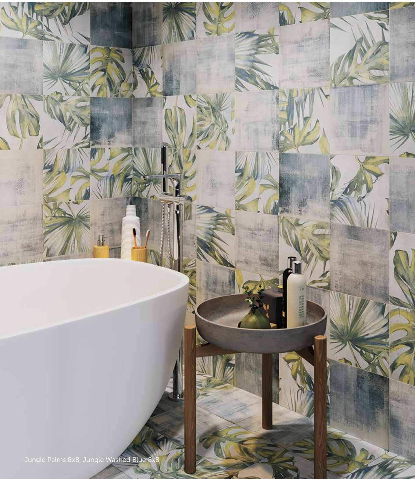
Jungle Palms 8x8, Jungle Washed Blue 8x8