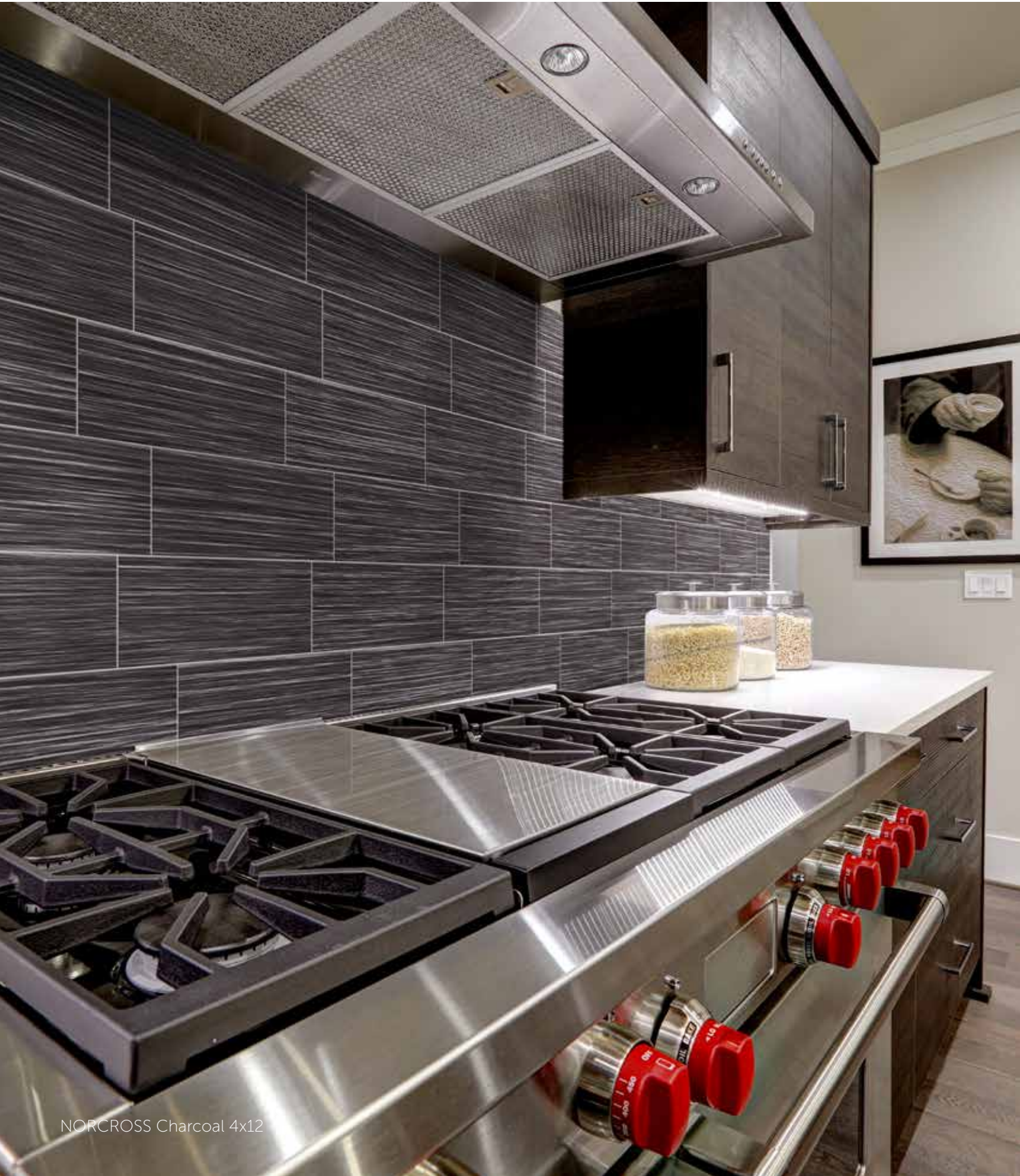
NORCROSS Charcoal 4x12