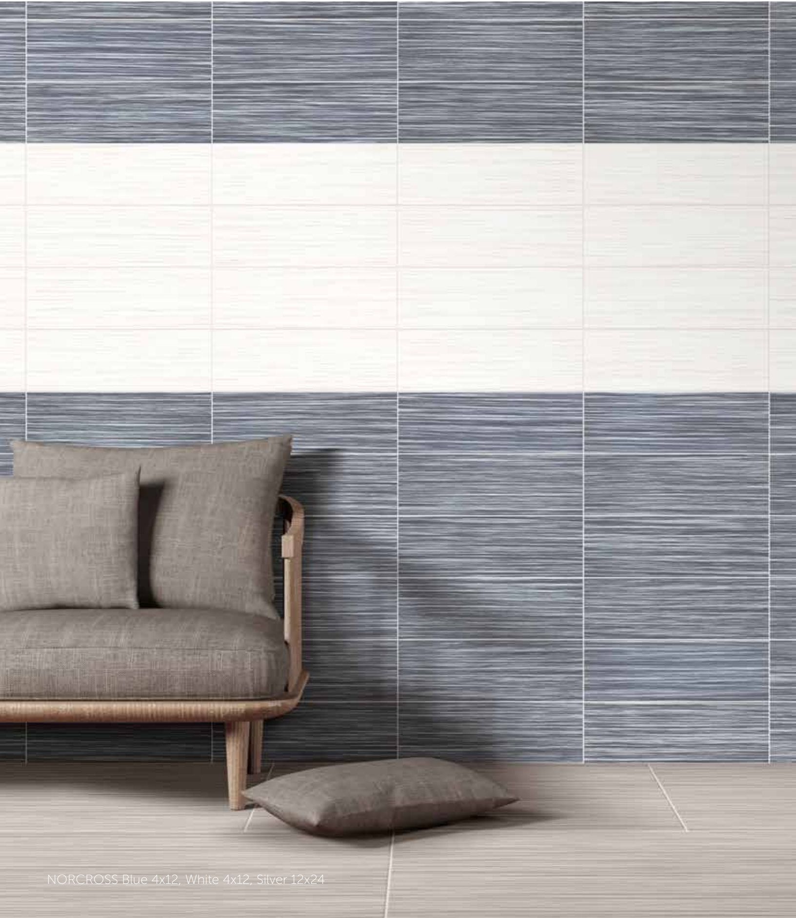
NORCROSS Blue 4x12, White 4x12, Silver 12x24