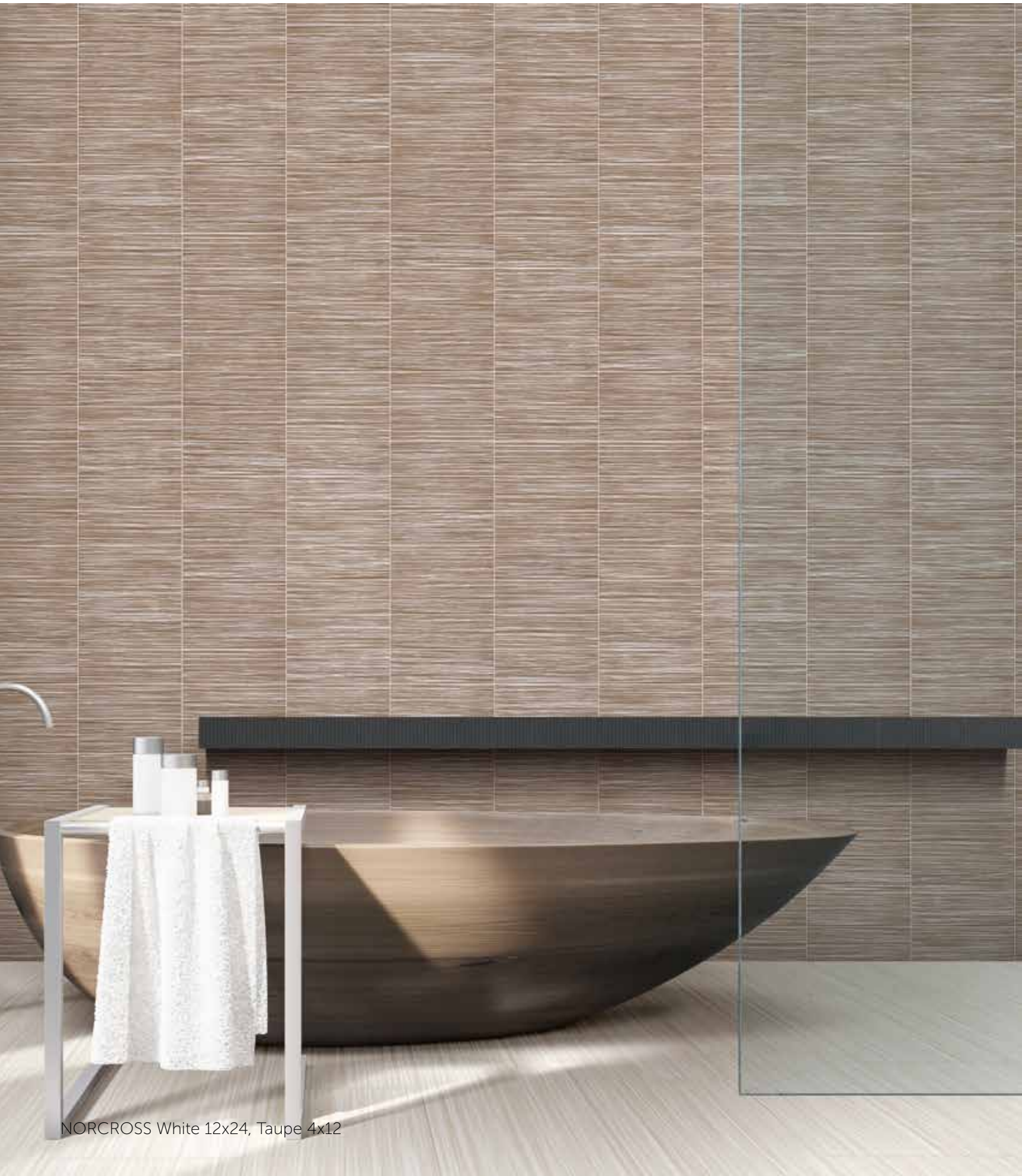
NORCROSS White 12x24, Taupe 4x12