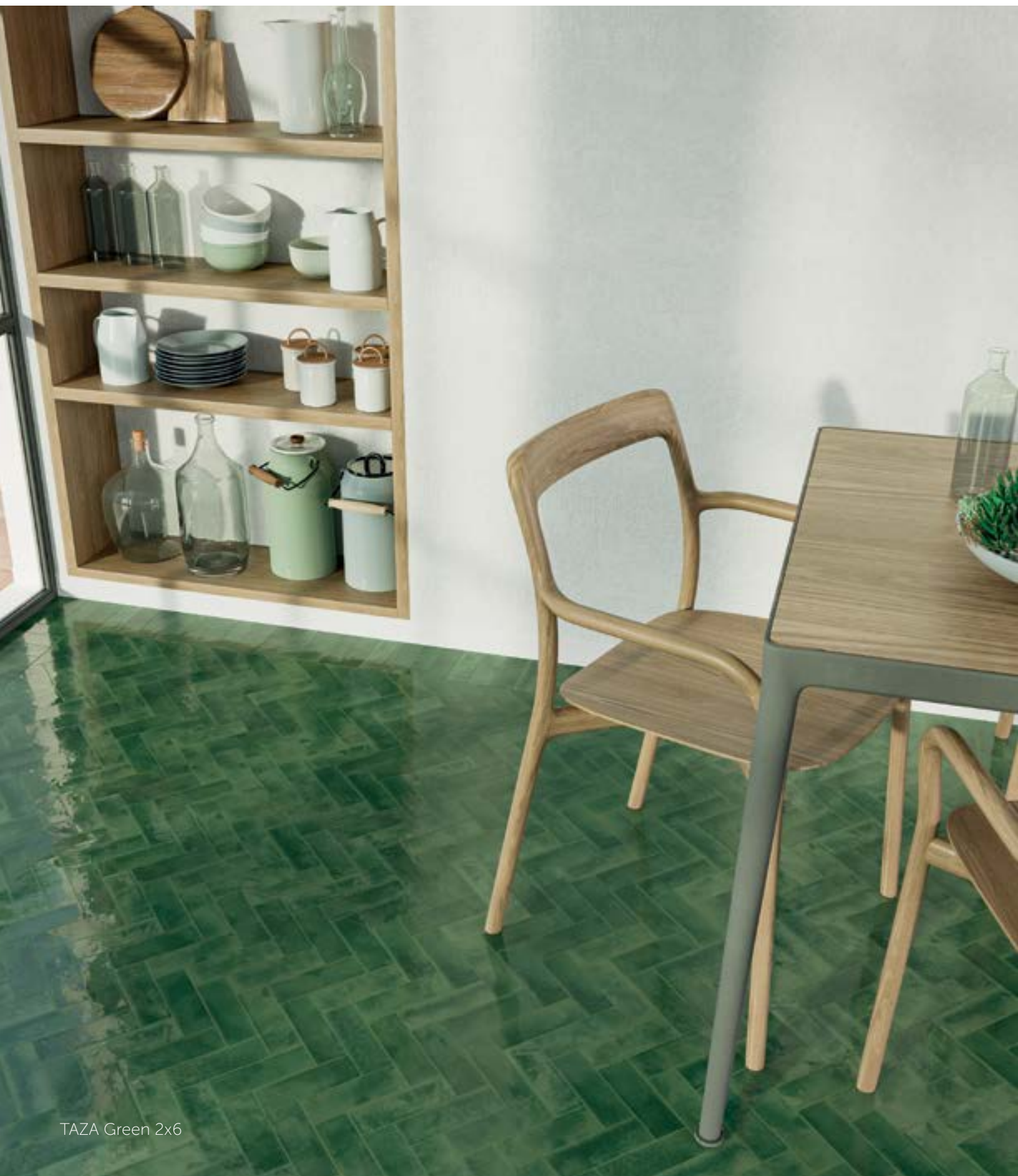
TAZA Green 2x6