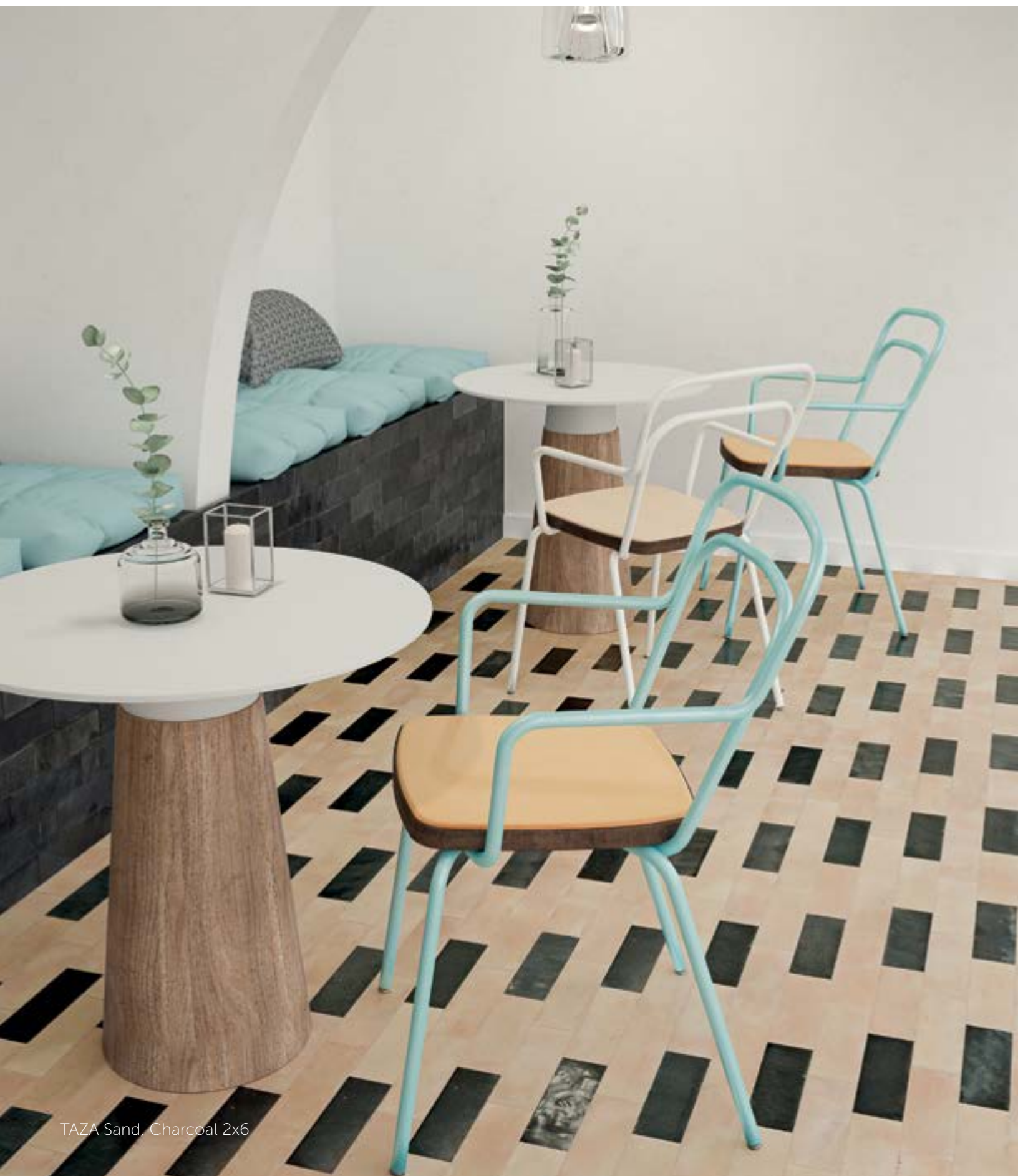
TAZA Sand, Charcoal 2x6