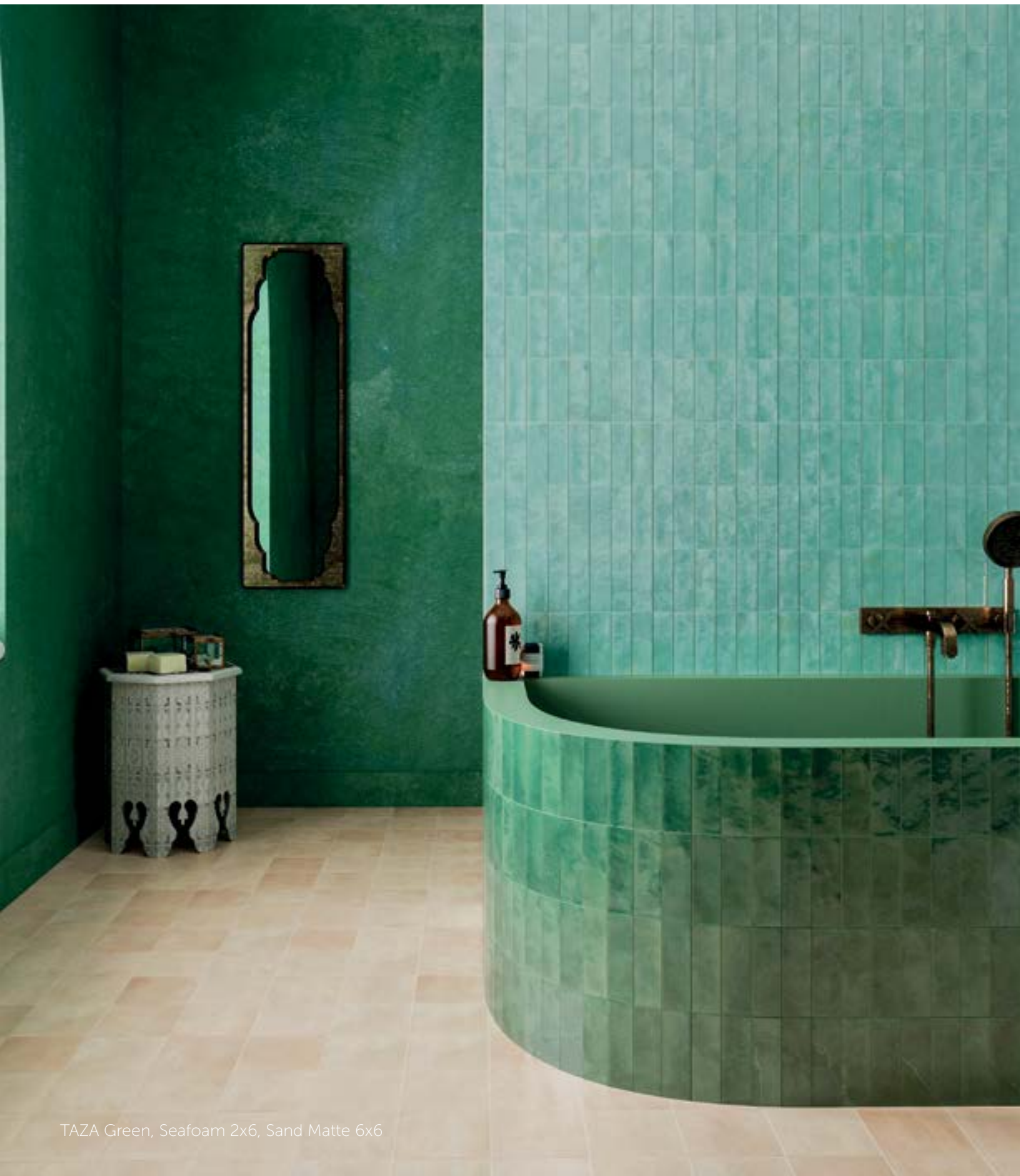
TAZA Green, Seafoam 2x6, Sand Matte 6x6