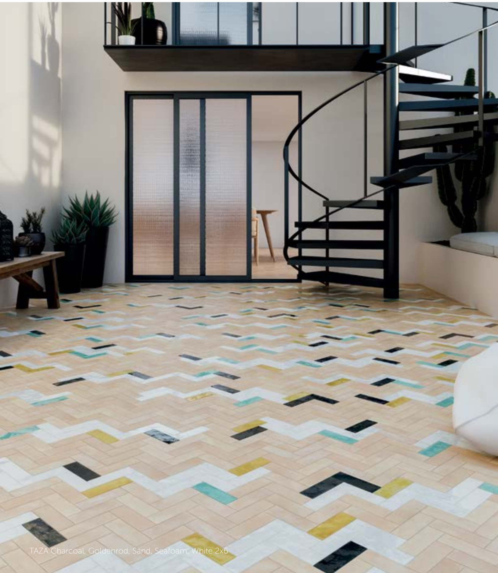
TAZA Charcoal, Goldenrod, Sand, Seafoam, White 2x6