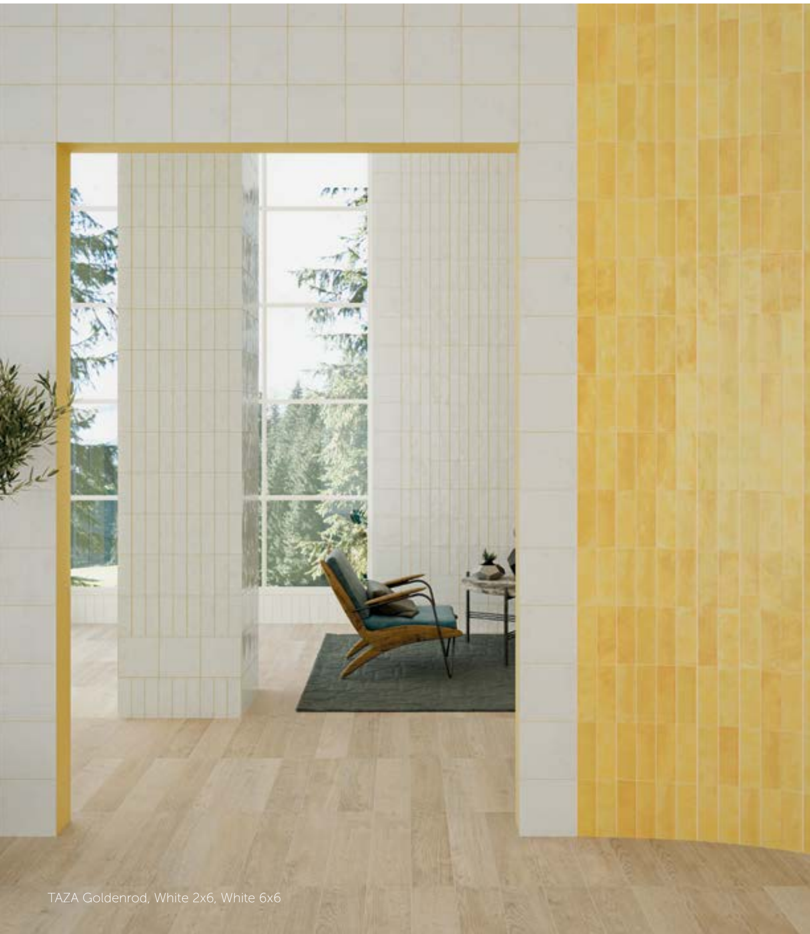
TAZA Goldenrod, White 2x6, White 6x6