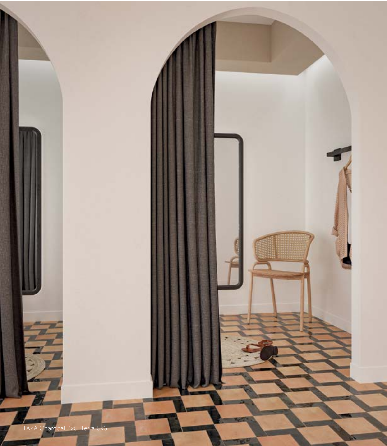
TAZA Charcoal 2x6, Terra 6x6