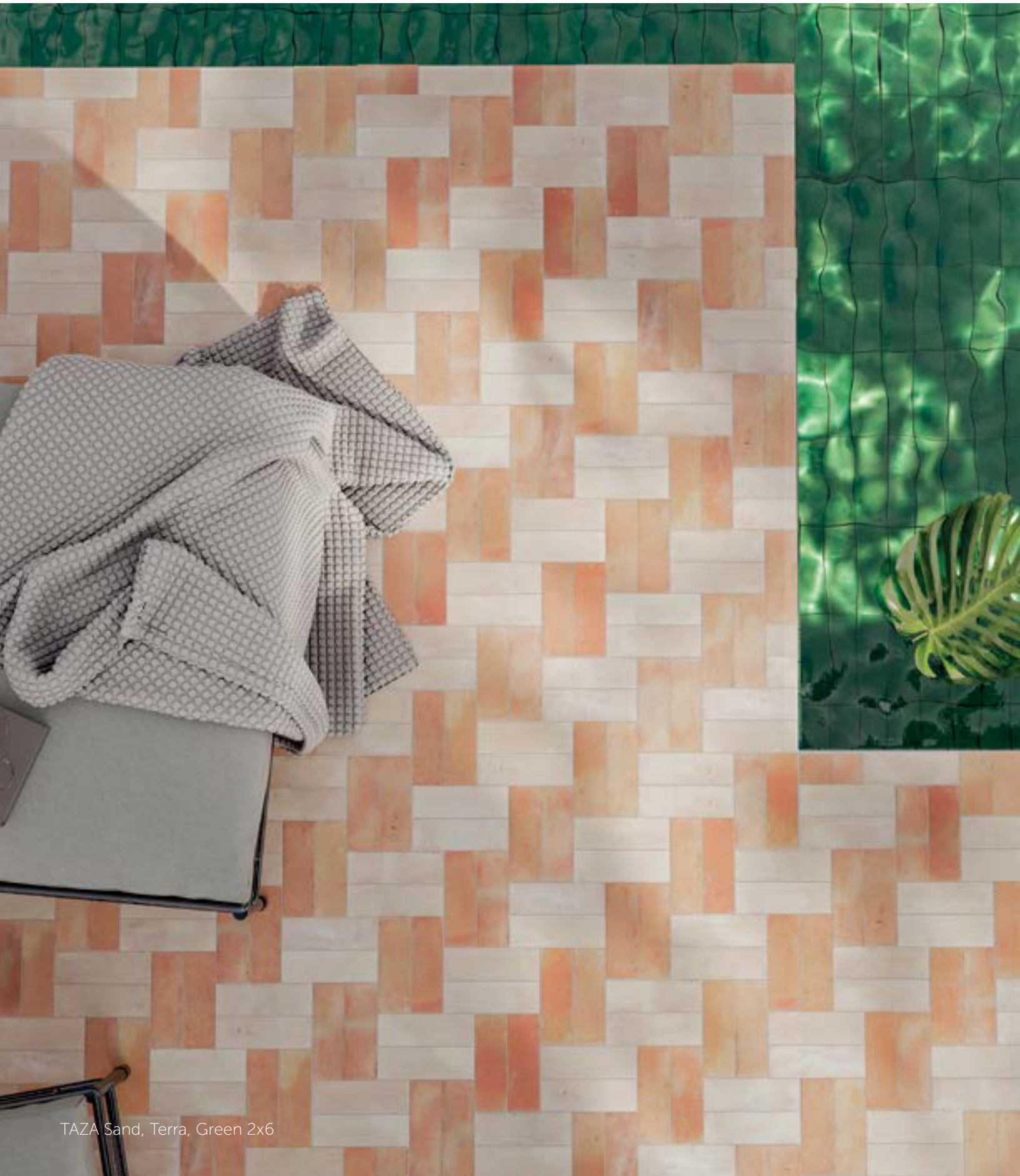
TAZA Sand, Terra, Green 2x6