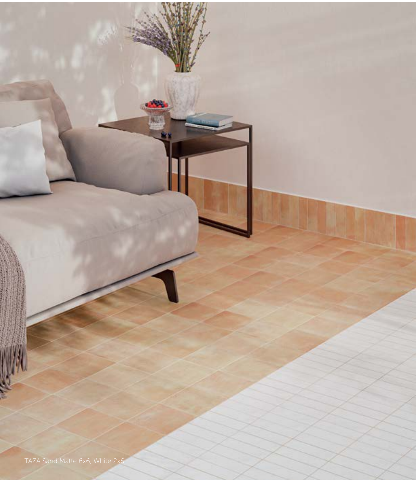
TAZA Sand Matte 6x6, White 2x6