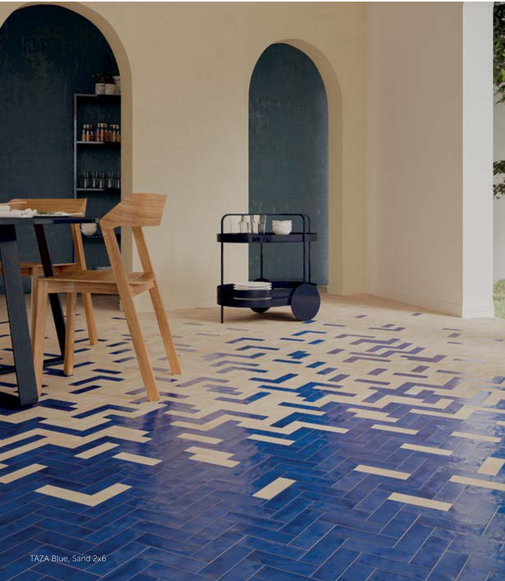
TAZA Blue, Sand 2x6