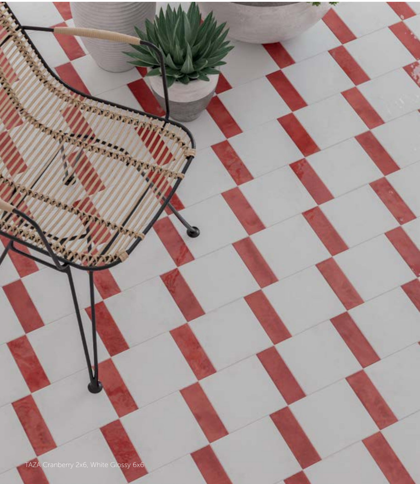
TAZA Cranberry 2x6, White Glossy 6x6