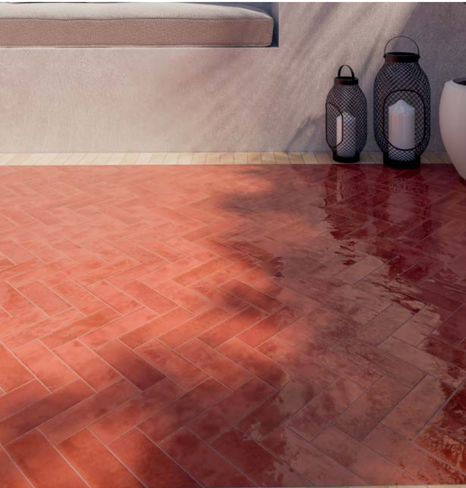
TAZA Cranberry, Sand 2x6