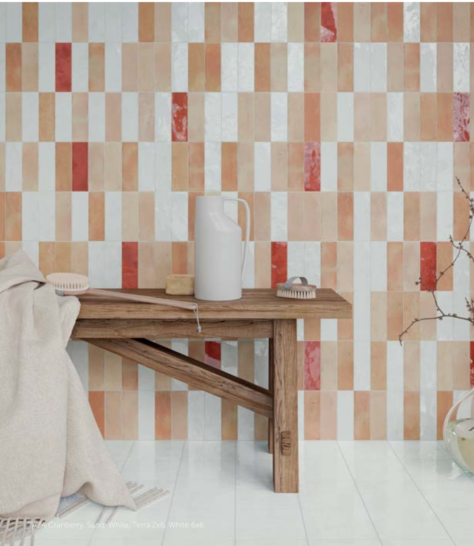
TAZA Cranberry, Sand, White, Terra 2x6, White 6x6