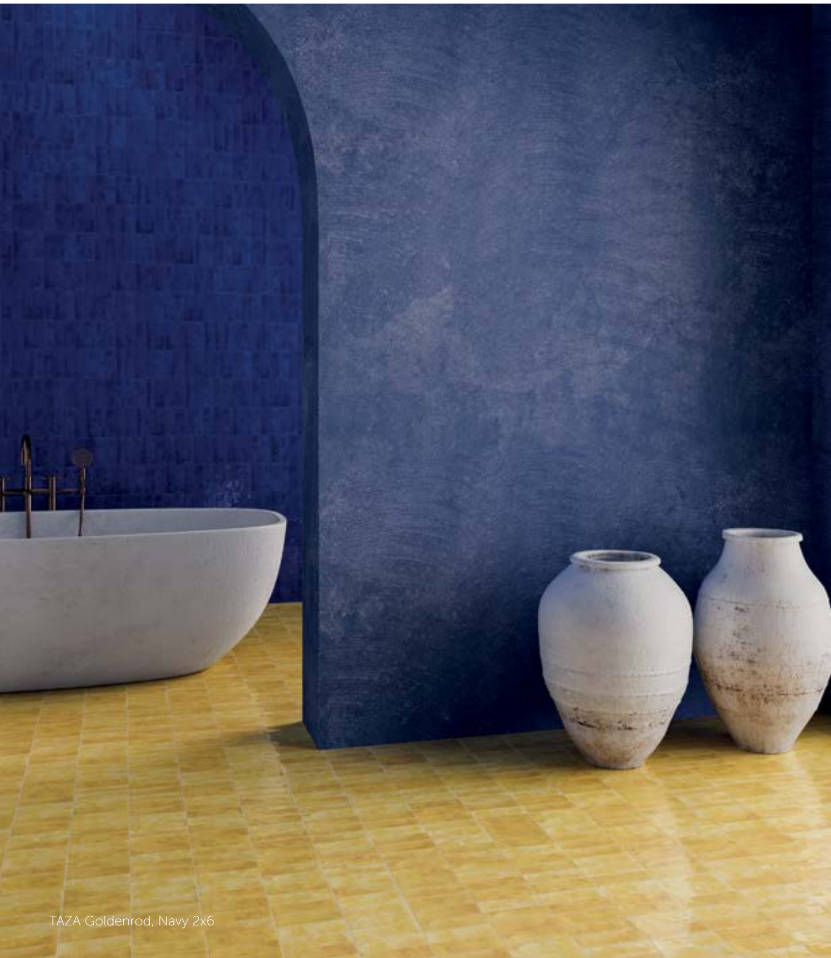
TAZA Goldenrod, Navy 2x6