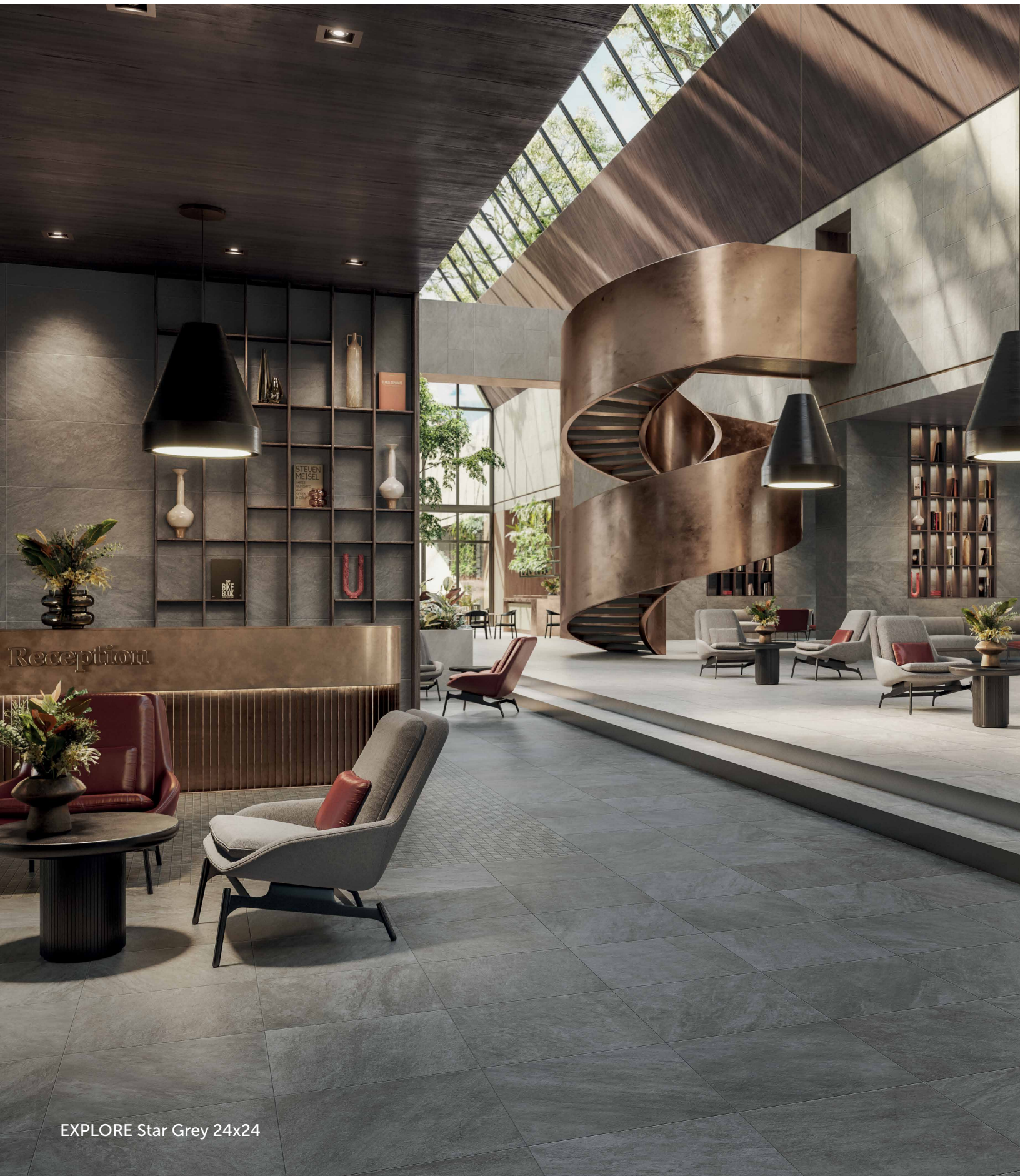
EXPLORE Star Grey 24x24