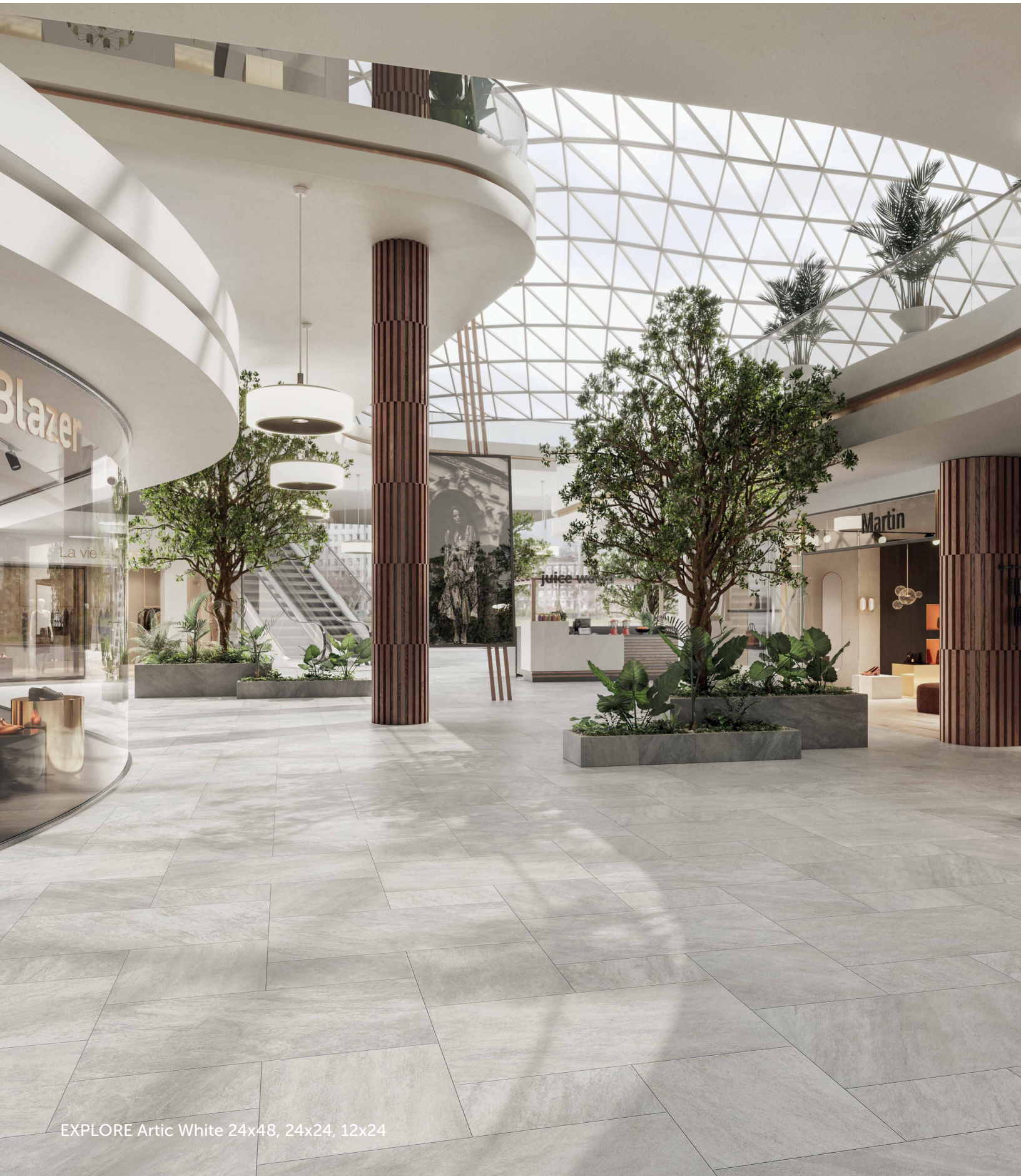
EXPLORE Artic White 24x48, 24x24, 12x24