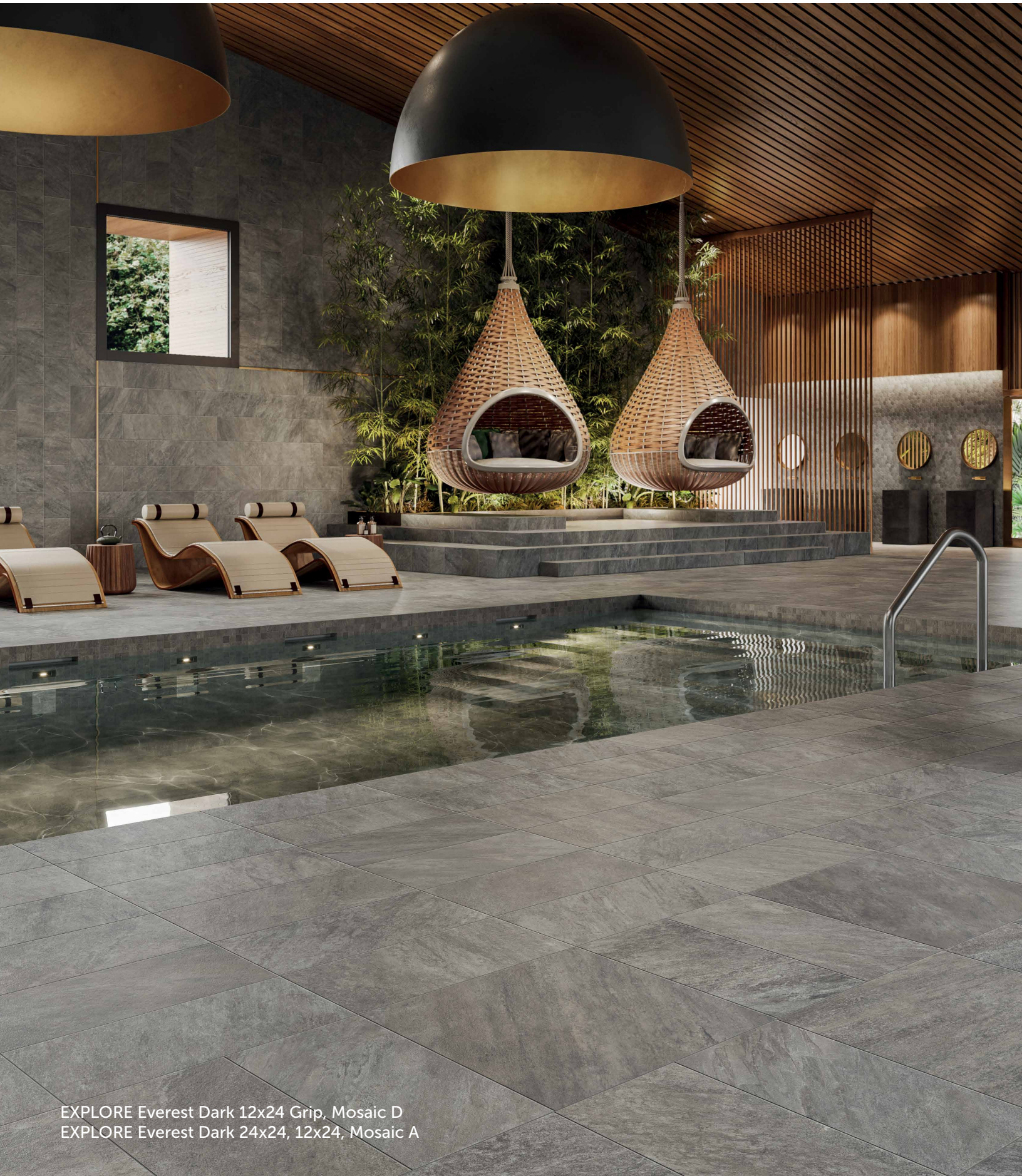
EXPLORE Everest Dark 12x24 Grip, Mosaic D EXPLORE Everest Dark 24x24, 12x24, Mosaic A