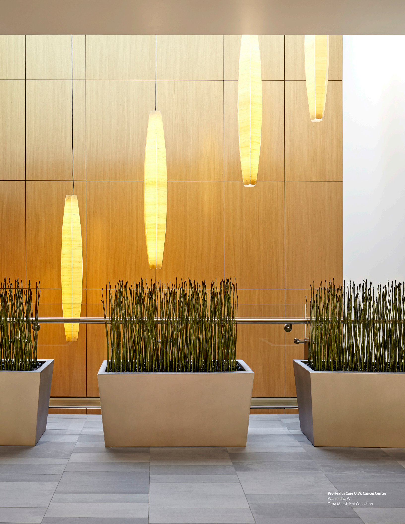
ProHealth Care U.W. Cancer Center Waukesha, WI Terra Maastricht Collection

For more project inspiration visit mosa.com/healthcare