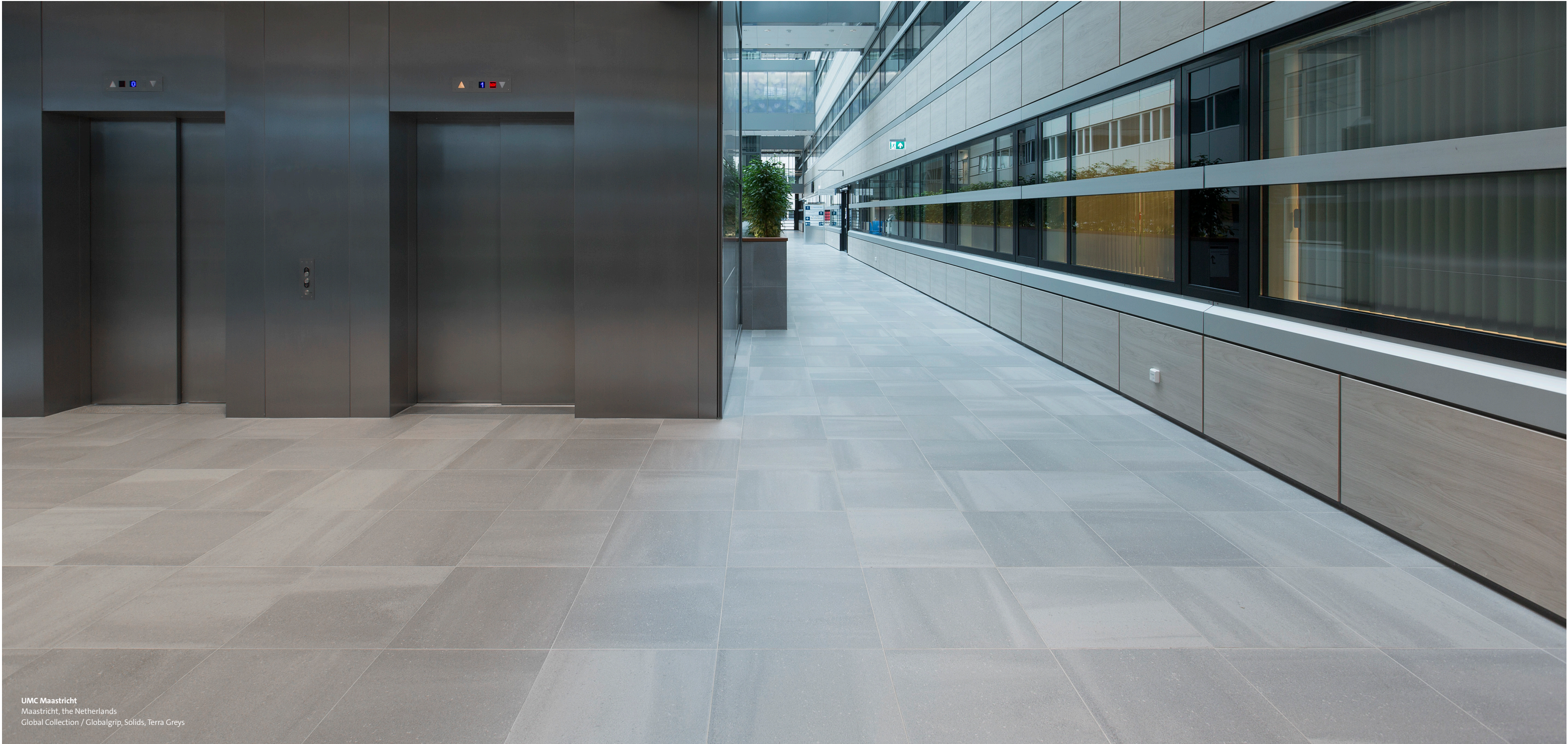
UMC Maastricht Maastricht, the Netherlands Global Collection / Globalgrip, Solids, Terra Greys