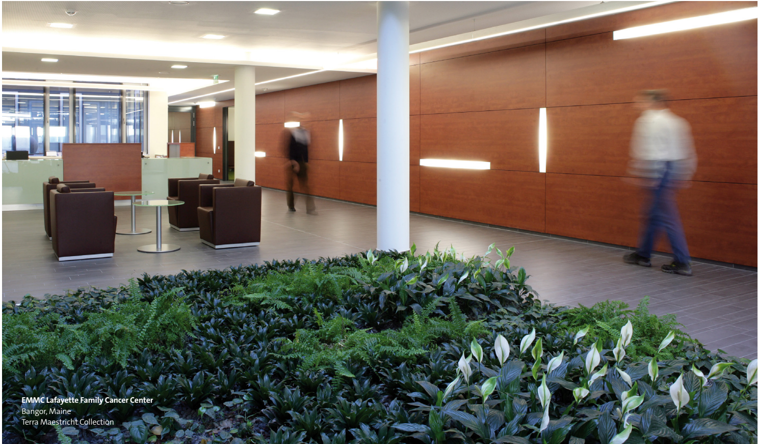
EMMC Lafayette Family Cancer Center Bangor, Maine Terra Maestricht Collection