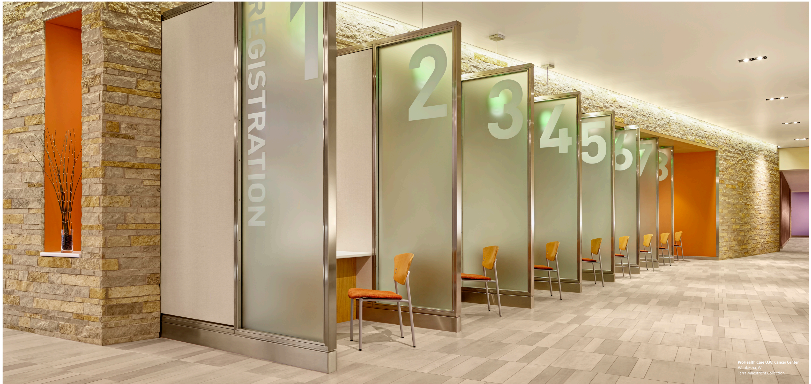
ProHealth Care U.W. Cancer Center Waukesha, WI Terra Maestricht Collection