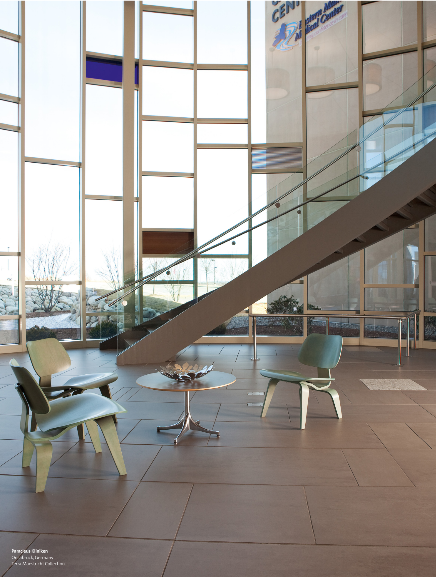
Paracelsus Kliniken Onsabrück, Germany Terra Maestricht Collection