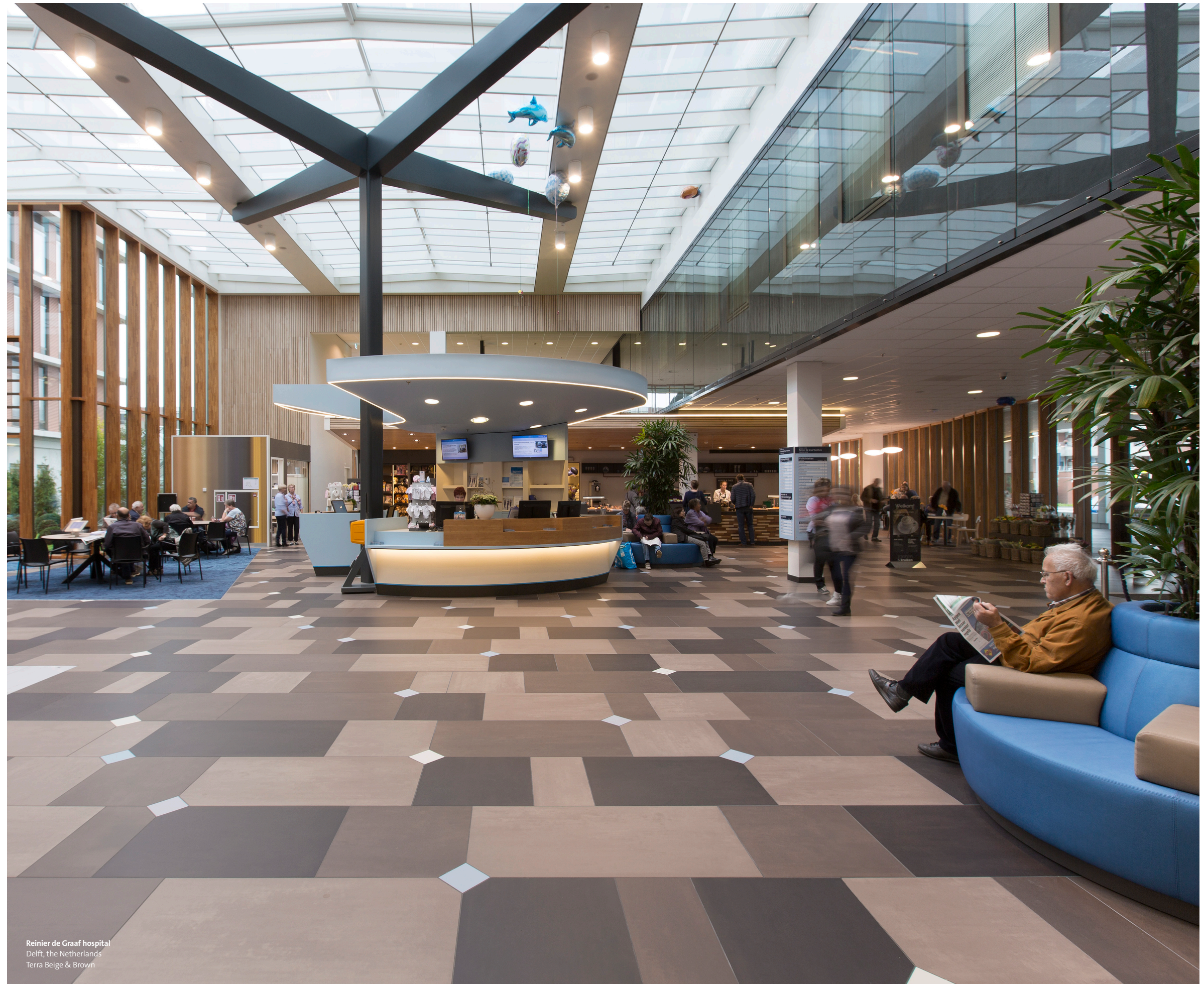
Reinier de Graaf hospital Delft, the Netherlands Terra Beige & Brown

There are few places in the world where design can impact quality of life more than in a healthcare environment. This is particularly true in facilities for long term care, chronic conditions, and ongoing outpatient care. Patients and caregivers alike are literally a captive audience for your designs, which can relieve stress, delight and soothe people. Mosa is proud to provide versatile, beautiful materials so design pros can keep creating interiors that are relaxing, energizing, calming or whatever your goal is while using surfaces that truly make sense for healthcare providers. Mosa's team can help you create lighthearted designs using soothing, organic color palettes, zingy brights or clean, calming whites and cool greys. The Mosa online pattern generator is a font of inspiration and innovation in design for walls, floors and more.