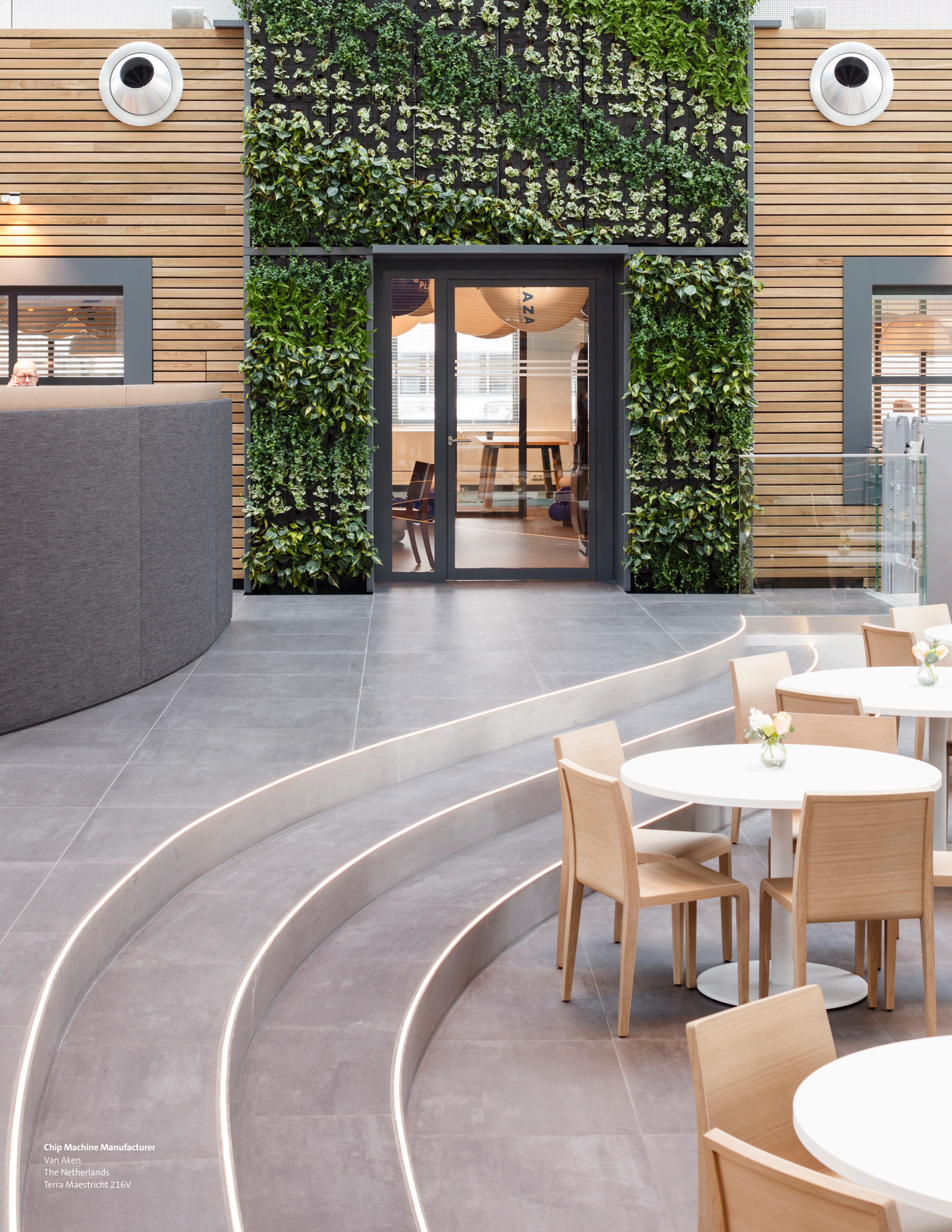
Chip Machine Manufacturer Van Aken The Netherlands Terra Maastricht 216V