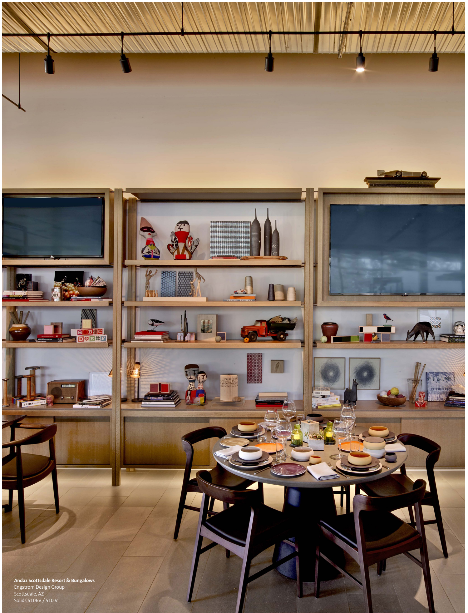
Andaz Scottsdale Resort & Bungalows Engstrom Design Group Scottsdale, AZ Solids 5106V / 510 V