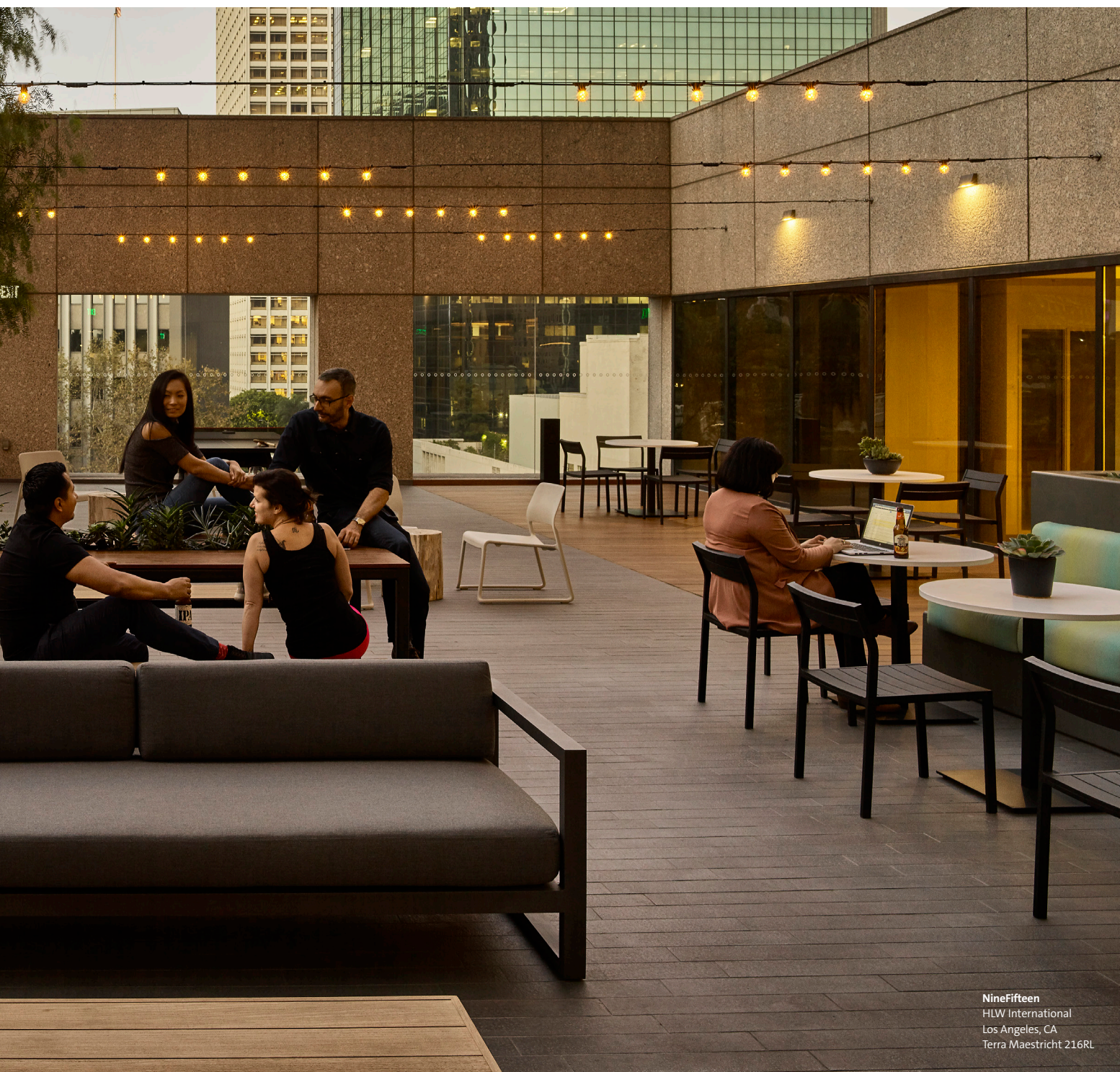
NineFifteen HLW International Los Angeles, CA Terra Maestricht 216RL

Commercial design is transforming. While designers may not embrace the buzzword, resi-mercial, they love what it stands for. For workplaces, healthcare, higher education facilities and hospitality, it is about creating a space that people find welcoming, relaxing, where they want to spend time. At retail and commercial venues, it centers on providing an immersive brand experience, creating destinations that draw people away from devices and into spaces that excite the senses and tell a story.