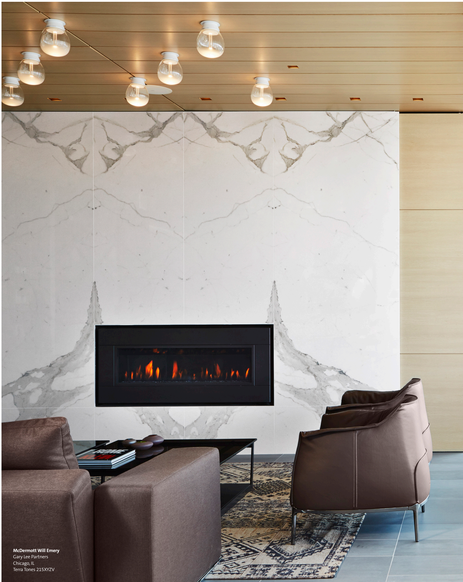
McDermott Will Emery Gary Lee Partners Chicago, IL Terra Tones 215XYZV