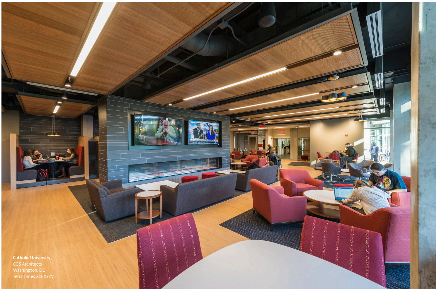
Catholic University CGS Architects Washington, DC Terra Tones 216XYZV