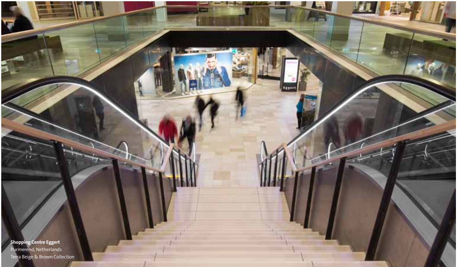
Shopping Centre Eggert Purmerend, Netherlands Terra Beige & Brown Collection