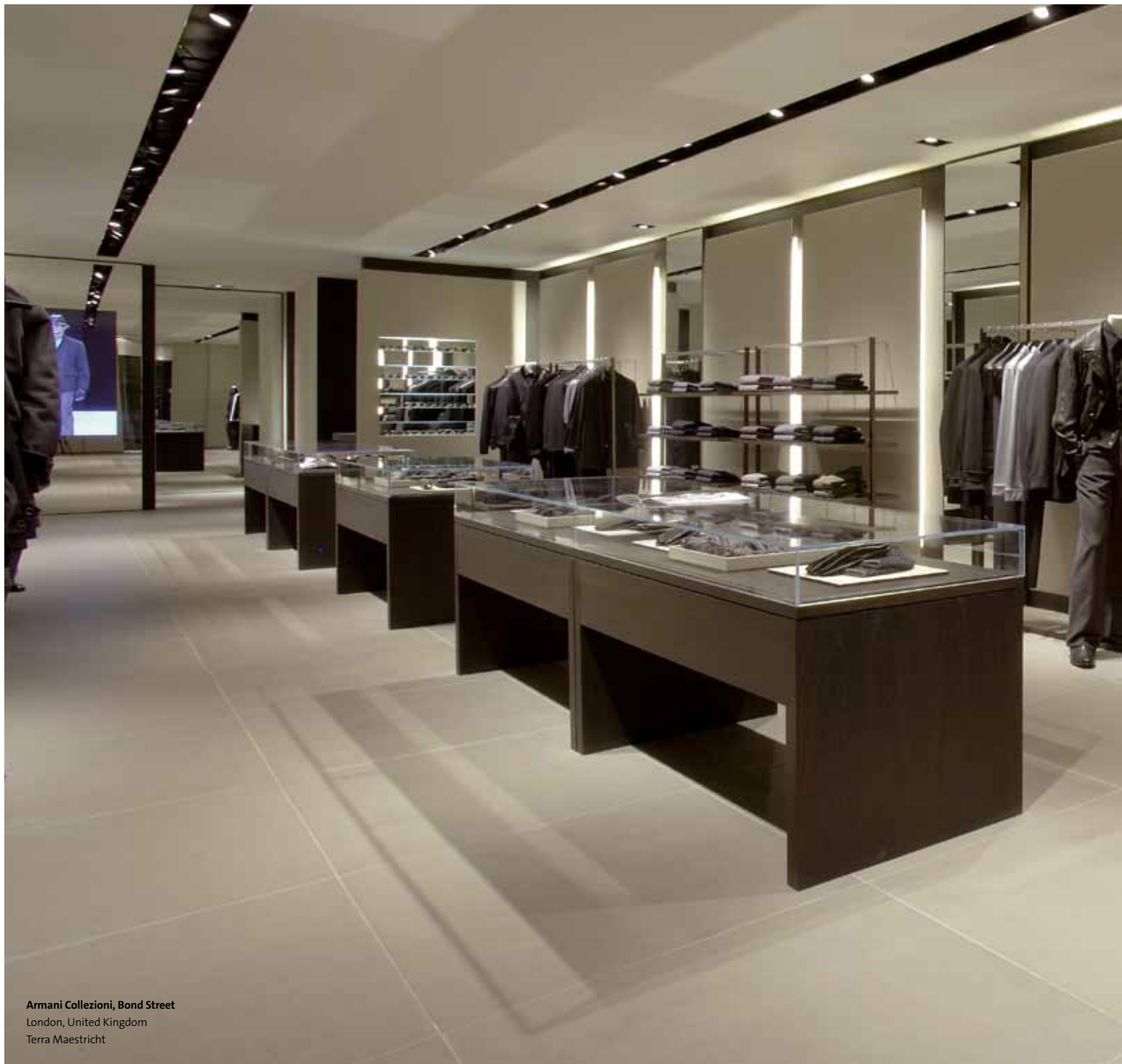
Armani Collezioni, Bond Street London, United Kingdom Terra Maestricht