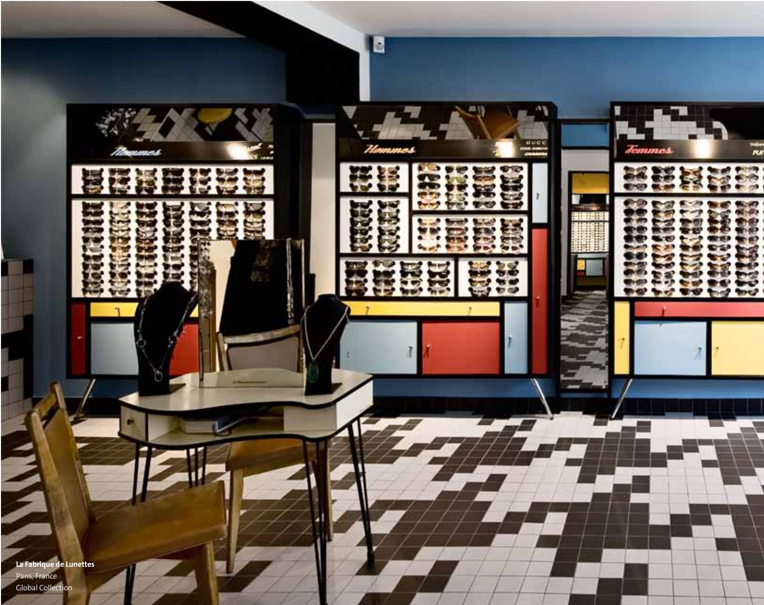
La Fabrique de Lunettes Paris, France Global Collection