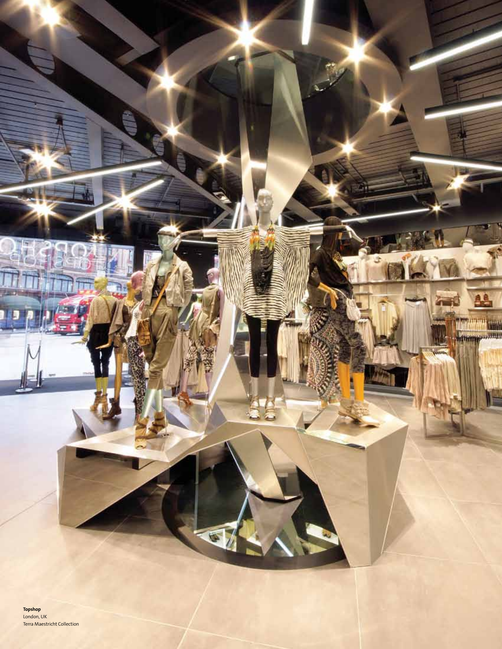
Topshop London, UK Terra Maestricht Collection