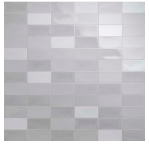
Mix 0601 serene white / 0605 fog grey