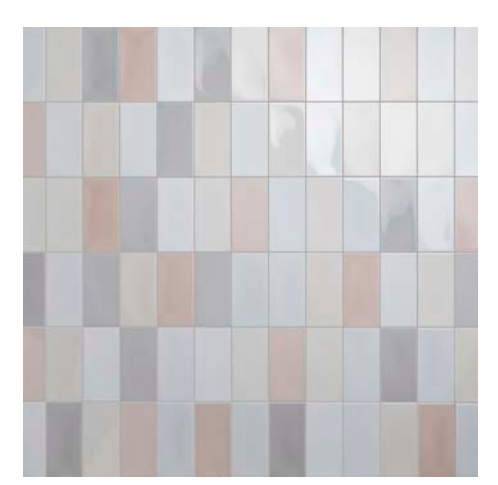
Mix 0601 serene white / 0602 blush / 0605 fog grey / 0606 bone