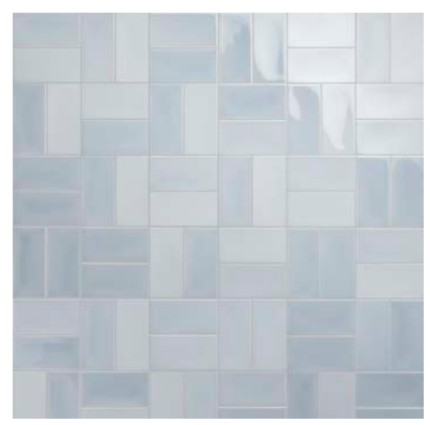
0604 blue mist