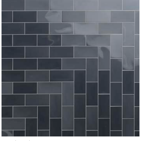
0608 charcoal grey