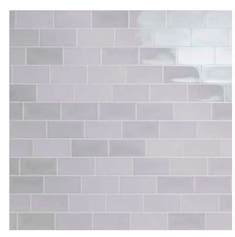
0605 fog gre