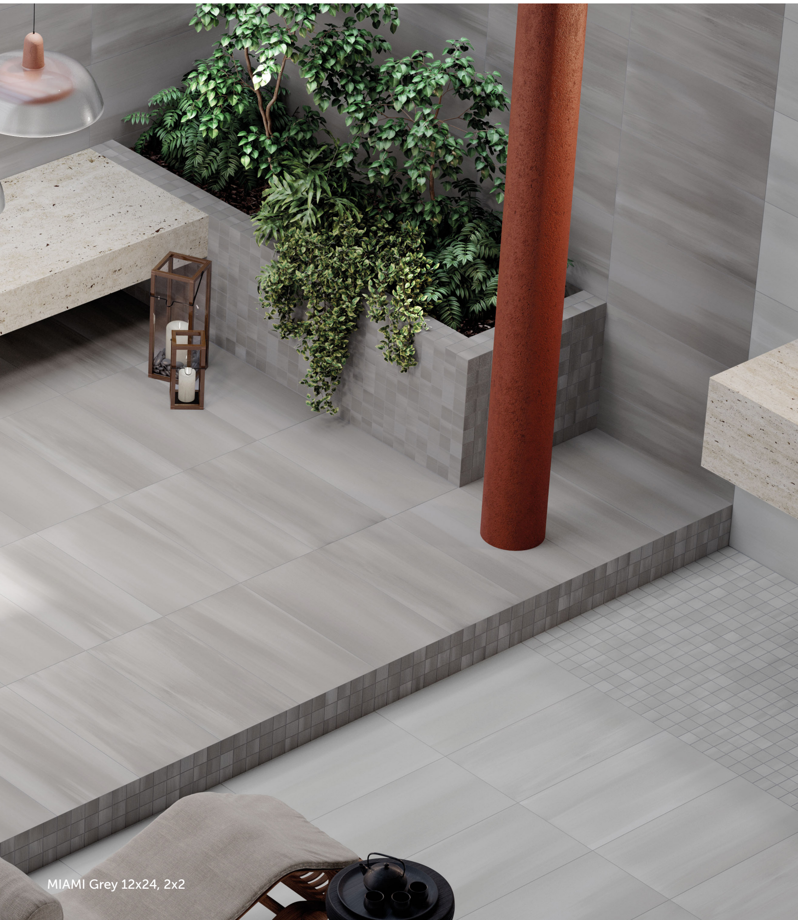
MIAMI Grey 12x24, 2x2