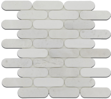
Dolomite, Iceberg, White