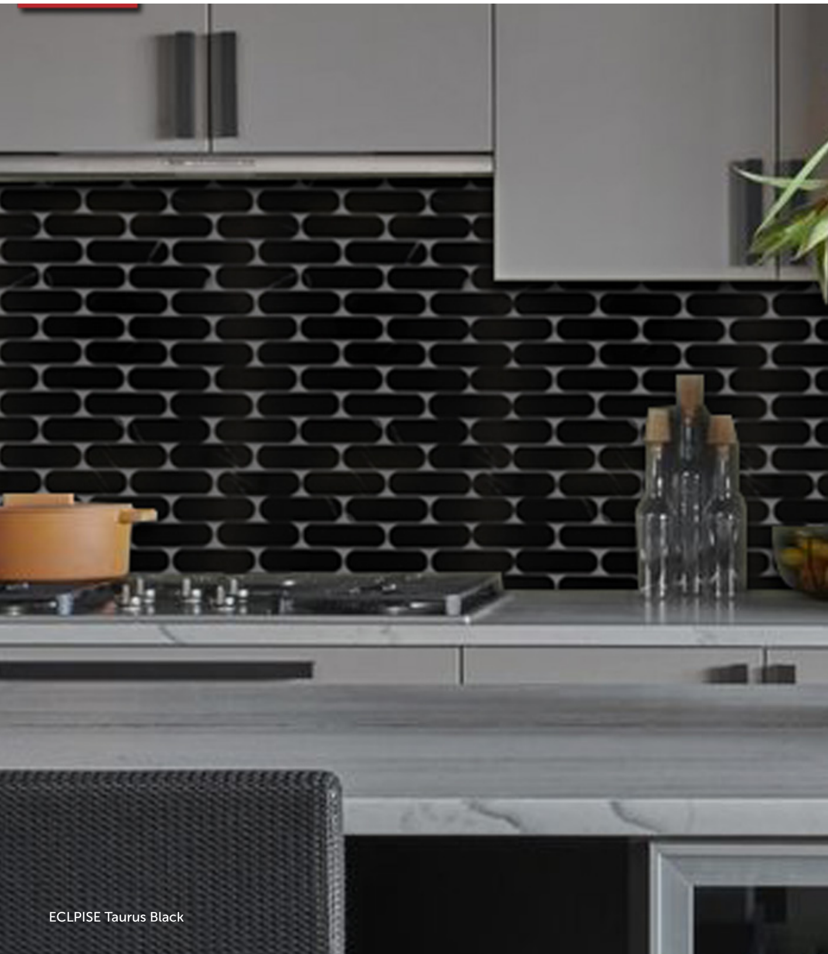
ECLIPSE Taurus Black