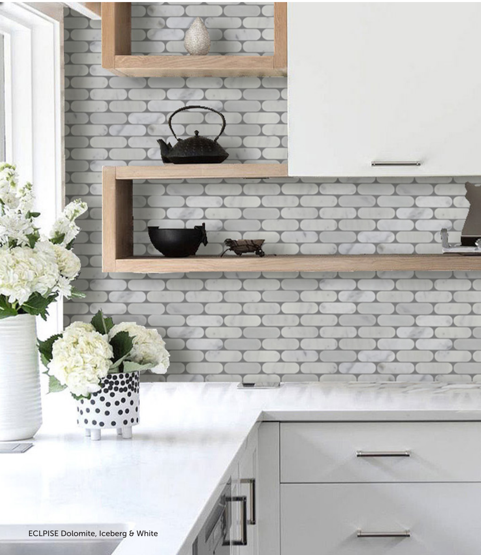
ECLIPSE Dolomite, Iceberg & White