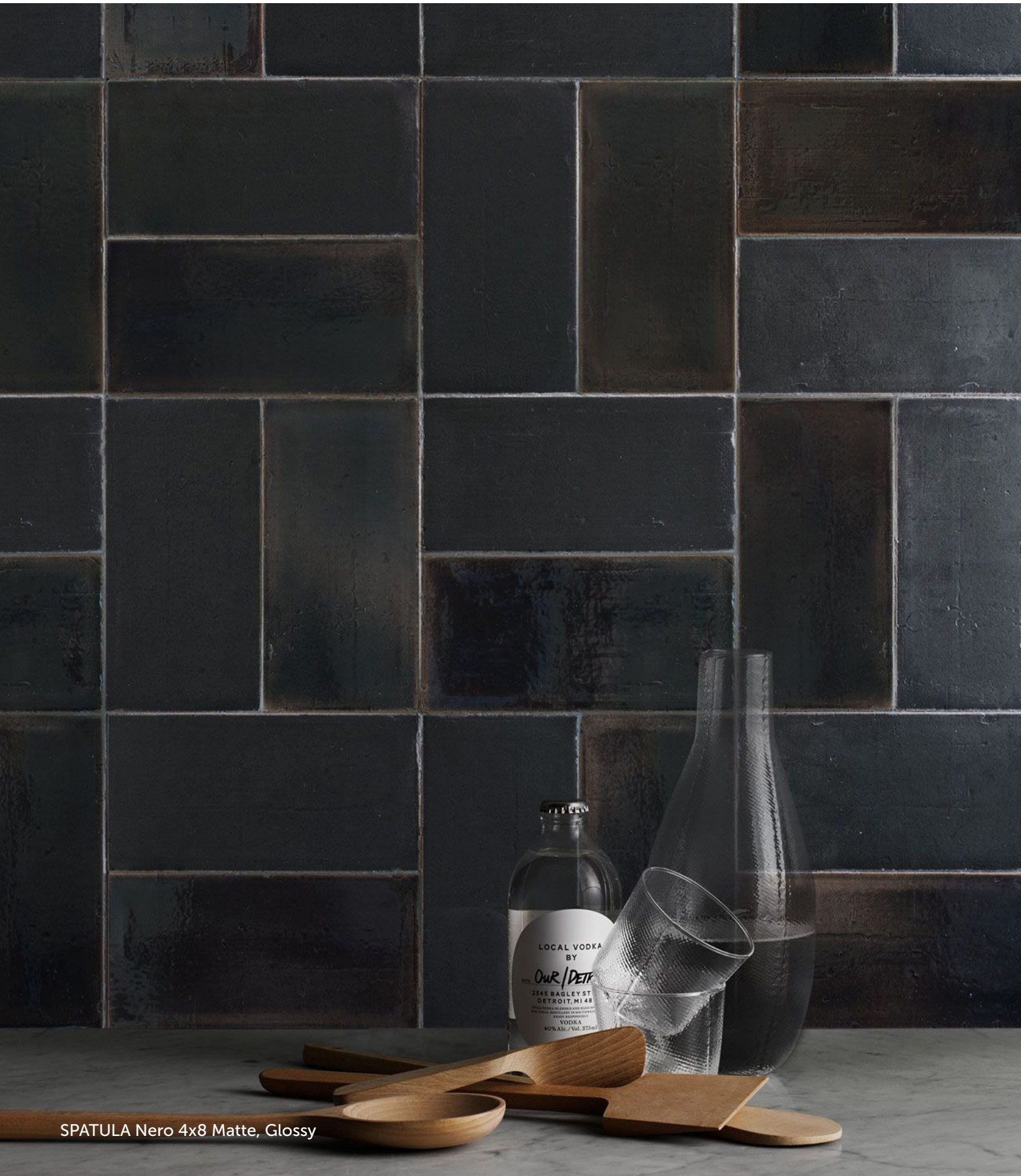
SPATULA Nero 4x8 Matte, Glossy