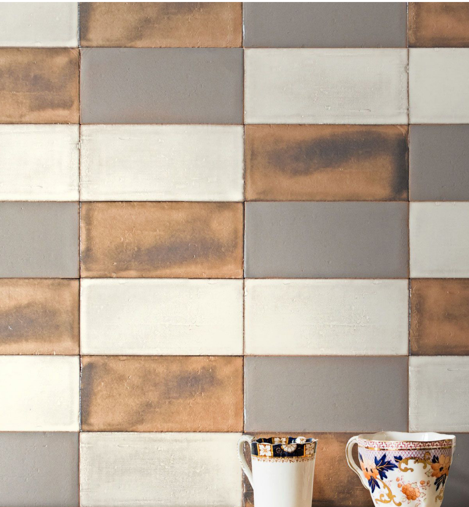
SPATULA Bone, Grigio Arenaria, Rame 4x8