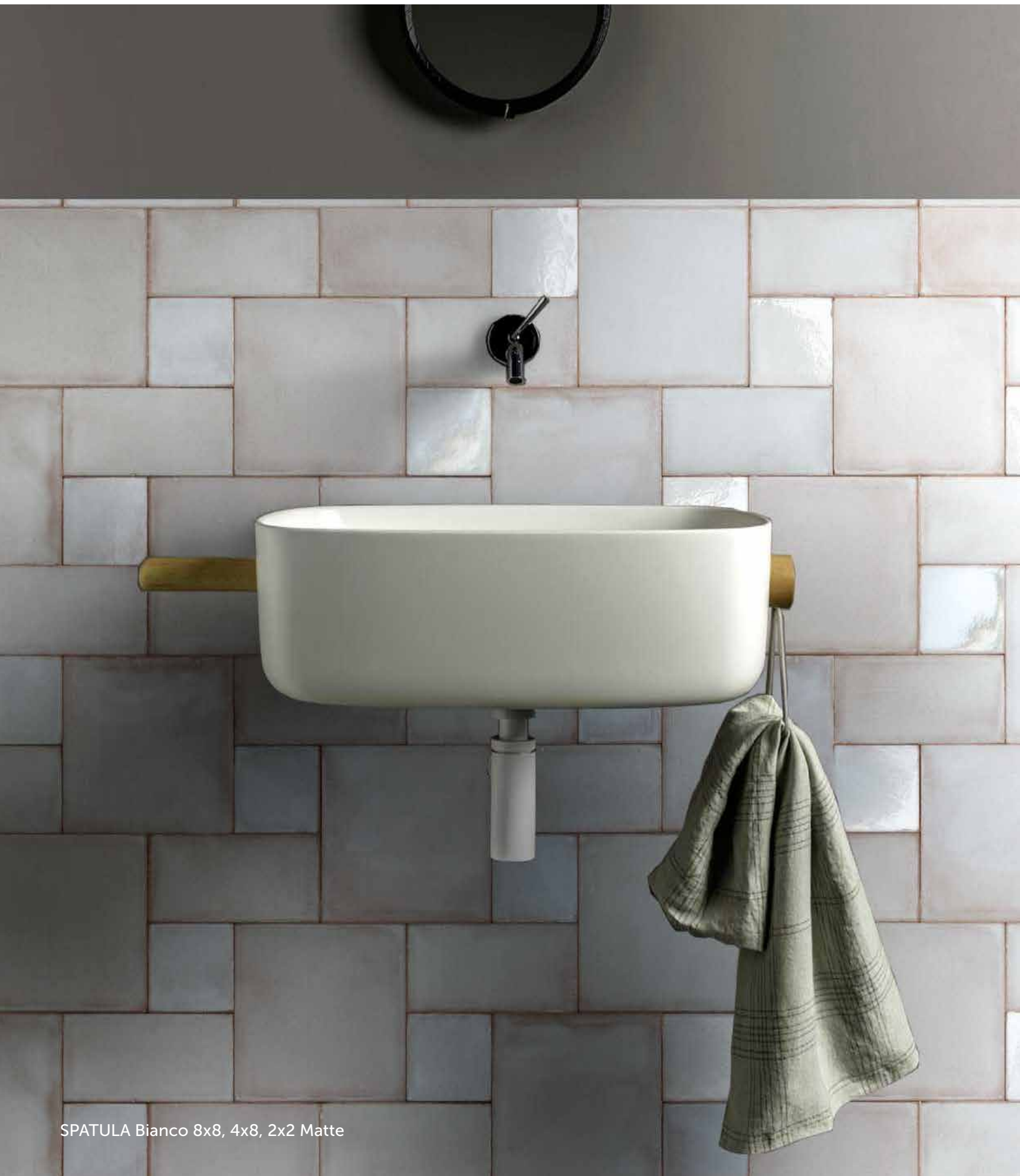
SPATULA Bianco 8x8, 4x8, 2x2 Matte