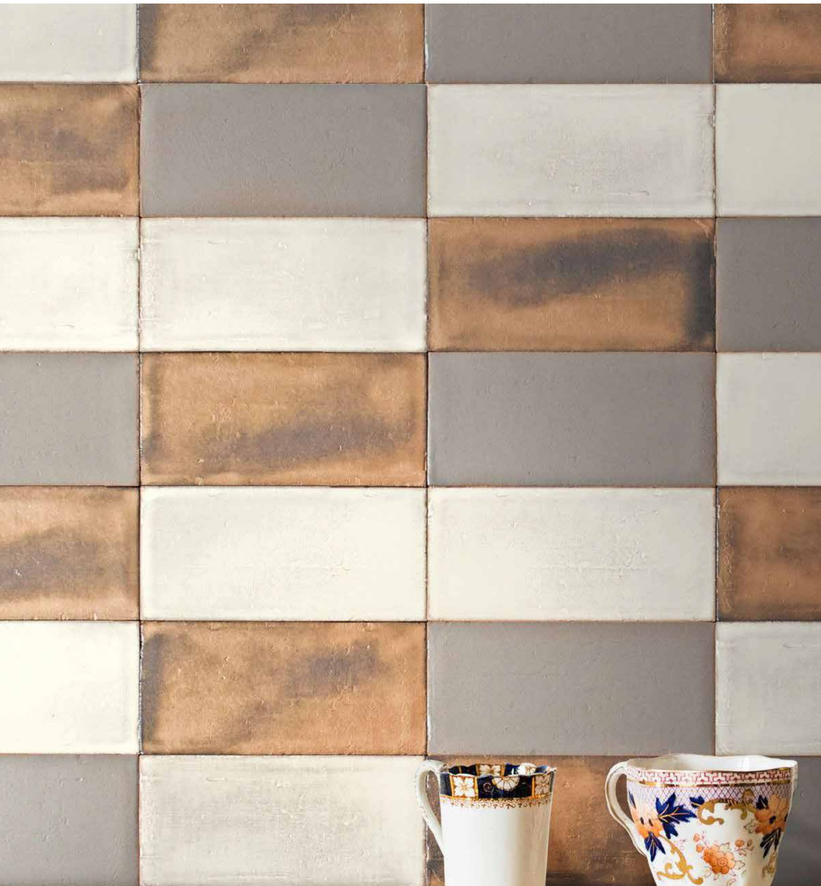
SPATULA Bone, Grigio Arenaria, Rame 4x8