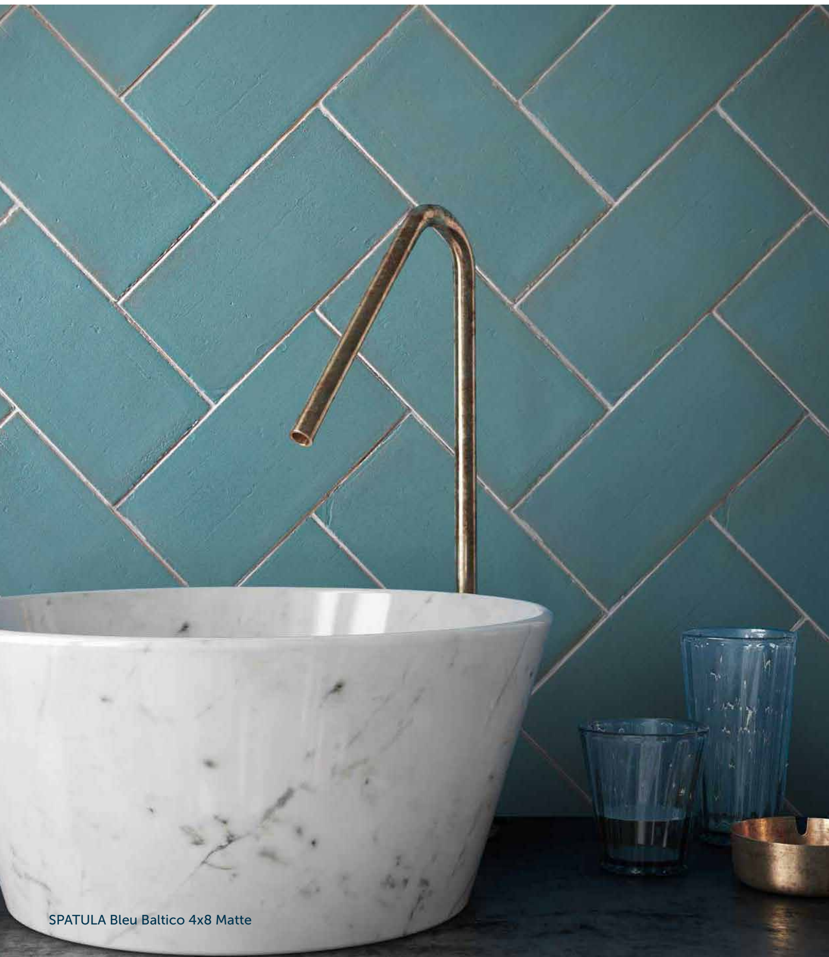
SPATULA Bleu Baltico 4x8 Matte