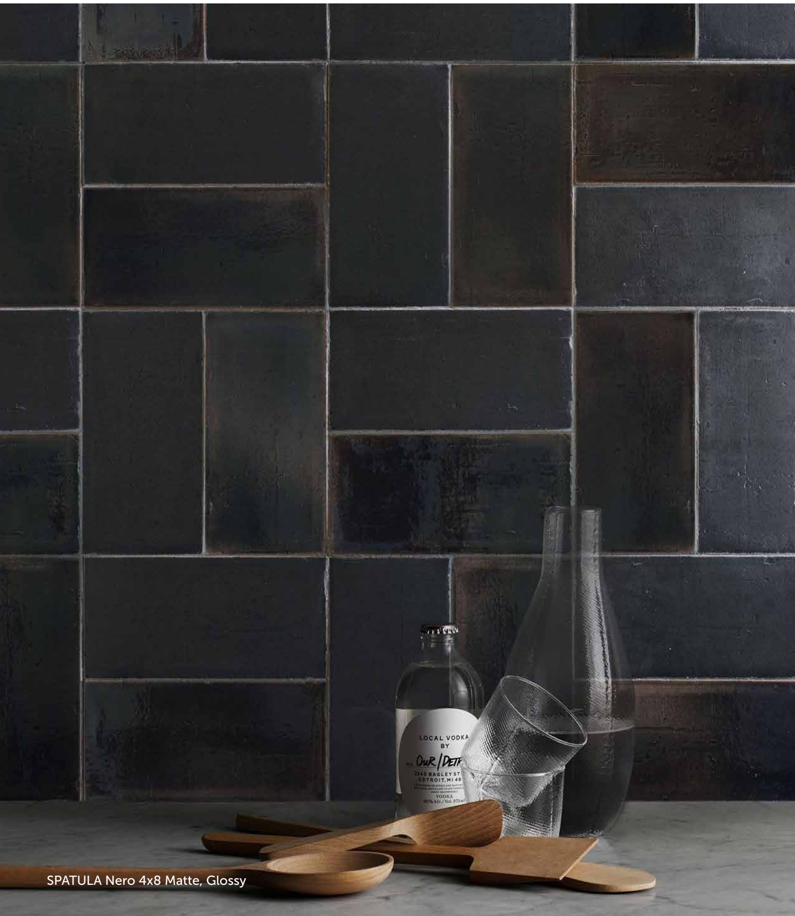
SPATULA Nero 4x8 Matte, Glossy