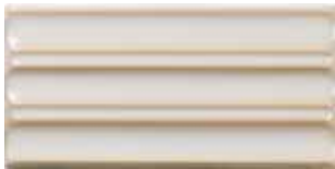
Deep White Belt