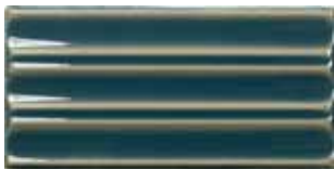
Peacock Blue Belt