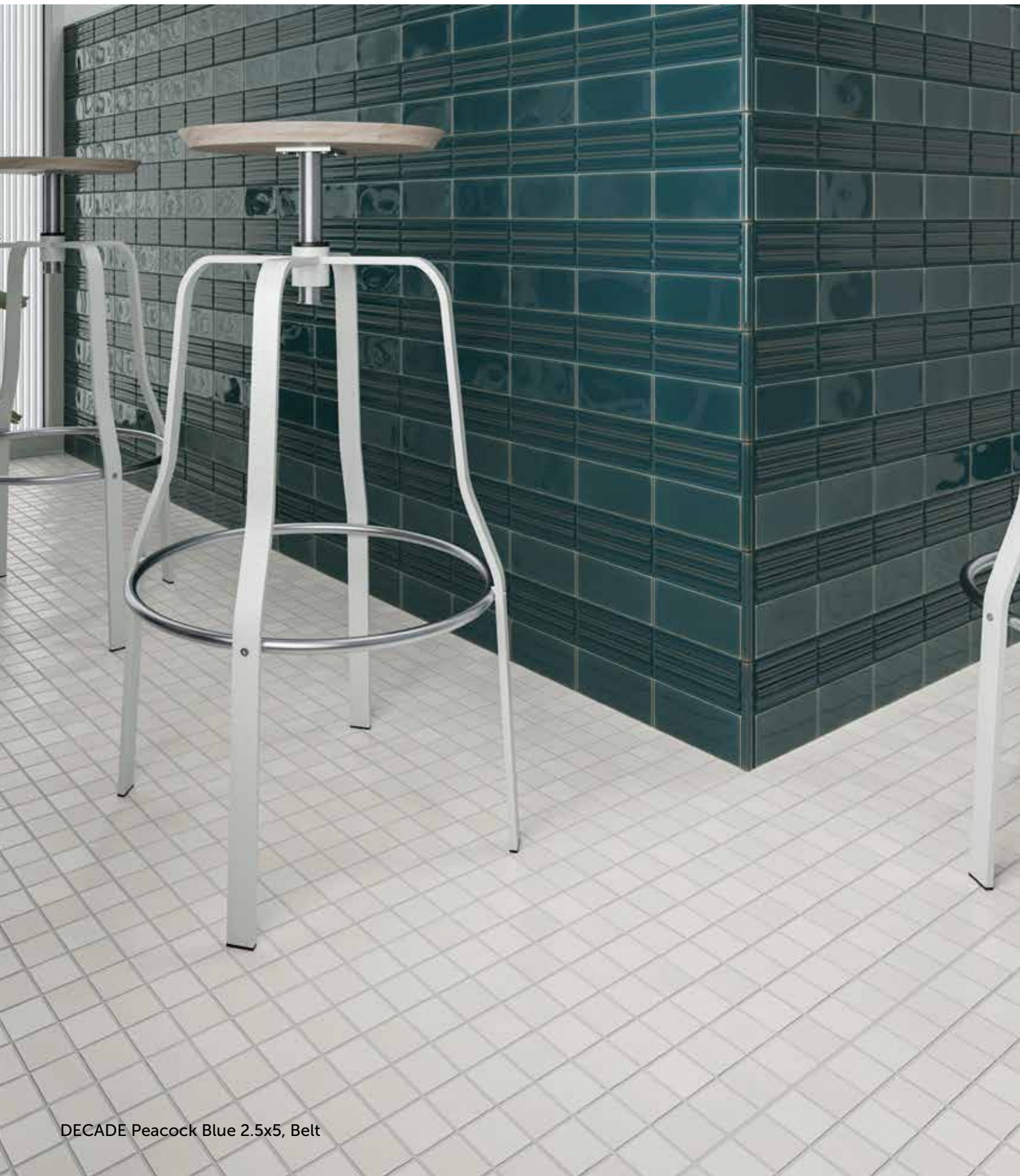
DECADE Peacock Blue 2.5x5, Belt