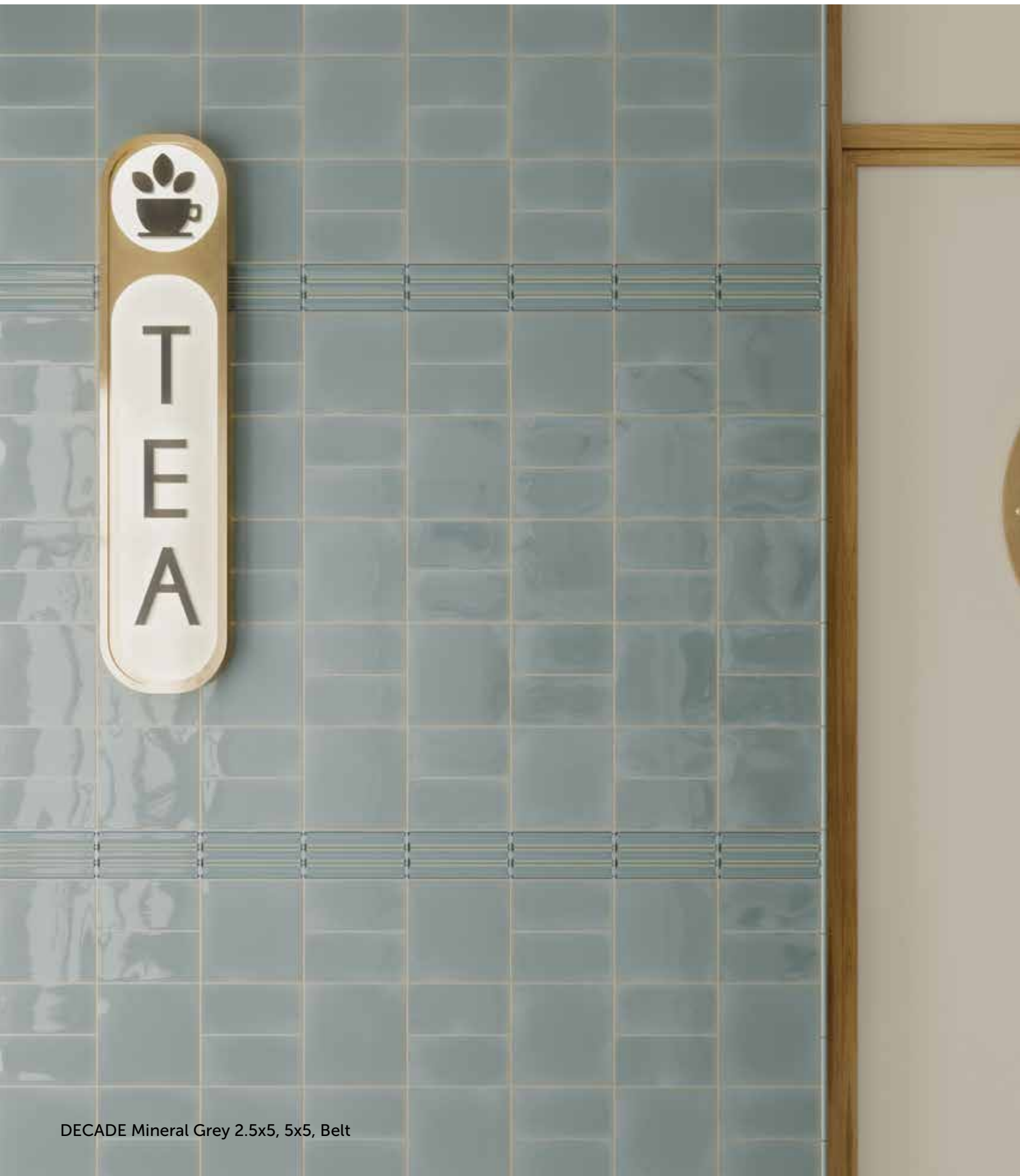
DECADE Mineral Grey 2.5x5, 5x5, Belt