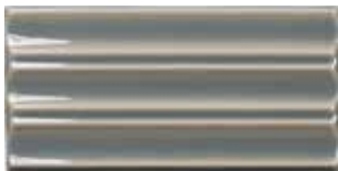
Mineral Grey Belt