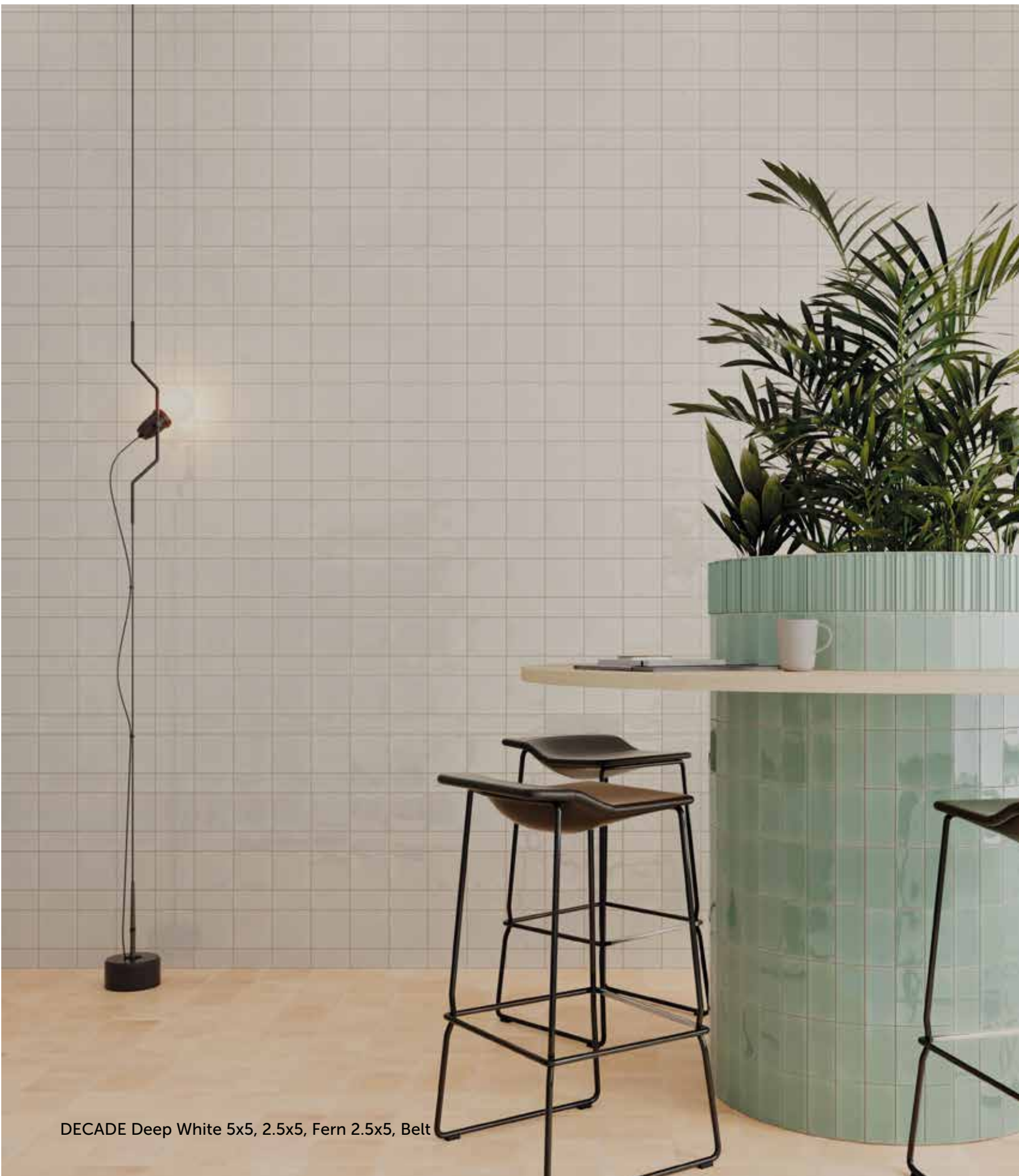
DECADE Deep White 5x5, 2.5x5, Fern 2.5x5, Belt