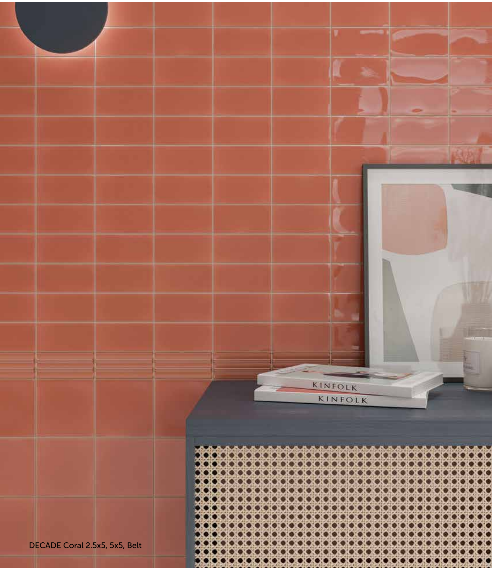
DECADE Coral 2.5x5, 5x5, Belt