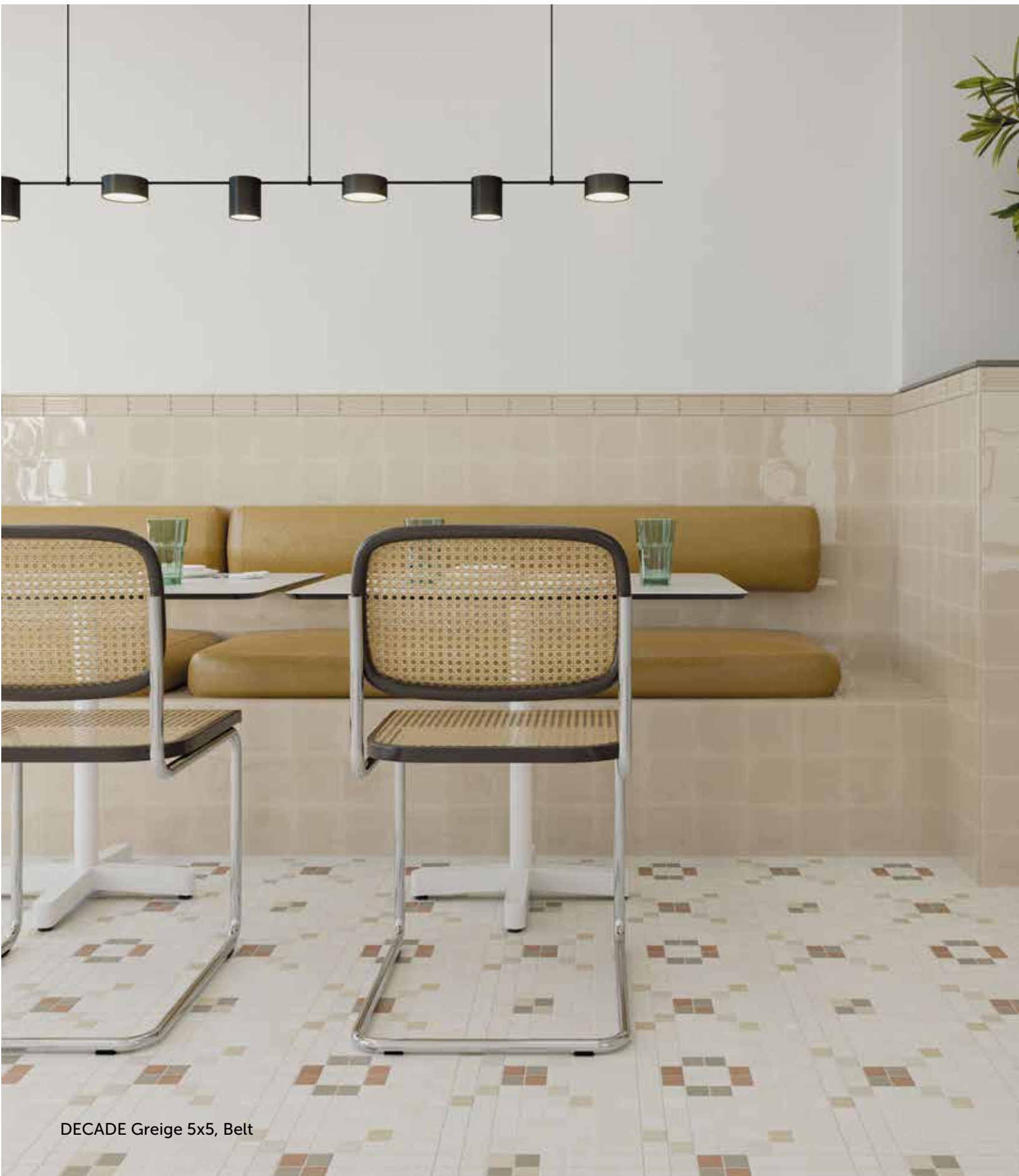
DECADE Greige 5x5, Belt