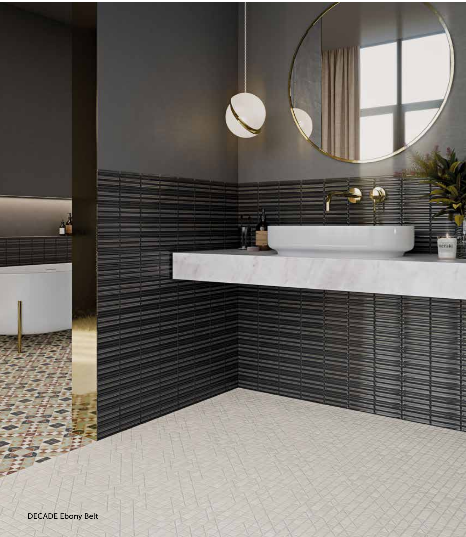
DECADE Ebony Belt