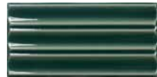
Royal Green Belt