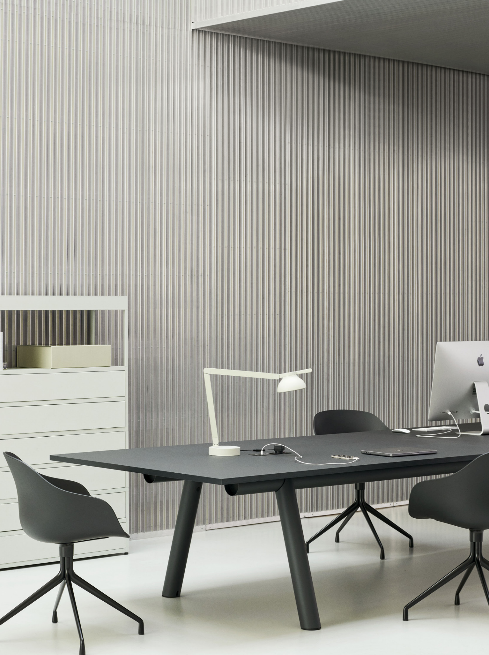
Boa Table | Black laminate tabletop & Charcoal frame