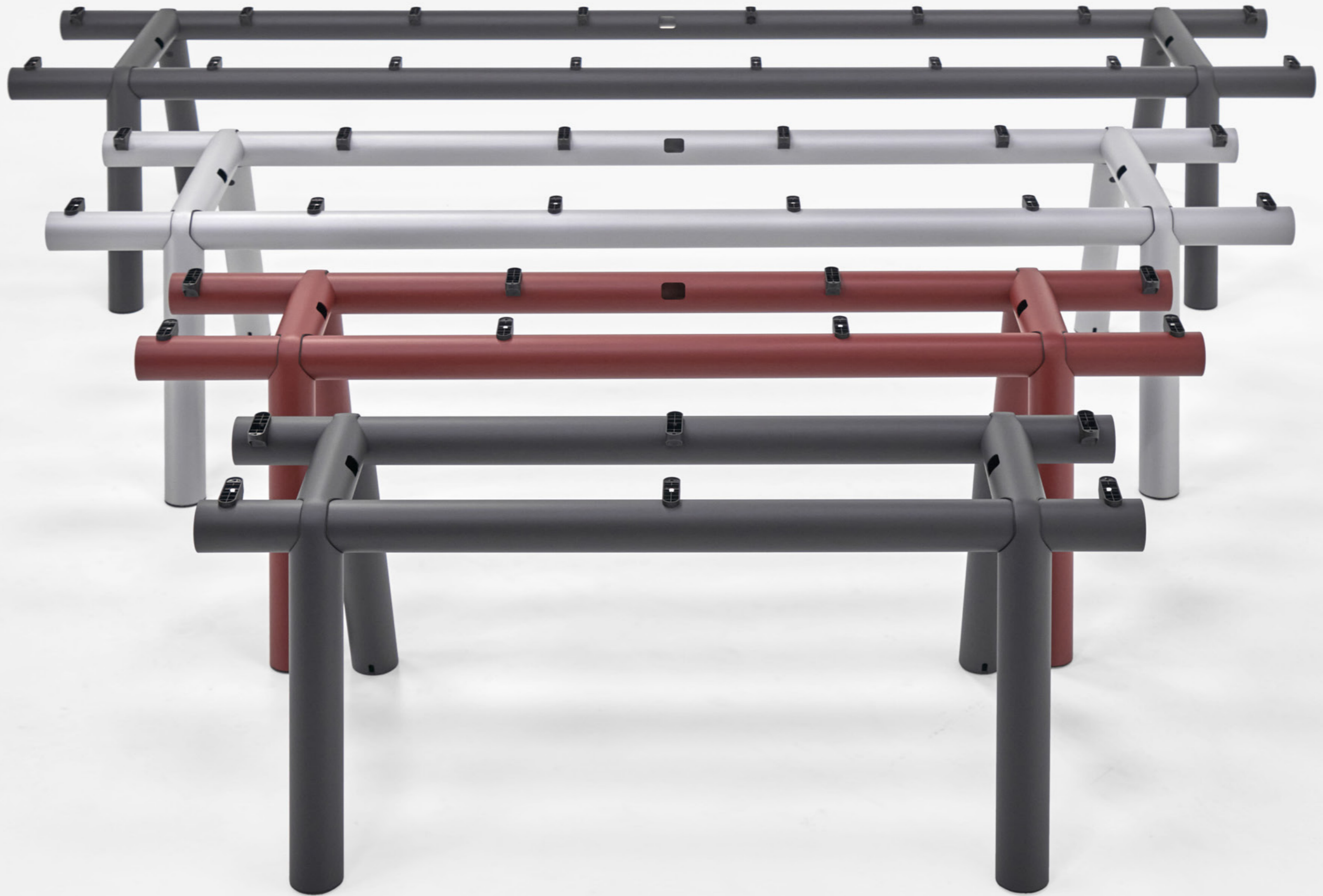
Boa Table Frame Family