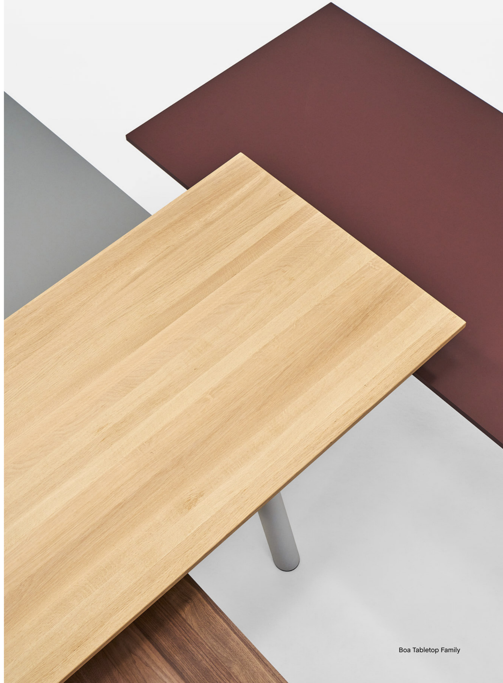
Boa Tabletop Family