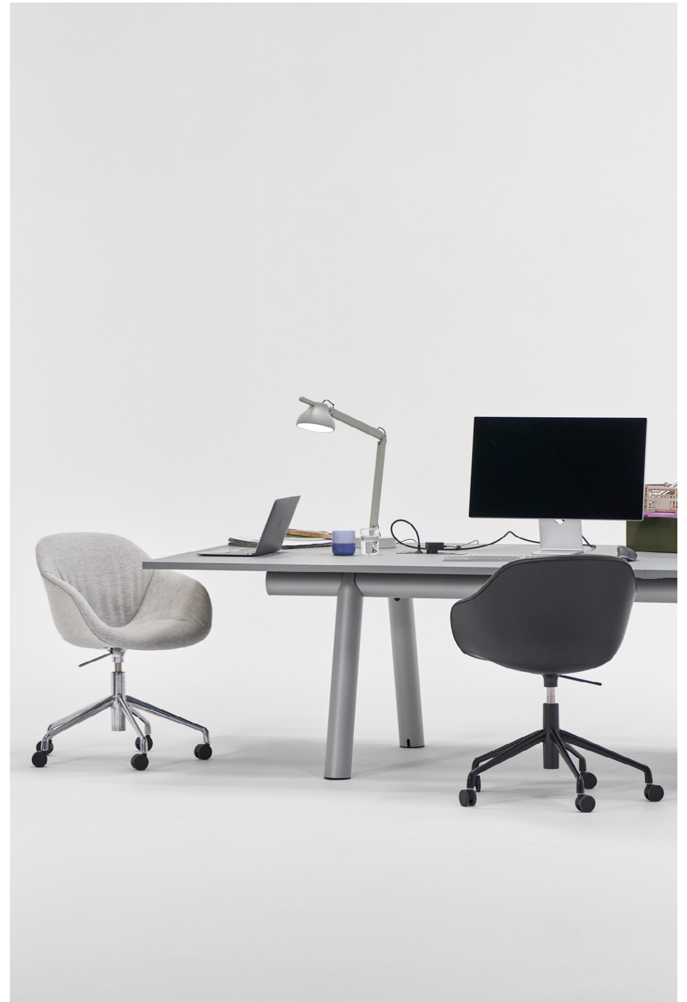
Boa Table | Grey linoleum tabletop & Metallic grey frame