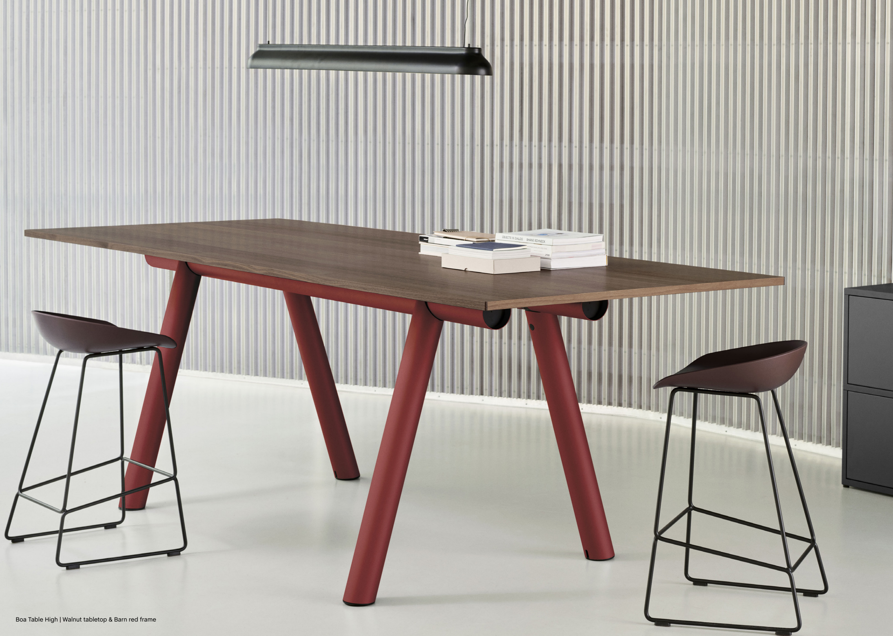
Boa Table High | Walnut tabletop & Barn red frame