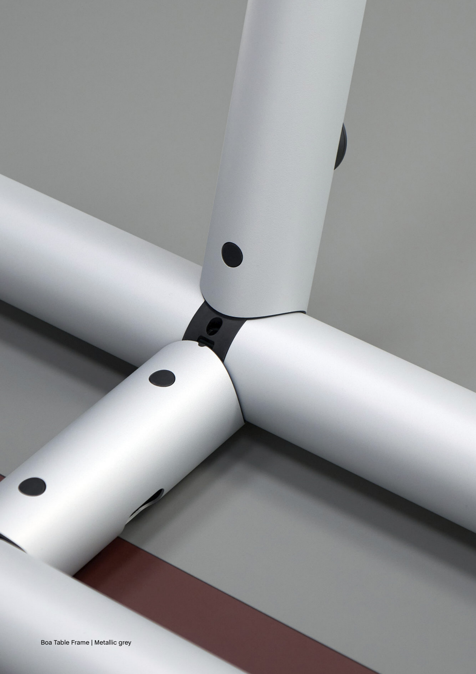
Boa Table Frame | Metallic grey