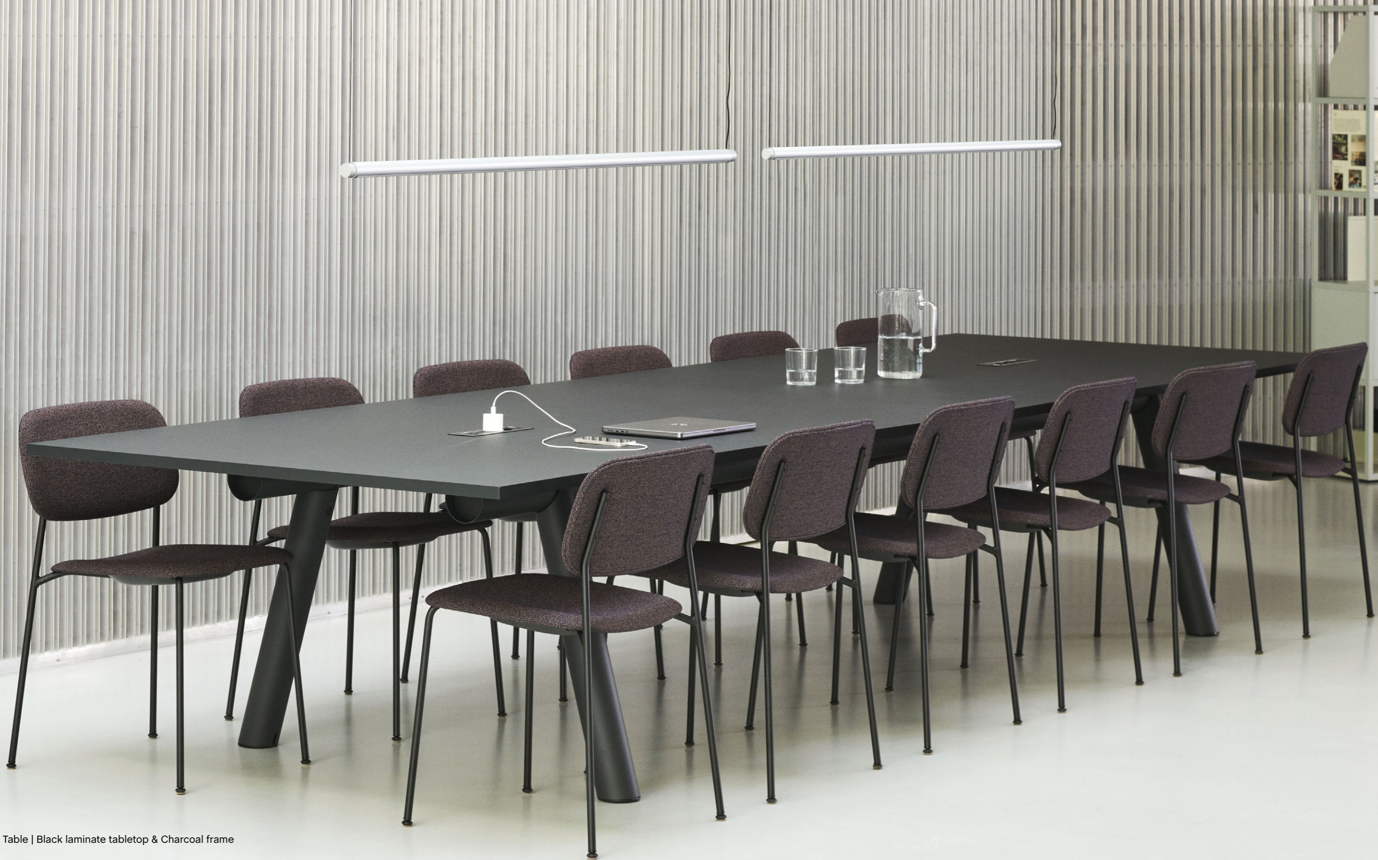
Boa Table | Black laminate tabletop & Charcoal frame