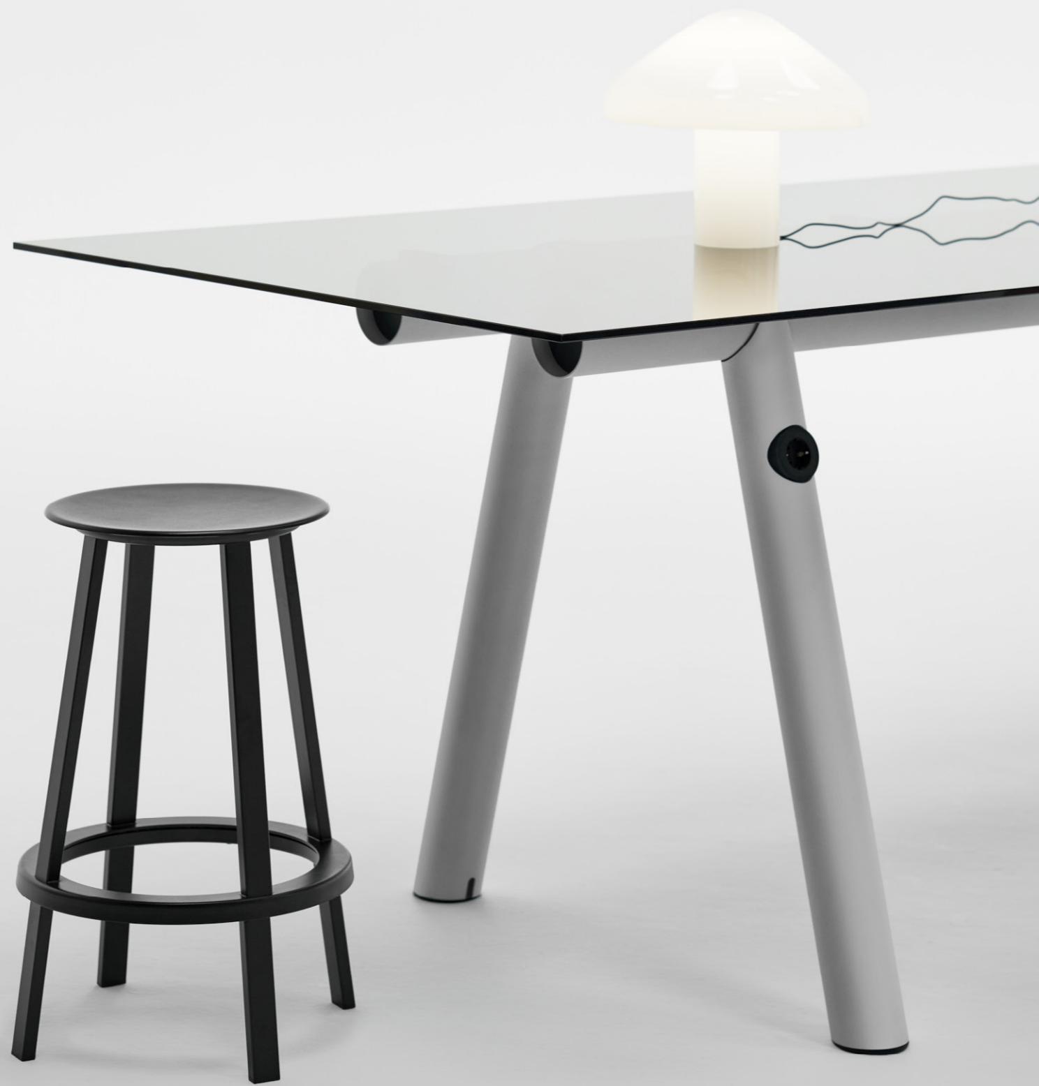
Boa Table High | Pix in leg | Grey glass tabletop & Metallic grey frame