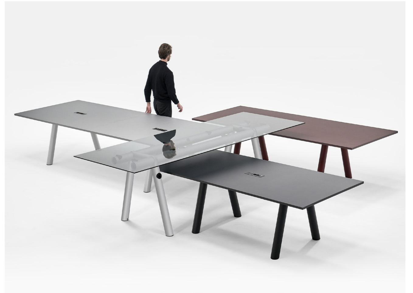
Boa Table Family