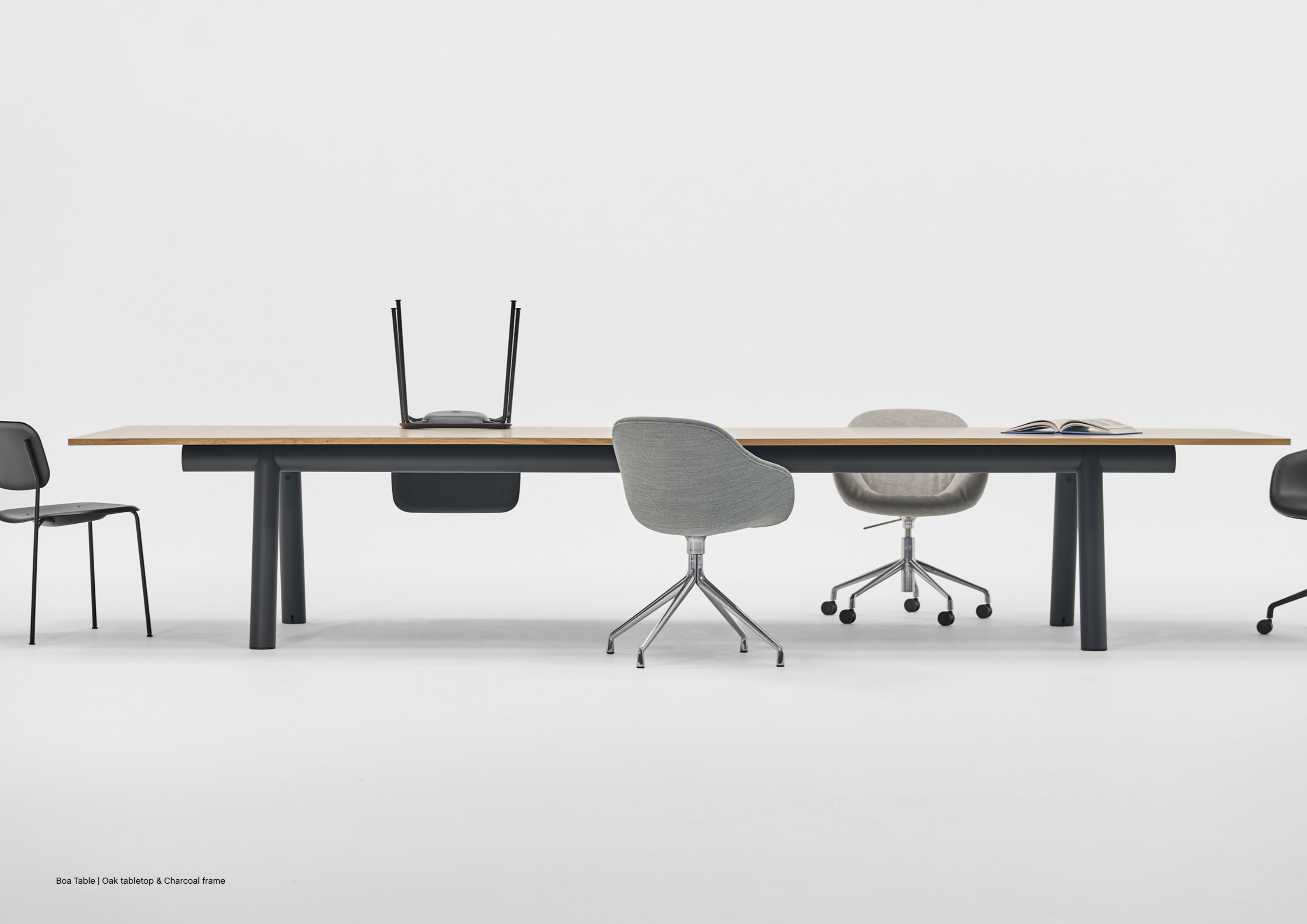
Boa Table | Oak tabletop & Charcoal frame