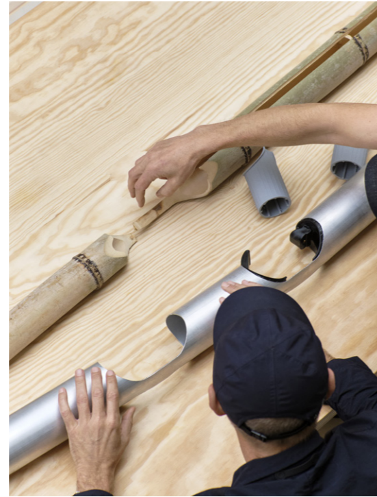
The bamboo's folding technique is translated into industrial aluminium tubes that are bent into place.