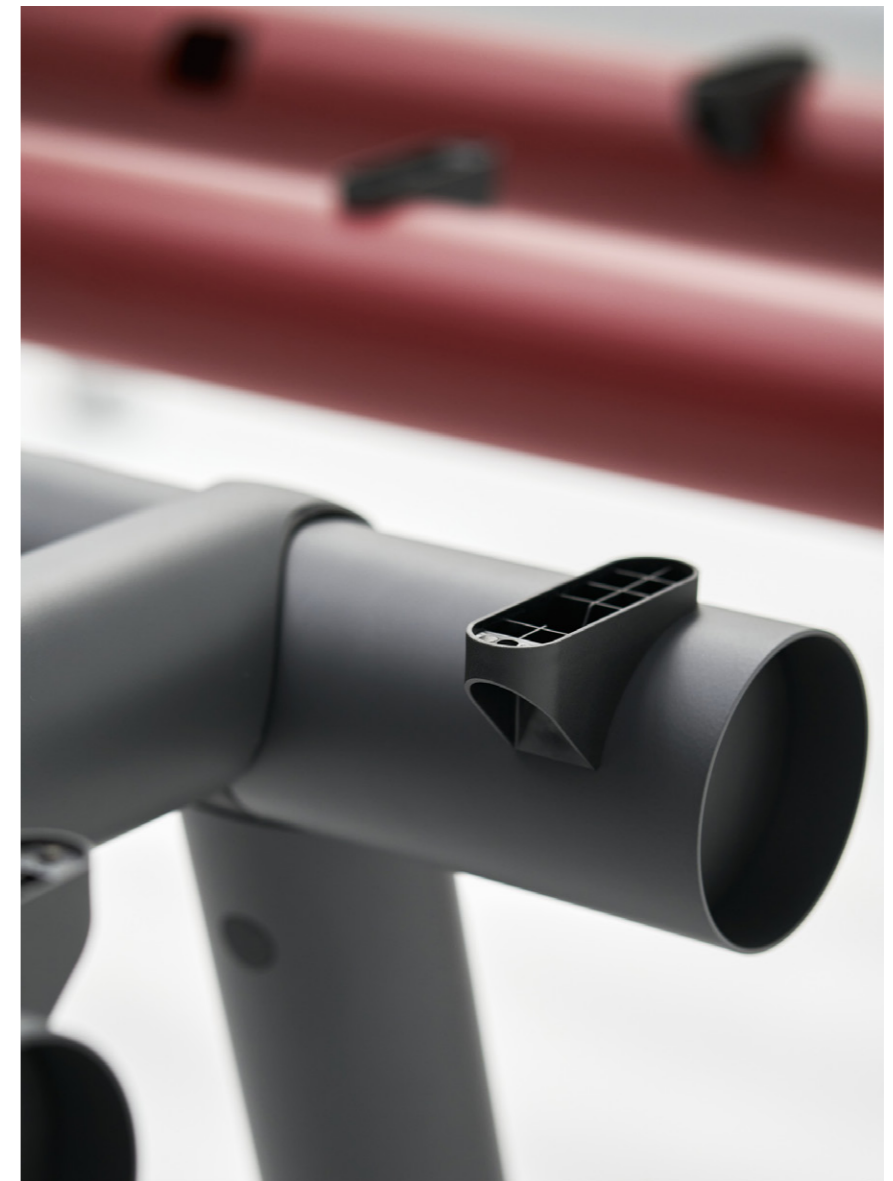
Boa Table Frame | Charcoal & Barn red