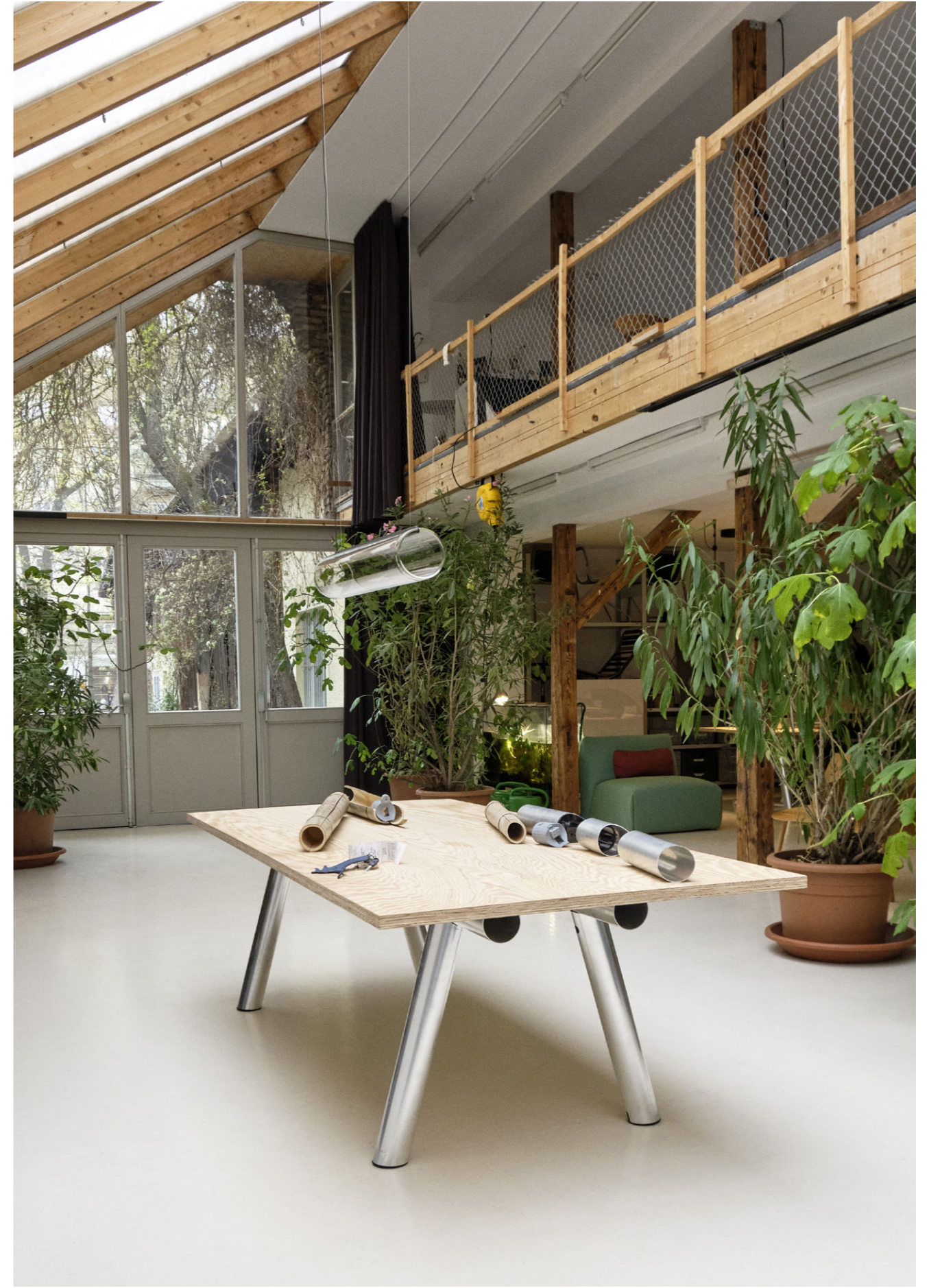
Prototype of Boa Table in Stefan Diez's studio in Munich, Germany.