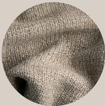
Ash TUM 4

This soft yet strong linen upholstery fabric is woven with a complex double layered structure of interlaced thick, supple linen yarns and is reversable. Delicate in appearance, it is highly robust.