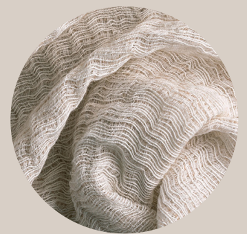
Gecko SABA 2