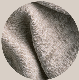
Alabaster PTR 1