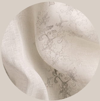
White Clay DES 1