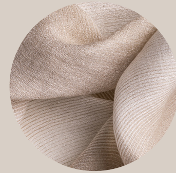
Mist MIR 1