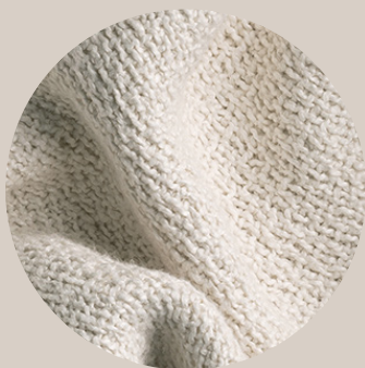
Chalk TUM 1