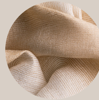
Glow MIR 3