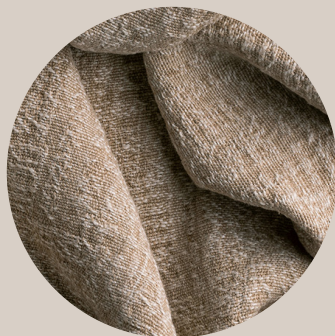
Sandstone PTR 3

This 100% linen fabric is crafted from space-dyed yarns in the warp that create subtle movement in colour. Ivory weft yarns woven in a jacquard texture give the cloth real character and movement.