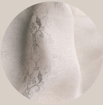
Marble DES 2