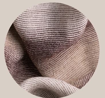
Dusk MIR 4