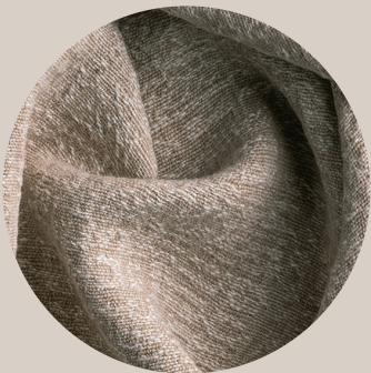
Rose City PTR 2