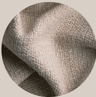
Smoke TUM 3