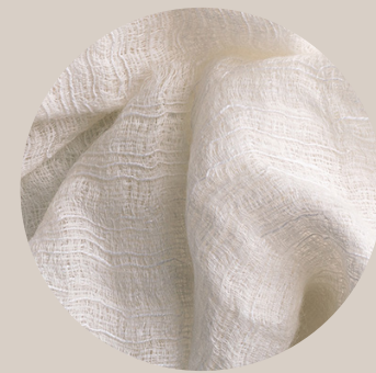
Moth SABA 1