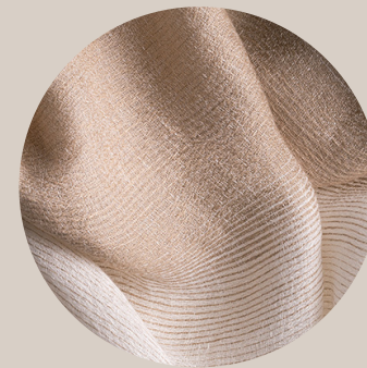
Haze MIR 2