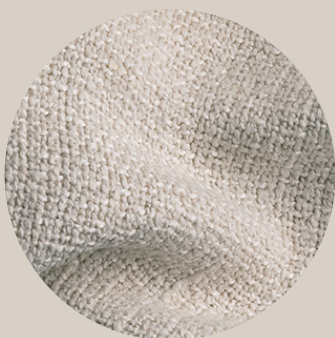
Sand TUM 2