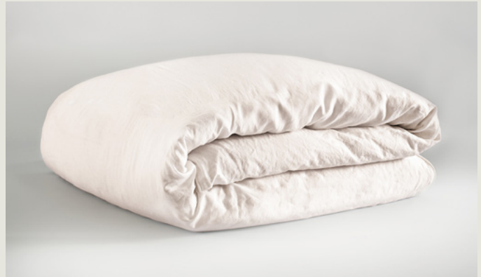
Pure Piped Duvet Cover King PBD5