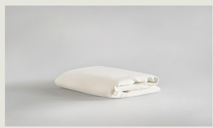
Pure Flat Sheet Single PBD7