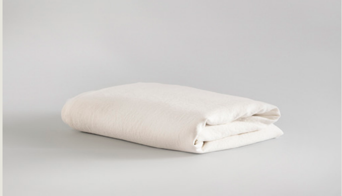
Pure Flat Sheet King PBD9