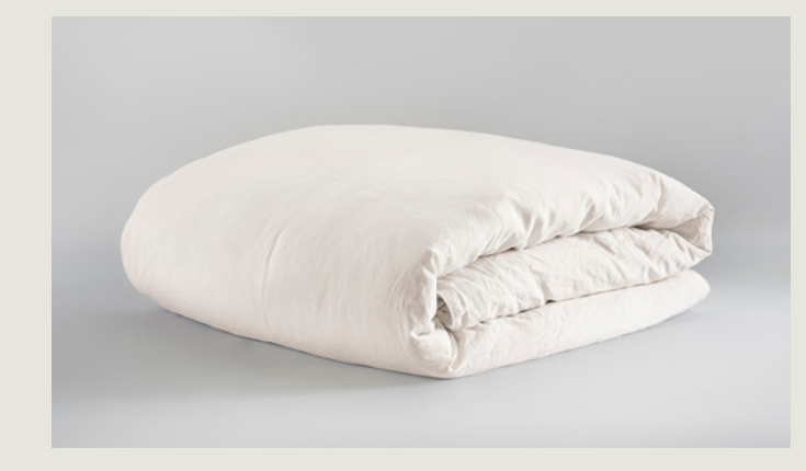
Pure Piped Duvet Cover Double PBD4