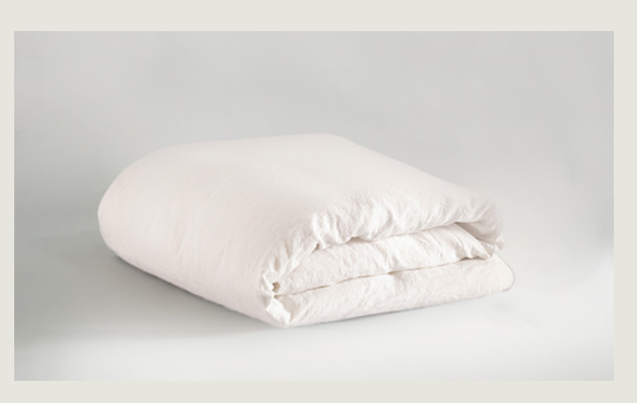
Pure Piped Duvet Cover Single PBD3