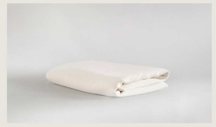
Pure Flat Sheet Double PBD8