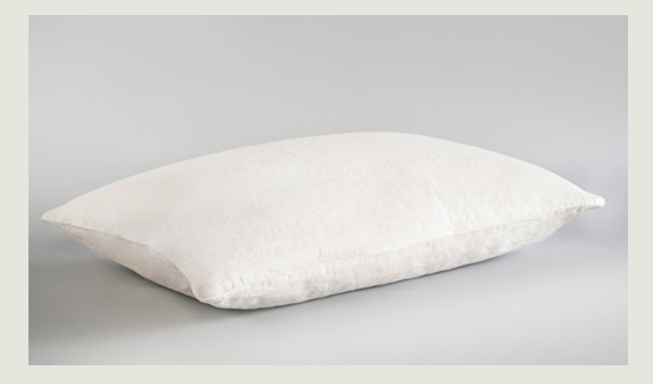
Pure Standard Pillowcase PBD1