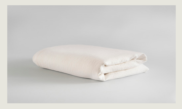
Pure Flat Sheet Super King PBD10