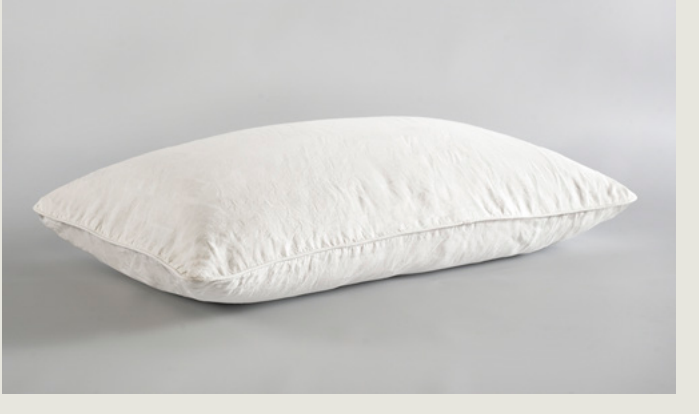
Pure Piped Pillowcase PBD2