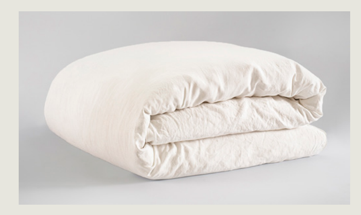
Pure Piped Duvet Cover Super King PBD6