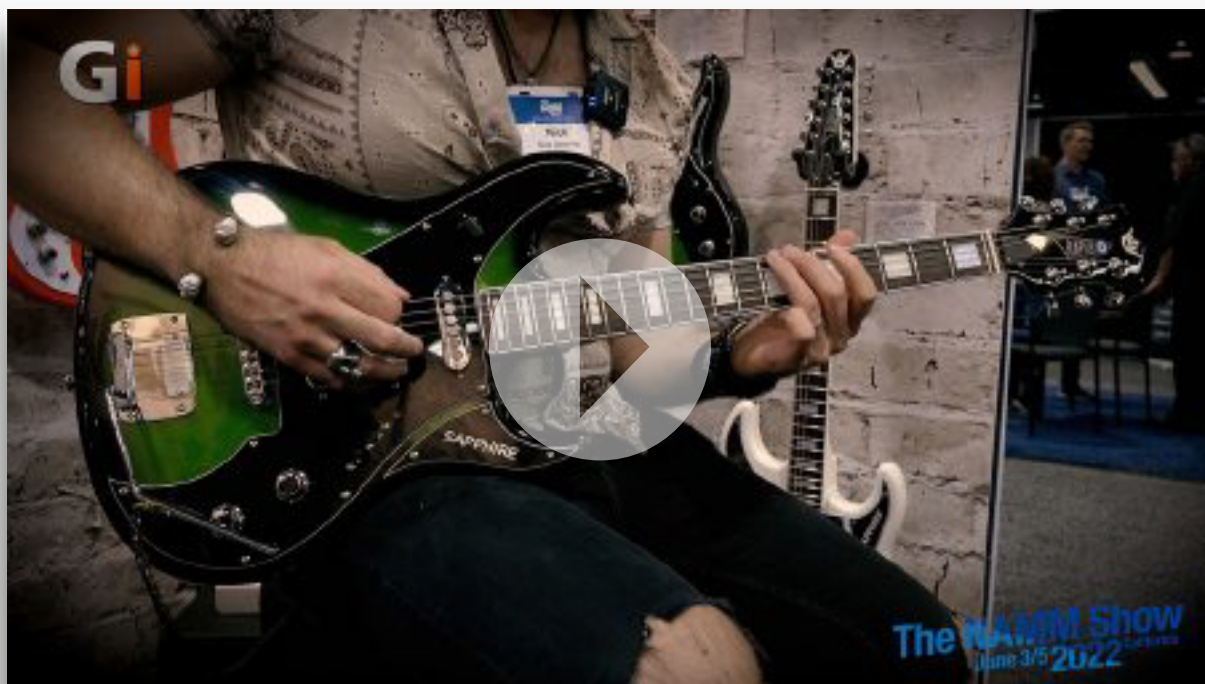
Rapier Saffire 6

The Rapier Saffire Series is based on iconic models that played a major role in the industry of British guitars, serving countless up and coming 60's British Beat groups and helped launch the careers of many guitarists in the 60's and 70's and, whilst Entwistle has successfully »