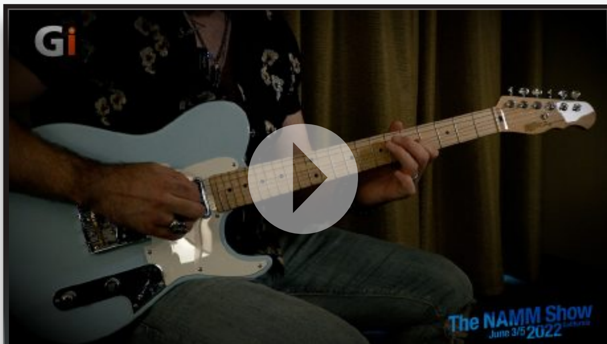
Fret-King Country Squire Music Row

The selected American alder body, Canadian rock maple neck and premium rosewood finger-board ensure constructional integrity, which provides the platform for classic, authentic tonal-ity. »