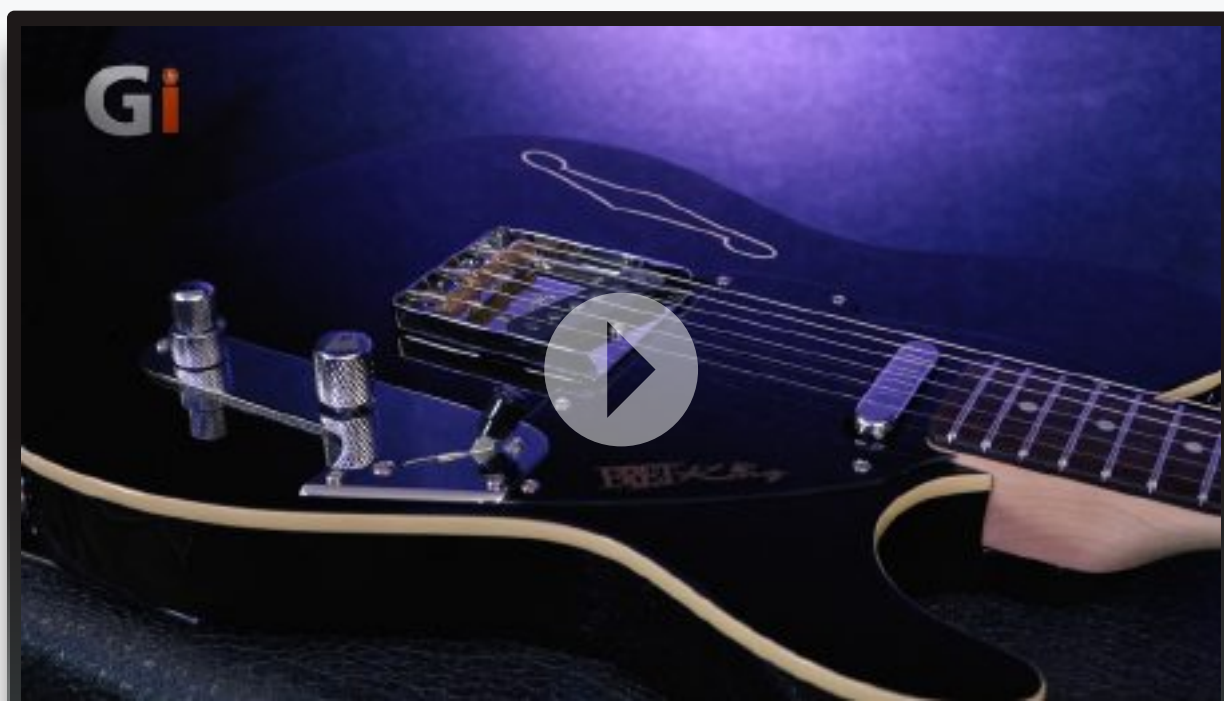
Fret King FKV27SBK Country Squire Stealth Gloss Black

First of all, this is what you'd expect of a T-style design; we have the T-style body, 22 frets, 25.5 inch scale length, Wilkinson Ashtray 3 brass saddle bridge, and 3-way pick-up selector for the two visible pickups. The guitar features a unique pickguard and a strat-style pickup selector placement. The Stealth Gloss black looks awesome in the flesh, and the painted F hole gives the guitar a classic/contemporary vibe. ▶