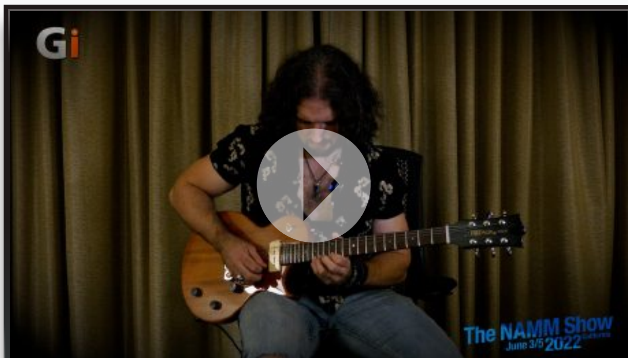
Fret-King FKV1 Eclat Standard

At first glance, this guitar looks like your typical two-pickup LP Junior (ok, LP Special) - a singlecut slab of mahogany with a flat top, a stop tailpiece and a pair of P90s. »