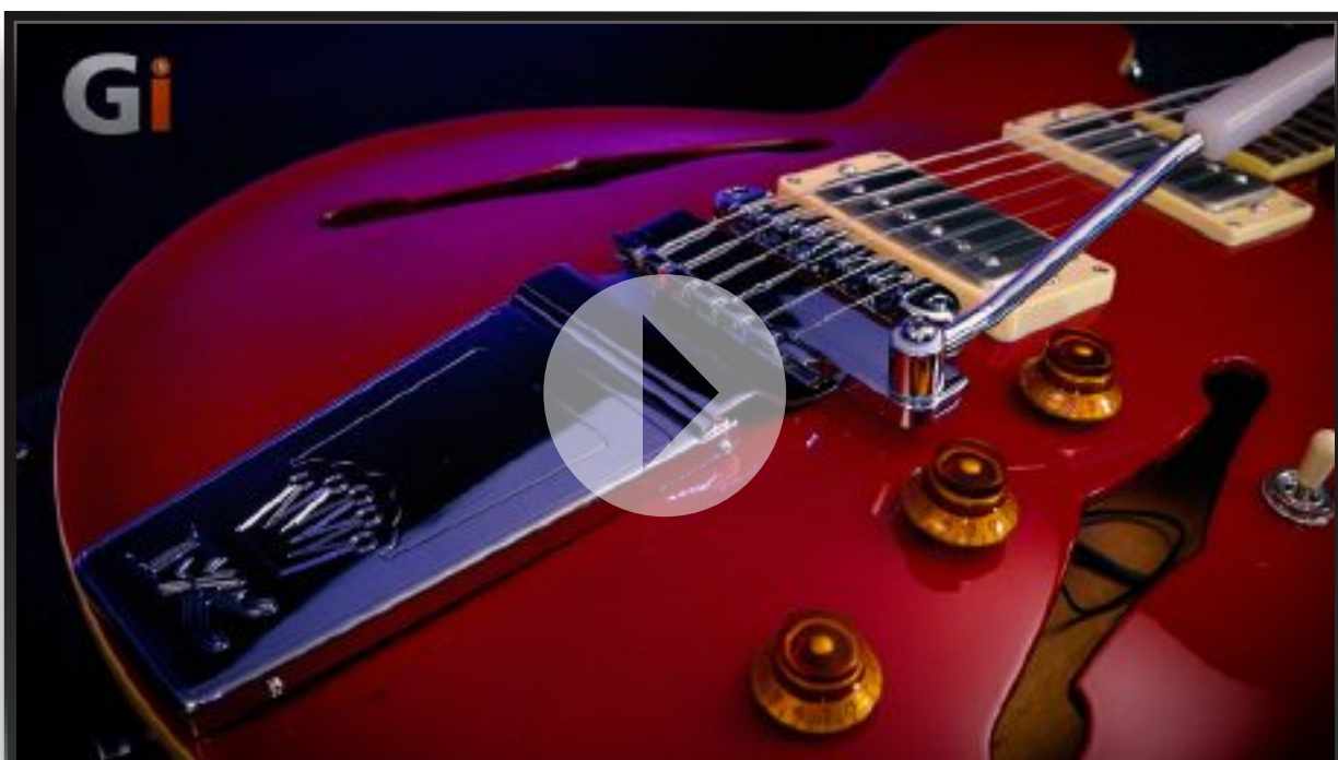
Fret-King Elise Custom with Classic Vibrato

more scooped and twangy tone if we desire. Then there is the Vari-Coil control, this allows us to 'wind' the pickup up or down to either double or single coils. There seems to be a few Fret King guitars with this feature, the winding up/down will be different depending on what type of pick ups are in the model. However, for the Elise Custom, this allows us to wind 'down' from double to single coil sounds. For my ears, this leads to a tasteful thinning out sound, with a little less output;