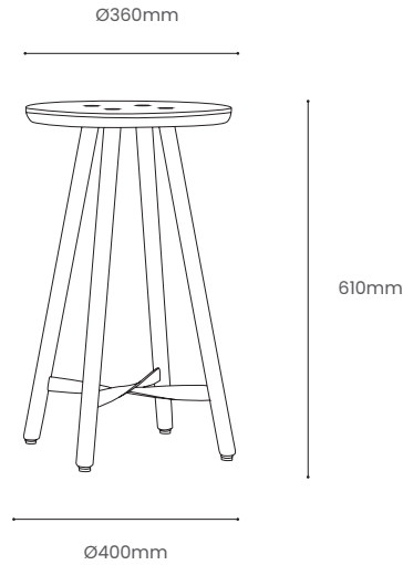
Crib Side Table

A balancing act of craftsmanship and creativity. Timeless while contemporary. Trusted while surprising. Two playful steam bent twists of sustainably sourced oak brings our signature aesthetic to the fore. Whether placed within hardworking hallways as a quick resting spot, or within bedrooms and living spaces as extra essential storage, the wooden side table holds its own. Subtle, playful, and different from every angle – the Crib Side Table will always attract attention.