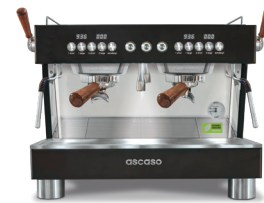
2GR Compact Black&Wood