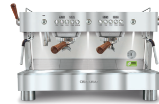
2GR Full Inox