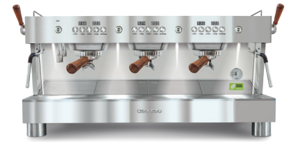
3GR Full Inox