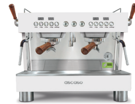
2GR Compact White&Wood