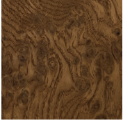
BURL OAK TOP