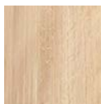
Oak Whitenened Oil