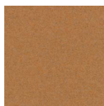
Divina MD 0433