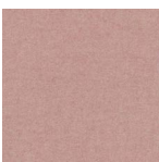
Divina MD 0613