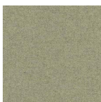
Divina MD 0913