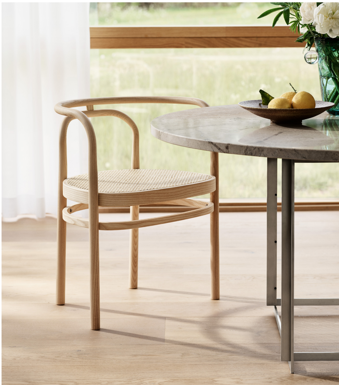
PK15™ PRODUCT FACT SHEET