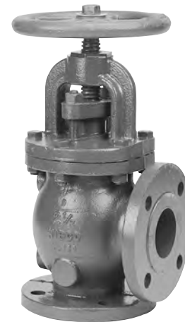
F-838-31 Flanged-Raised Face

Consult Factory for non-return feature. Fig. No. F-838-31NR.