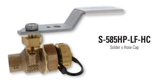
S-585HP-66-LF-HC with stainless steel trim also available.