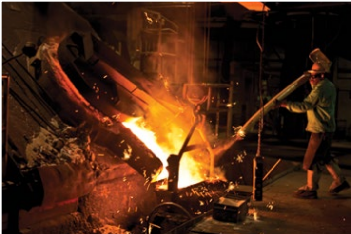
BLYTHEVILLE, ARKANSAS - FOUNDRY