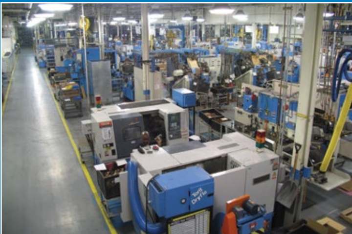
NACOGDOCHES, TEXAS - MACHINE, ASSEMBLE & TEST - PLANT