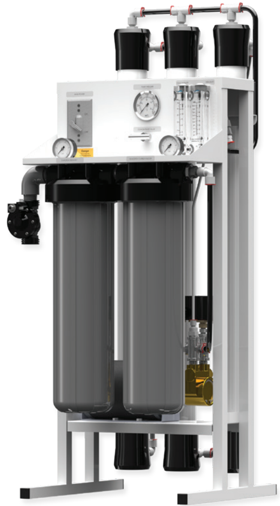
BT-2000 Reverse Osmosis System