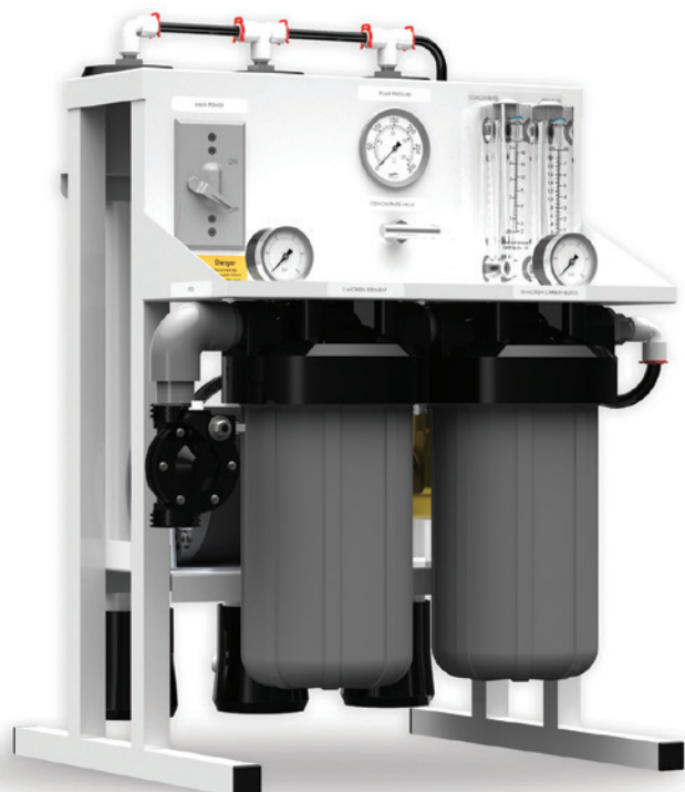
AT-1000 (Front) Reverse Osmosis System