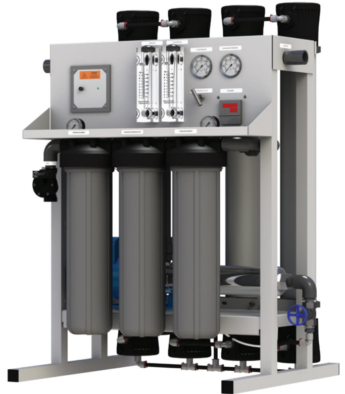
CT-7000 Reverse Osmosis System

AXEON CT-Series Reverse Osmosis Systems are designed for high performance and are equipped with many standard features in a cost-efficient, compact design. AXEON CT-Series Reverse Osmosis Systems have been engineered for capacities ranging from 4,000 to 7,000 gallons per day. These models include a microprocessor controller with low-pressure monitoring and alarm, pre-treatment lockout, and tank level input. A TDS monitor, multi-stage booster pump, low energy membranes and three pre-filters are all part of the standard features. Upgrades such as feed flush and a concentrate recycle loop to increase recovery rates are also available.