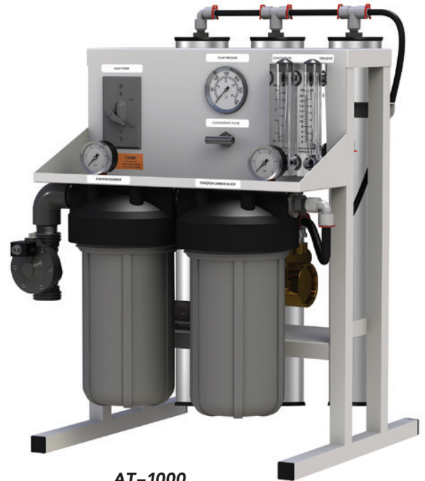
AT-1000 Reverse Osmosis System

AXEON AT-Series Reverse Osmosis Systems can also be upgraded for higher recovery rates by adding the concentrate recycle option.