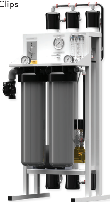
BT-2000 (Front) Reverse Osmosis System