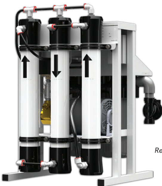
AT-1000 (Back) Reverse Osmosis System