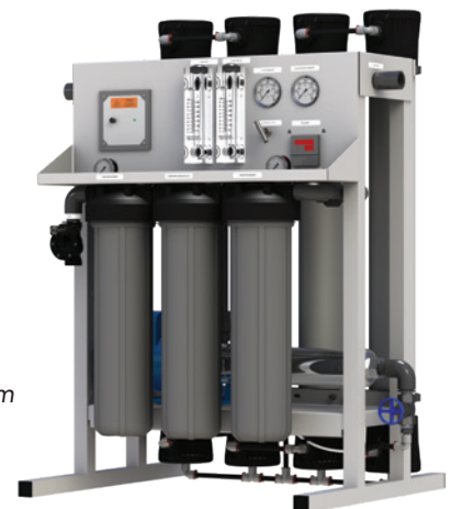
CT-7000 (Front) Reverse Osmosis System