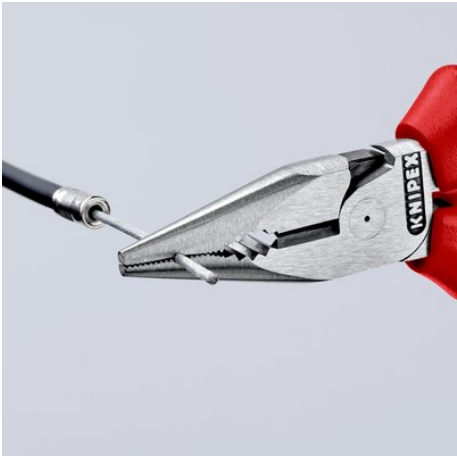
Milled groove in the gripping area